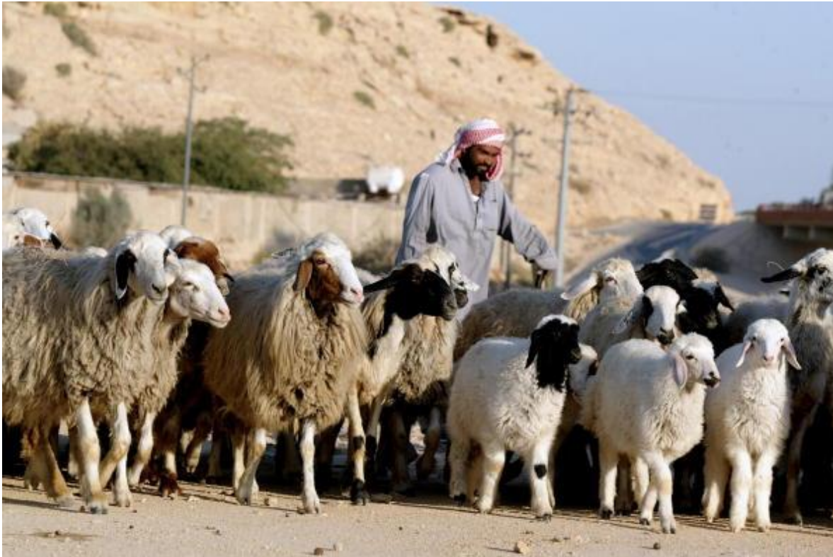
Shepherd in Saudi Arabia

Sheep in Saudi Arabia sell from $500 – 800 dollars per sheep. Sacrifices do still take place and one sacrifice that drives the price of sheep up is Eid which is a muslim holy day – “Breaking the Fast.”