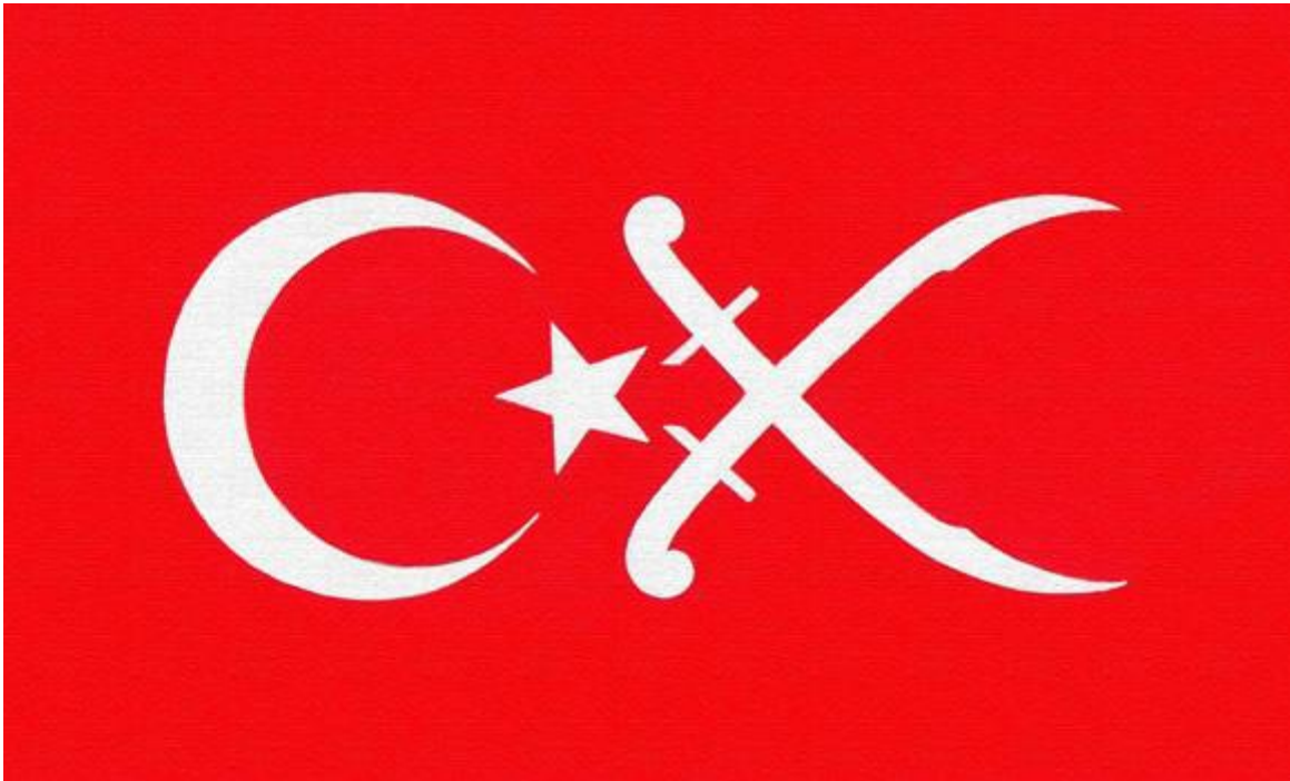
Ottoman Empire Flag