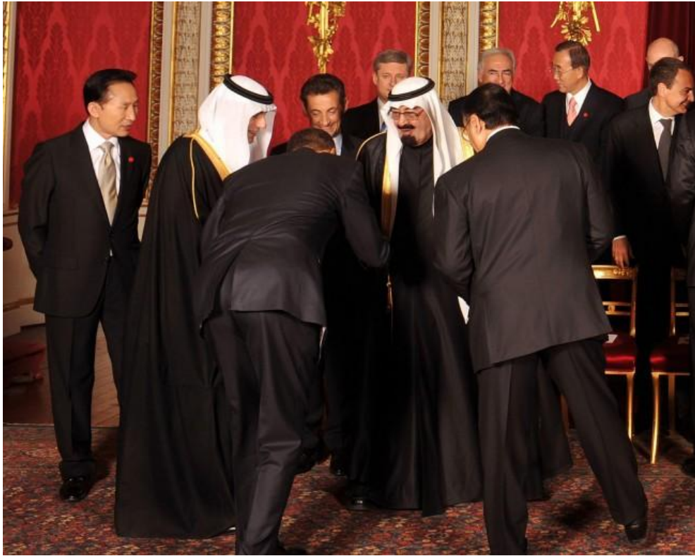
President Obama bowing to King Abdullah of Saudi Arabia