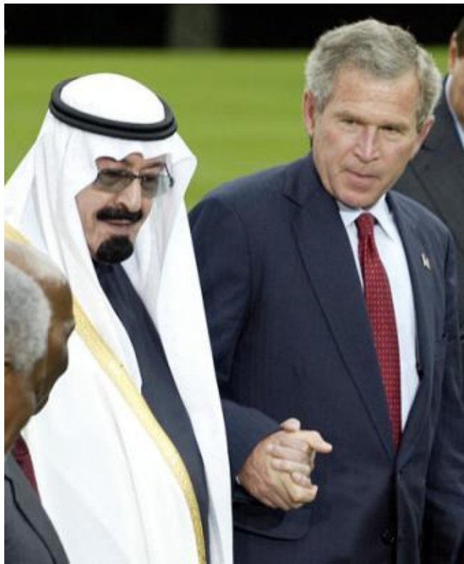
President George W. Bush holding hands with King Abdullah