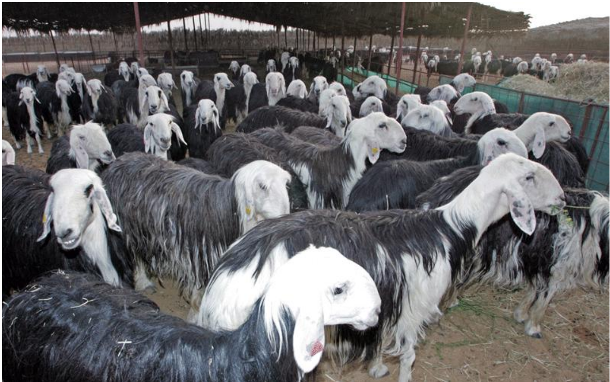
Najdi Sheep of Saudi Arabia

Shepherd's Tents. In rural areas, it is common to see Bedouin tents which house shepherds who mind their charges of sheep, goats, or camels.