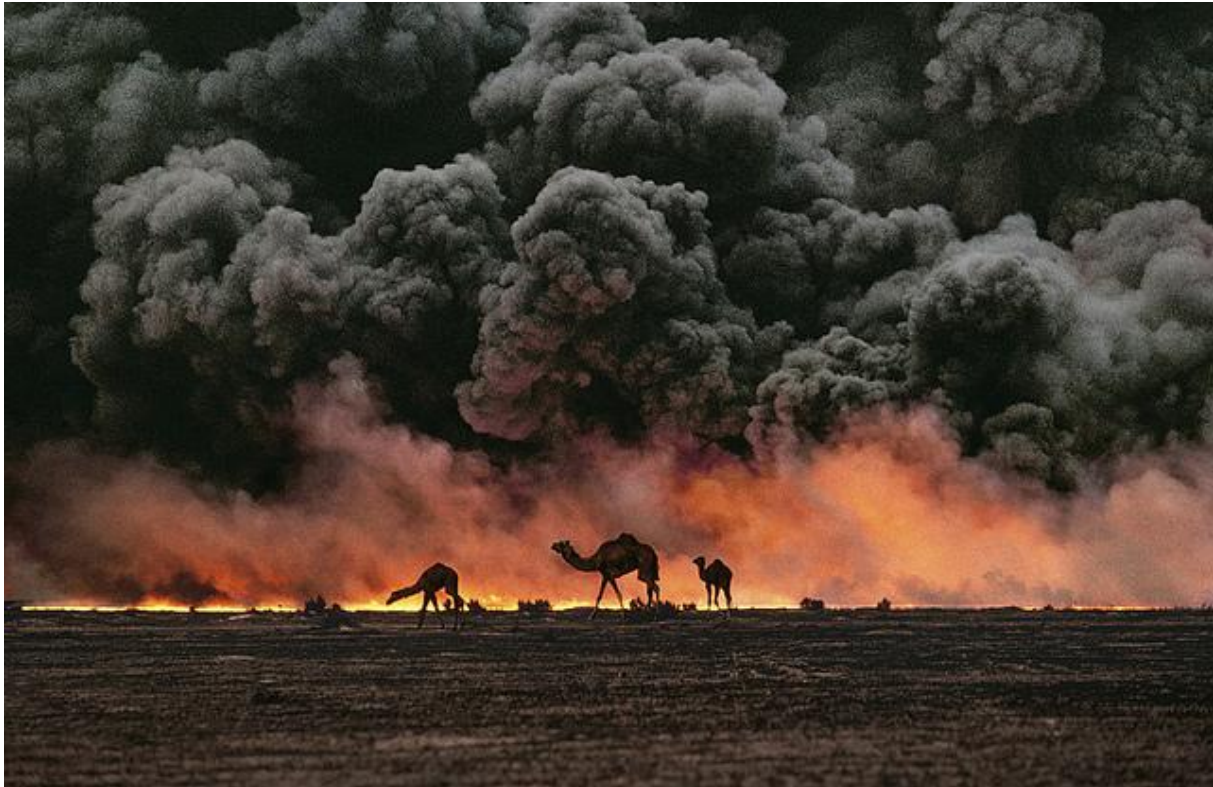
Kuwait – Gulf War

When Saddam set fire to the oil wells in Kuwait, it took about 10 months to get them all out and finally cap the last well. No one could even get near the fires for a few months they had to burn out of control. Saddam urged the Kuwaitis to forgive the Iraqi debt accumulated in the war, some $30 billion, but they refused. Saddam pushed oil-exporting countries to raise oil prices by cutting back production; Kuwait refused, however. In addition to refusing the request, Kuwait spearheaded the opposition in OPEC to the cuts that Saddam had requested. Kuwait was pumping large amounts of oil, and thus keeping prices low, when Iraq needed to sell high-priced oil from its wells to pay off a huge debt. ---Wikipedia