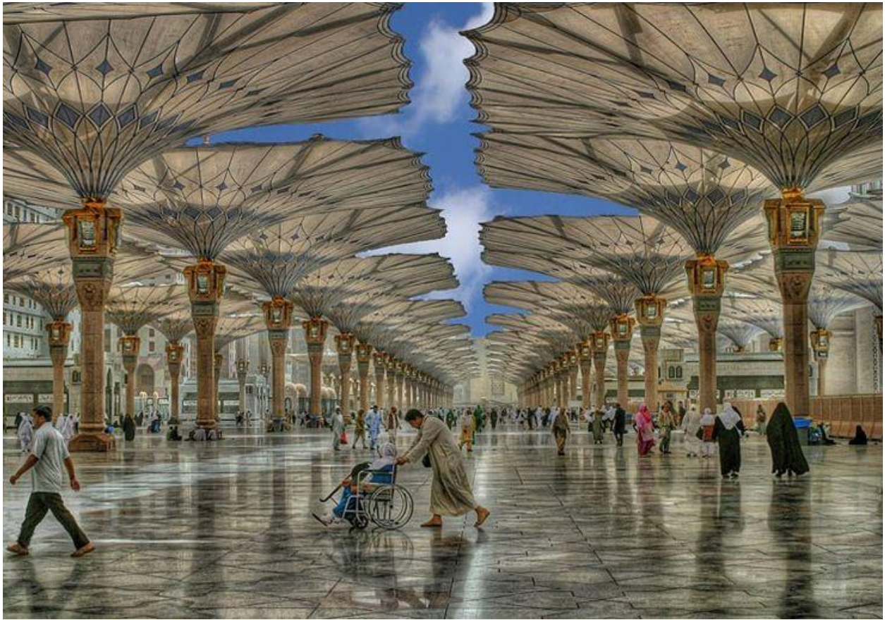
MEDINA – the city where Muhammed's tomb is