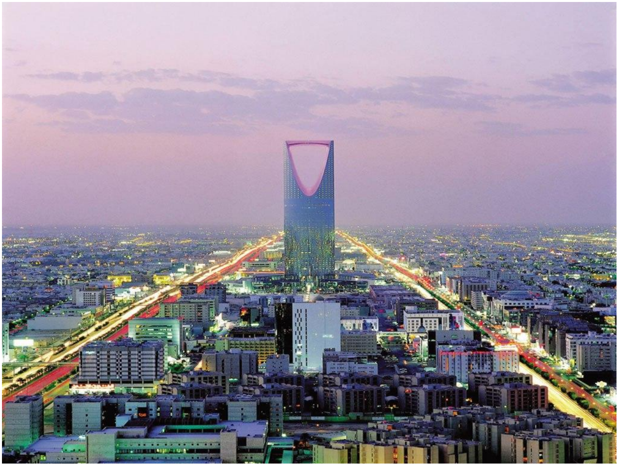
Riyadh La Misteriosa Capital de Arabia Saudí

Today we are still covering more information on this topic. I have already established that I believe Mystery Babylon is Saudi Arabia based on scripture in my previous two messages. As I study into this place I have been seeing just how flowing with riches it really is. Such beautiful buildings and art work and seemingly no expense has been spared. Especially in Mecca and Medina. Today we will also talk about what a decadent place it is.