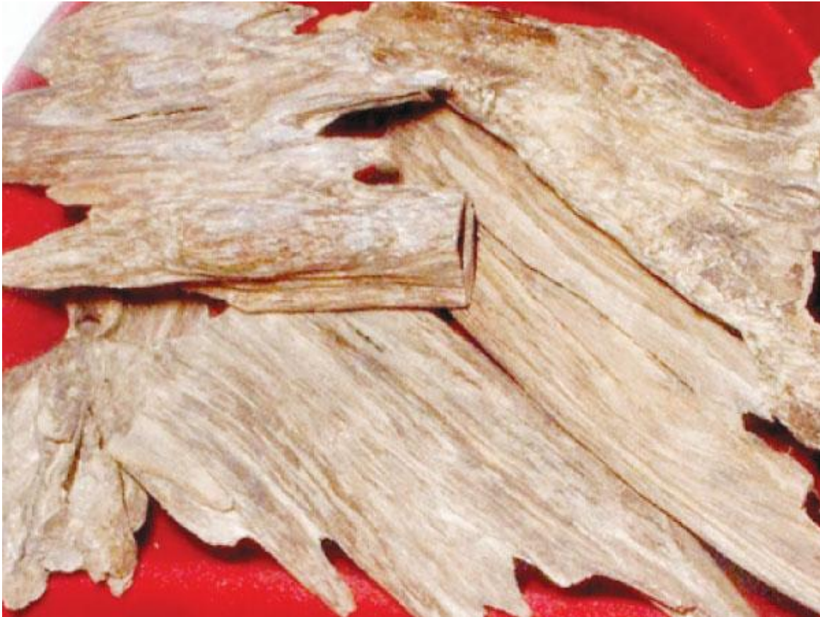
Oud, scented wood (precious wood)

As rare and precious as gold, Oud is as synonymous with Arab culture. It is a dark resinous wood known for its distinct fragrance and is found in the Aquilaria and Gyrinops trees commonly found in the Assam state of India. Burning incense in Arabic is called “Bukhour”. Depending on the quality, the prices of oriental fragrances can reach up to SR (Saudi Arabia Riyals) 60,000 per kilo. Which is almost 16,000 U.S. dollars.