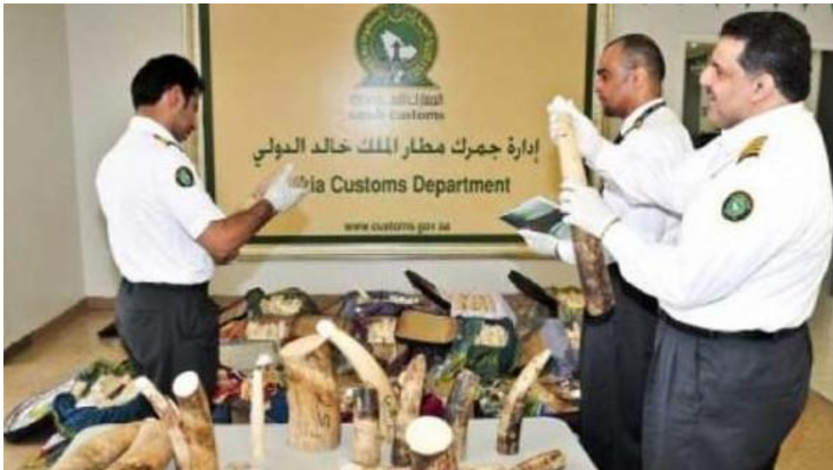
Saudi officials seize half ton of ivory at Riyadh airport