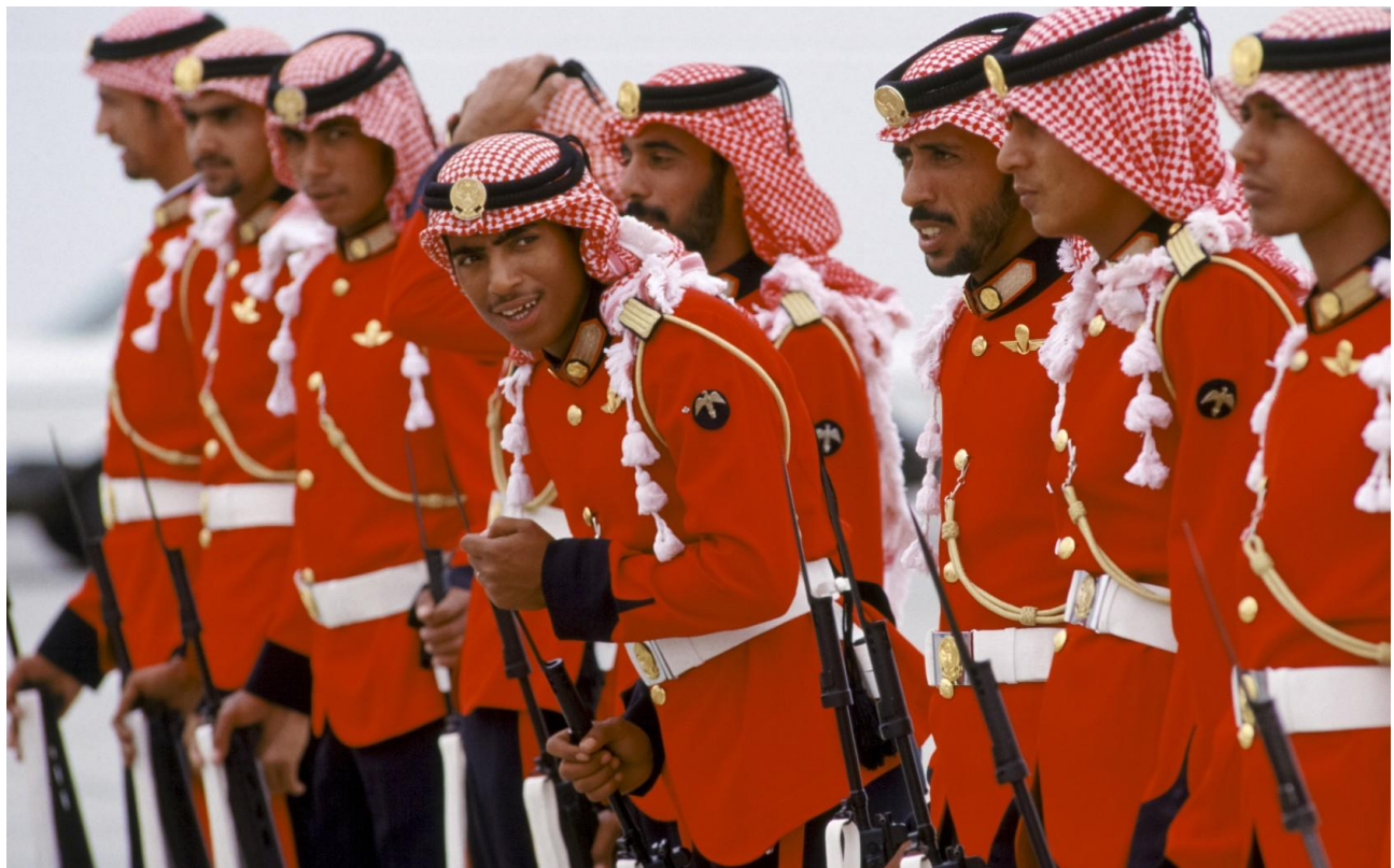
Keffiyeh or ghutrah: Traditional Arab headdress – scarlet.

Many carpets and rugs are in scarlet. Such as the ones in Muhammeds mosque.