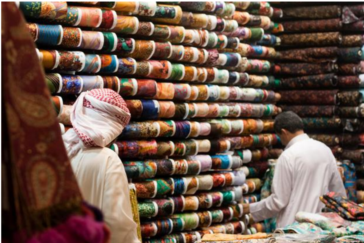
Mecca's Market during the Hajj

V.11 – weep and mourn because their merchandise is not bought any longer