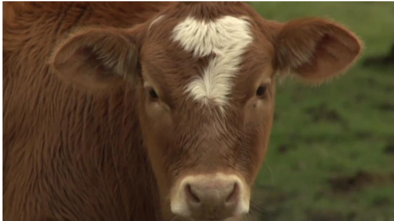
Page 2 of 12