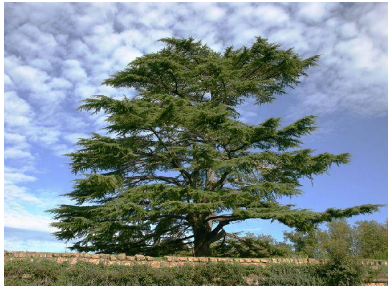
Cedar tree of Lebanon

The cedar wood has a sweet fragrance, depicting the sweetness of the aroma of the sacrifice of the Messiah who died for us; the hyssop depicts the astringent cleansing and purification of His sacrifice, removing all sin. "Purge me with hyssop," David prayed, "and I shall be clean: wash me, and I shall be whiter than snow" (Psalm 51:7). The "scarlet" depicts the red blood, the source of life. The life of flesh is the blood (Genesis 9:4). YEHOVAH says: "For the life of the flesh is in the blood...it is the blood that makes atonement for the soul" (Leviticus 17:11). www.hope-of-israel.org