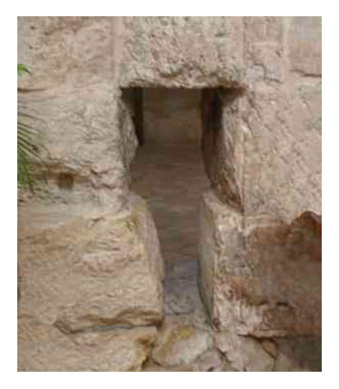
Needle gate (eye of a needle) going into Jerusalem

You can read a story of a prosperous farmer who stored up many good for himself in Luke 12:13-21. He stored and saved up so much and then God said this to him: Luke 12:20-21 – But God said unto him, You fool, this night your soul shall be required of you: then whose shall those things be, which you have provided? So is he that lays up treasure for himself, and is not rich toward God.