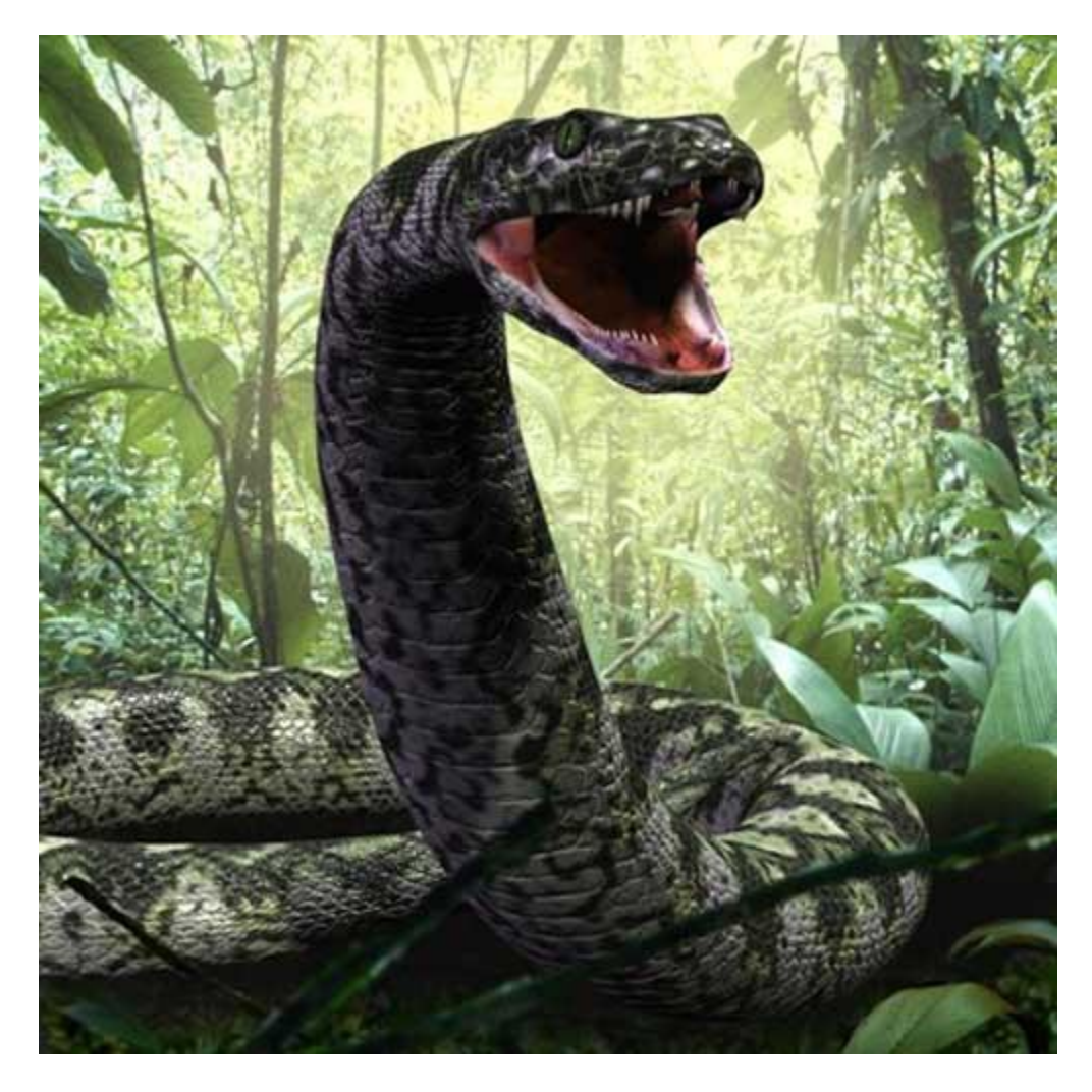
Titanoboa – 48' long and 1 ½ tons

She said there was a snake down there as big as a train and that its head was as big as a locomotive.