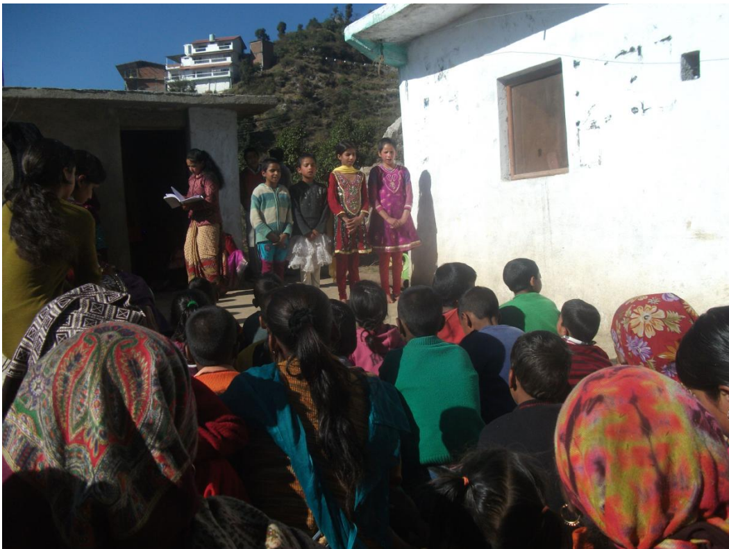
The hostel children are performing a play of the birth of Jesus Christ.