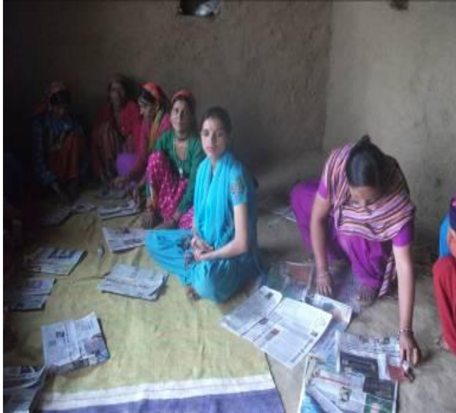
Here poor women are making paper bags to sell for income generation.