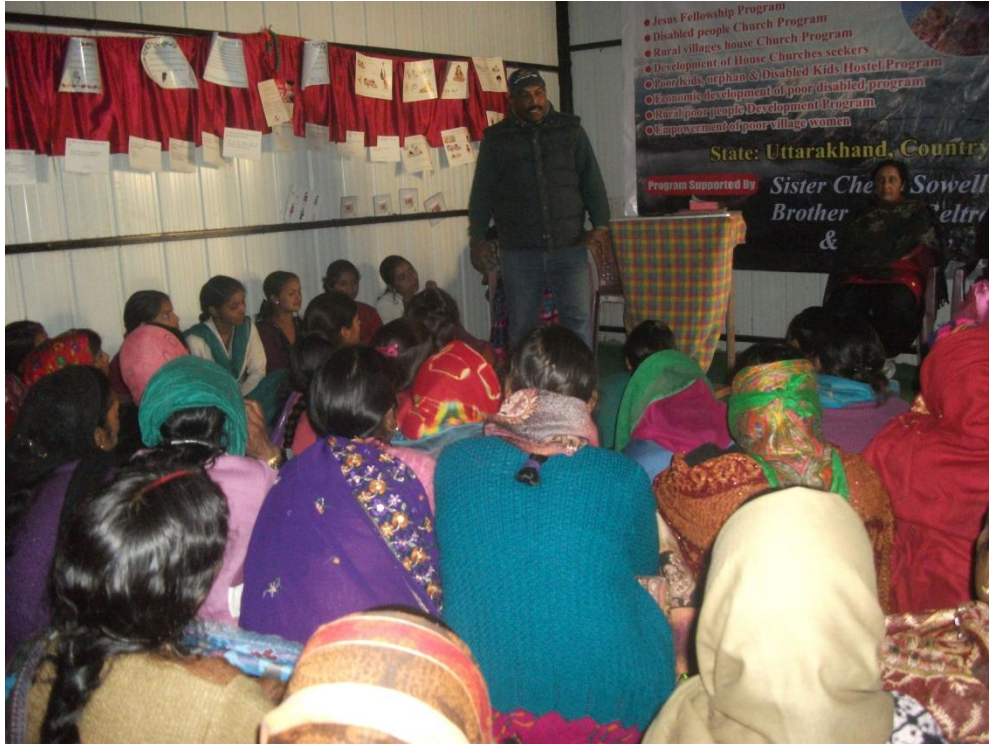
Hearing the gospel in the new church!