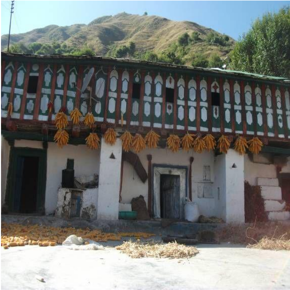
Maize hanging out to dry.