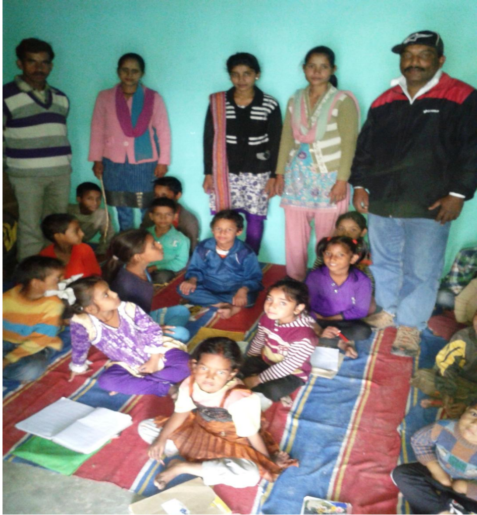
Another picture of a playgroup. So far there are five play groups in all.