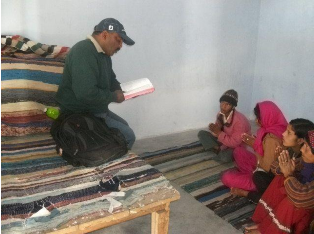
Sharing God's Word on his village trip.