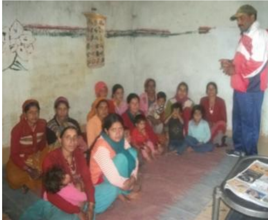
The gospel is shared through preaching and Bible study.