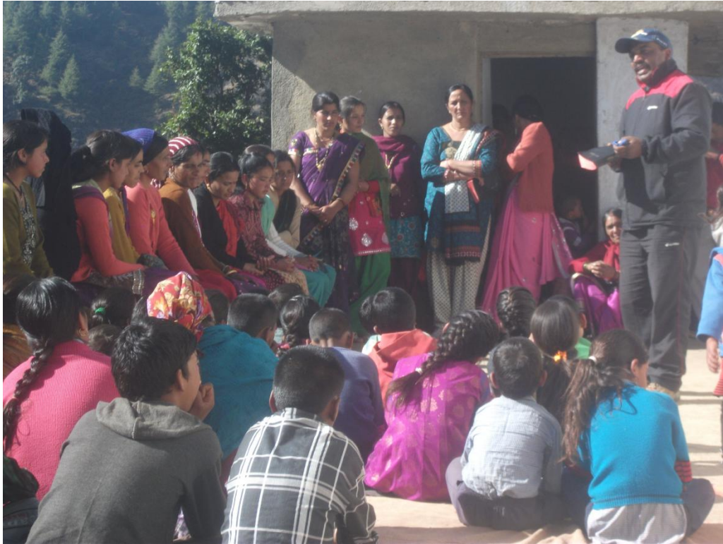
Sharing God's Word at the fellowship meal.

There are more needs in this ministry than what are being met. Here are some of the current needs: