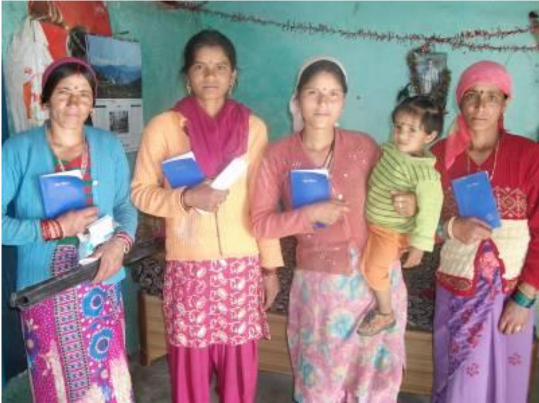
These women passed the literacy test and were given Bibles to read.