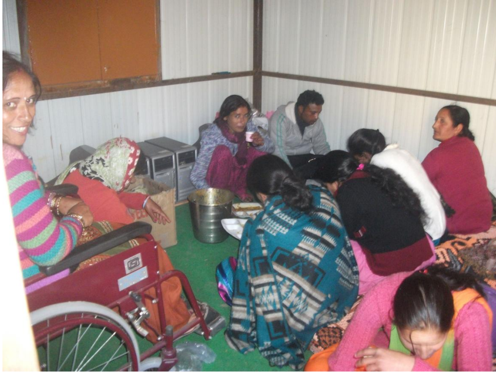
Disabled young lady participating in the fellowship. Pastor Dalbeer's ministry has implemented some activities with the poor rural people for the empowerment of persons with disabilities.