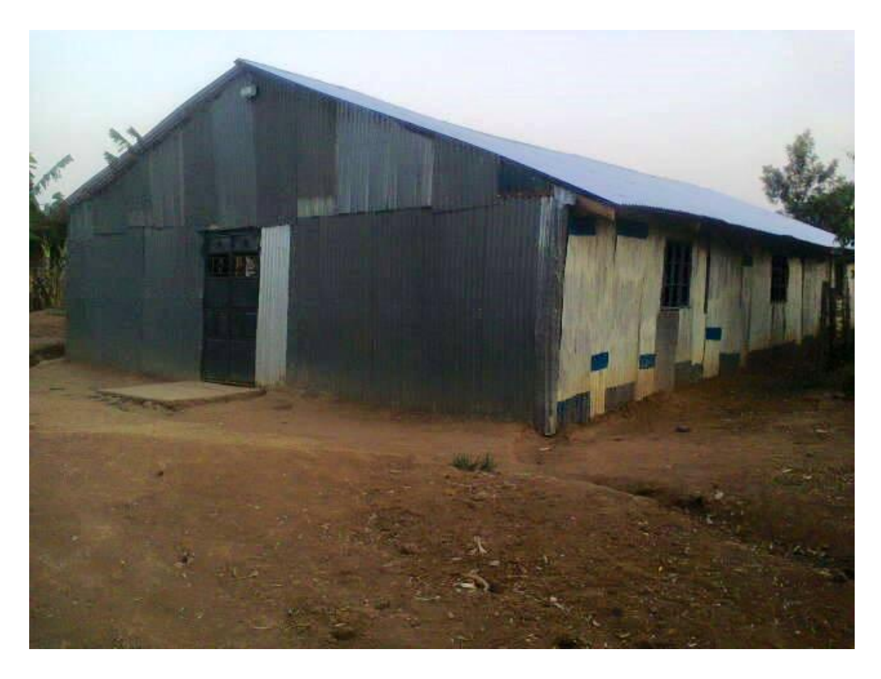
The new church before it was painted. This is a temporal structure.