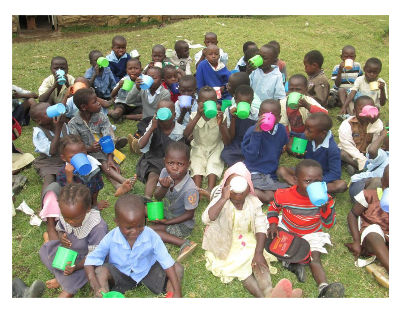
School children having something to drink at lunchtime.

The ministry helps with shoes , uniforms , clothes , stationery, medicine and salaries for teachers and other workers. They were able last year 2014 to buy ½ a Hectare of land on which they are praying for God to help them construct and build the school classrooms, office, kitchen, toilets, store etc. At the moment they are using a rental building to hold school. Pastor also has a vision to buy more land near the church and establish another Orphanage to assist many helpless children in this Muslim land to get education and have technical skill capacity building schemes e.g Tailoring , carpentry , masonry , computer trainings etc. to help the children in this land and the poor in this area.