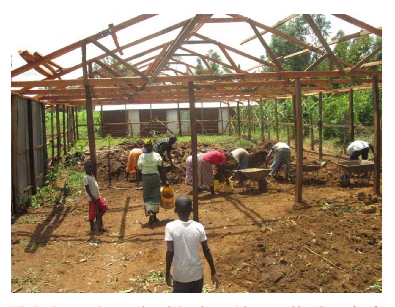
The Lord answered prayers through donations and they were able to buy a plot of land and build a temporary structure for the church there.