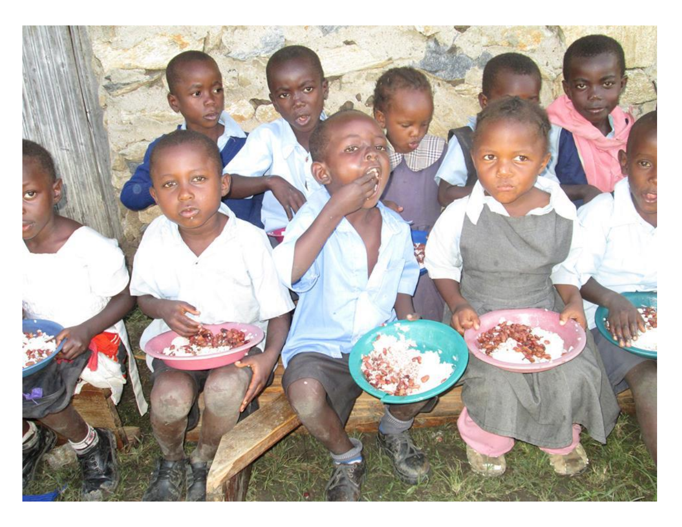
His ministry helps these children with food; School children eating red beans and rice for lunch.