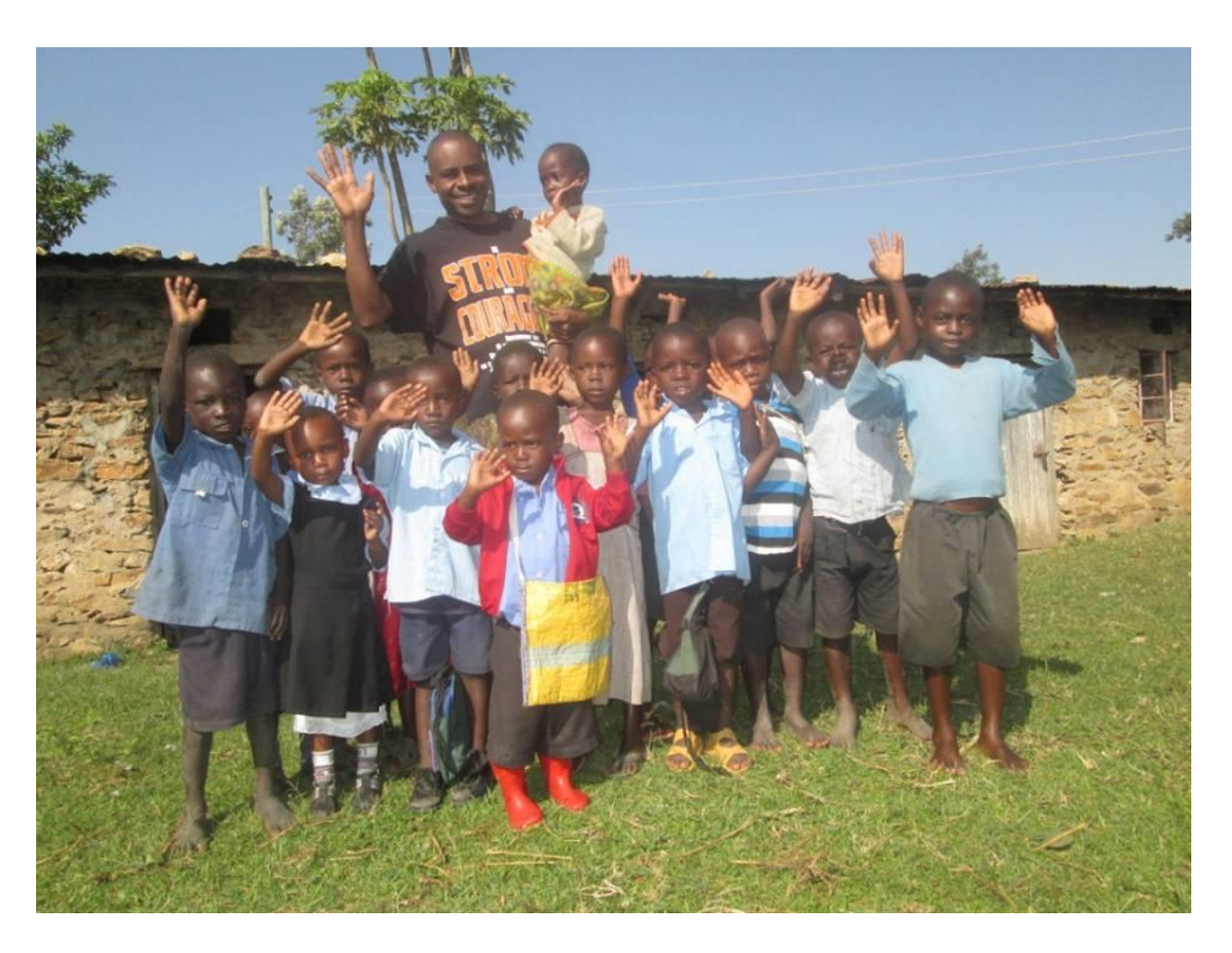
Pastor pictured here with some of the orphans and students of the school.