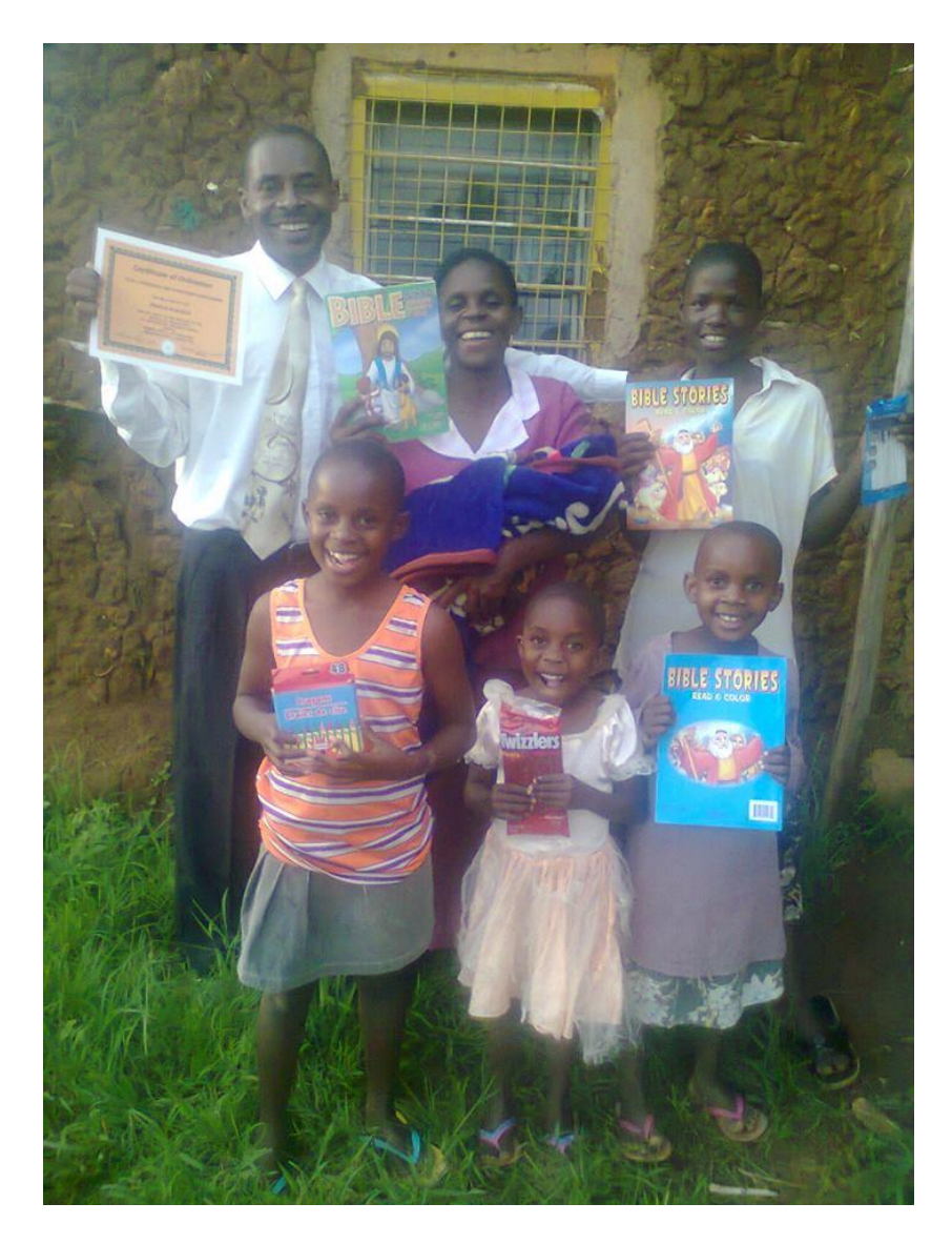
They have four little girls.