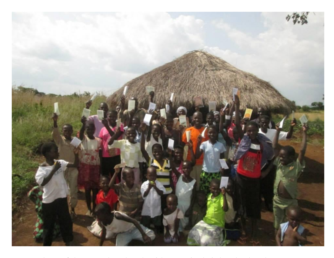
Members of the Ugandan church with tracts in their hands, that they are very happy to receive.