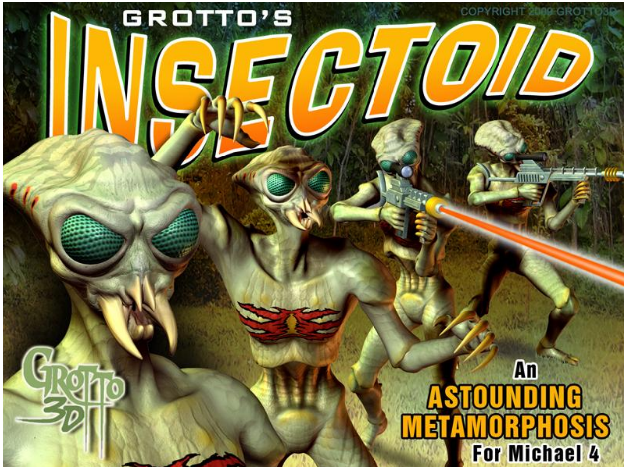
Mantid or Insectoid Alien/Demon