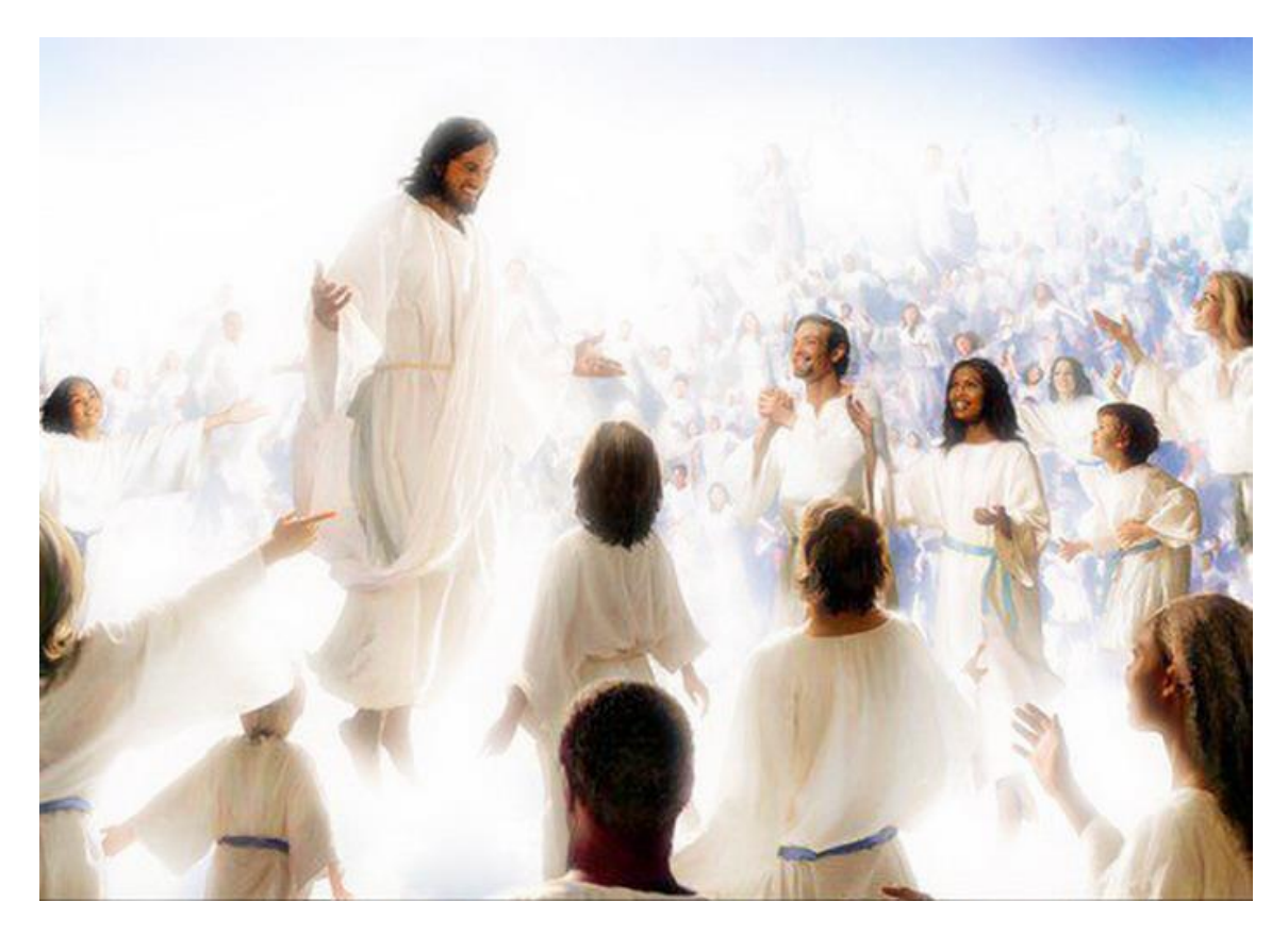
What a glorious day that is going to be!

The next harvest is the main harvest. This is of the 144,000 sealed Jews/Israelites and the mid tribulation martyrs.