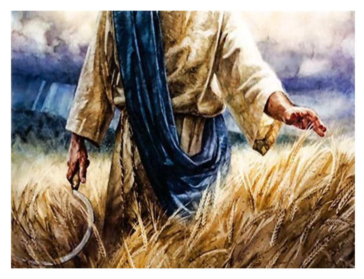
Jesus is the Firstfruits unto God

The Bible teaches the concept of sewing and reaping. A time of planting and a time to harvest. The Lord laid out specific rules for harvesting. When your first fruits began to come in you would cut a small portion out of the field and take it to the high priest to wave as an offering before the LORD. By doing this you were offering thanksgiving to God for your harvest and this is how you would receive His blessing on the rest of your harvest to come.