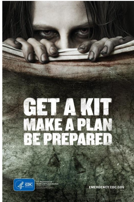
Government poster about Zombie Apocalypse

A few years later the Department of Defense (DOD) followed suit and developed an entire training course intended for the Joint Operational Planning and Execution System (JOPES). The complete response plan, called CONPLAN888, was recently declassified, and it's just as weird and creepy as you might imagine. The Black Vault posted two documents retrieved from the NSA using the Freedom of Information Act.