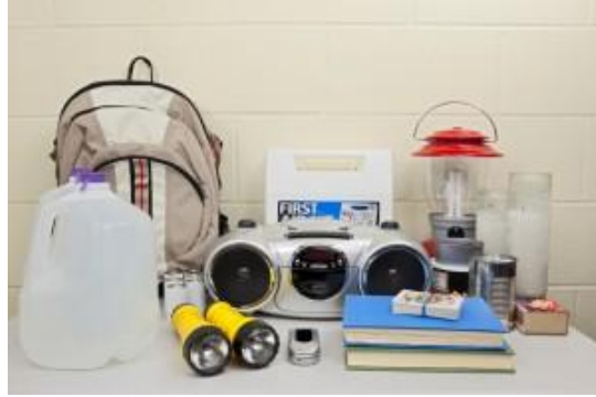
Some of the supplies for your emergency kit