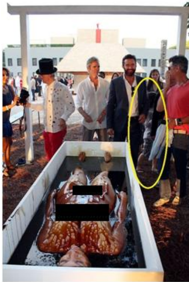
You can see another little child here in this picture as well.