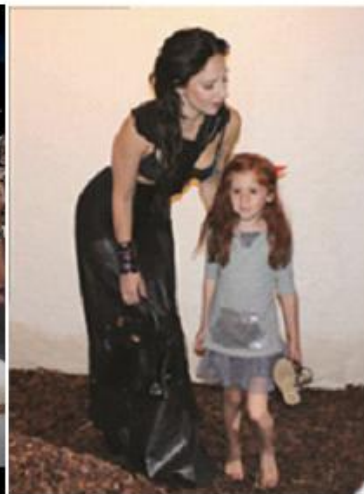
(L) Lady Gaga and Marina Abramovic (of 'Spirit Cooking' fame) attend a benefit at "Devil's Heaven" where guests partook in pretend cannibalism (R) Lady Gaga poses with a "friend" at the same event. Why was an unsupervised young child attending this gruesome event?