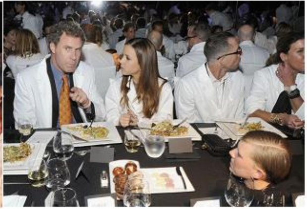
2011 MOCA (Museum of Contemporary Art) Gala