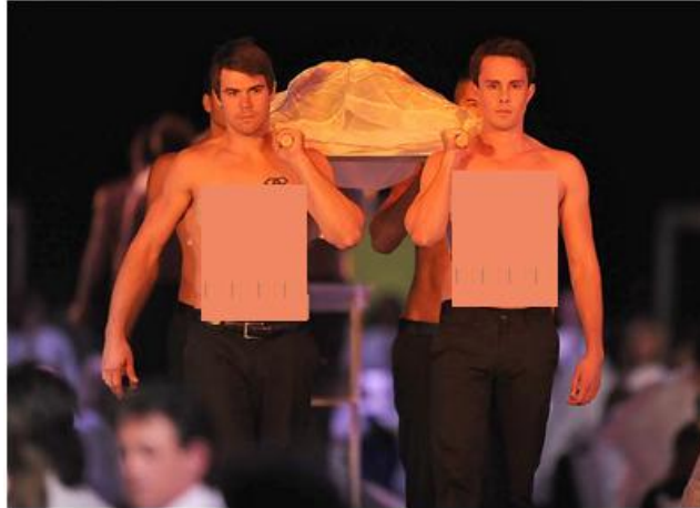
2011 MOCA (Museum of Contemporary Art) Gala