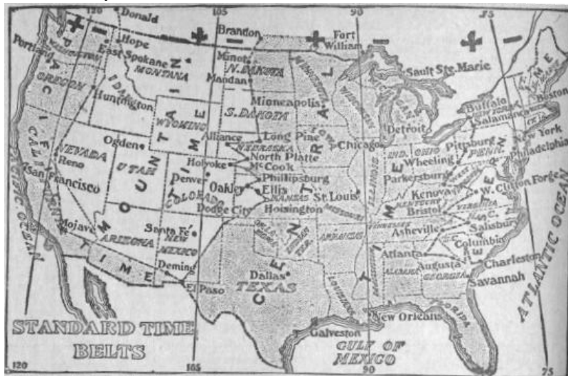
Time zones in 1913 in the U.S.A.

Some countries have many time zones, others are just 30 minutes difference from their neighbours while others still change their time-zones and even days to for economic reasons if they trade with a richer state in a different time-zone. Countries or parts of countries can change their time-zones quite radically. Look at these two time-zone maps showing how time has changed in the United States in the last century.