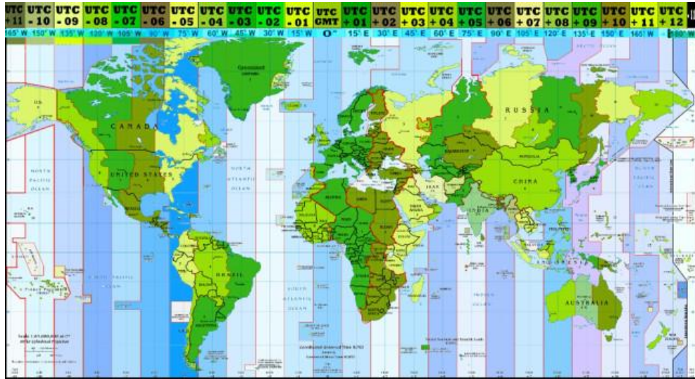
International Time Zones / UTC = Coordinated universal time zone.

The Centre of Time. On the left of the line you are in the Western Hemisphere and on the right, the Eastern Hemisphere