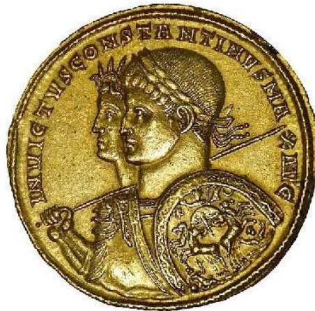
Gold medallion minted in 313 AD of "Constantine with Sol Invictus"

This is a coin with Constantine and the sun god – “sol invictus” – the unconquerable sun. Constantine was a Roman and he was a worshipper of the fallen angels and never renounced any of this publicly.