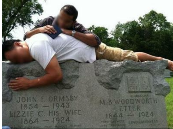
BSSM Students on ministry trip "soaken up the glory" at Maria B Woodworth- Etter's grave.