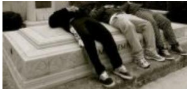
BSSM students catching some anointing from Aimee McPherson's grave.

They are basing this teaching on the following scripture: