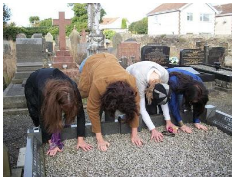
2nd Year BSSM students "sucking up the anointing" at the grave of Evan Roberts.