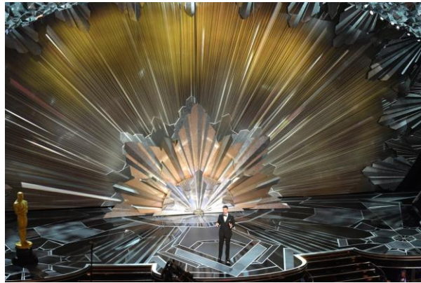
Sun worship – fire and ice.