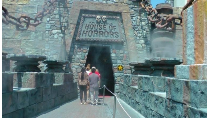
Universal Studios House of Horrors