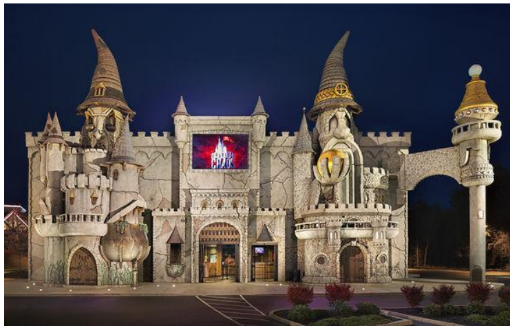
Castle of Chaos close to the Hollywood Wax Museum. Notice on the witch/wizard on the right there is a sun cross symbol. This is blatant abomination to God who is opposed to witchcraft, sorcery, idolatry.