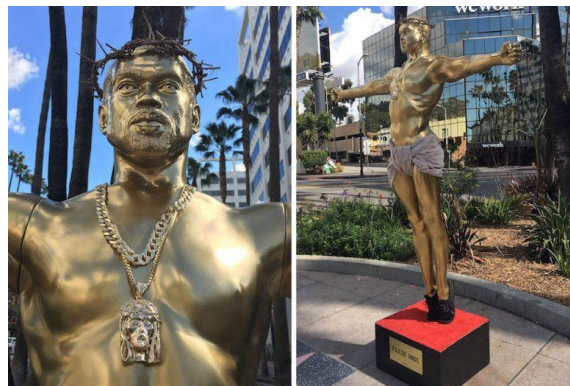
Kanye West mocking Jesus Christ