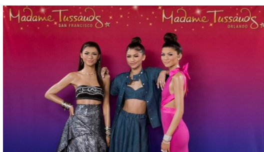
Zendaya posing with her wax figures.