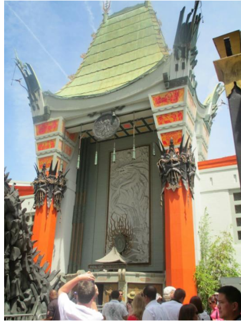
Looking, taking pictures – idolatry.