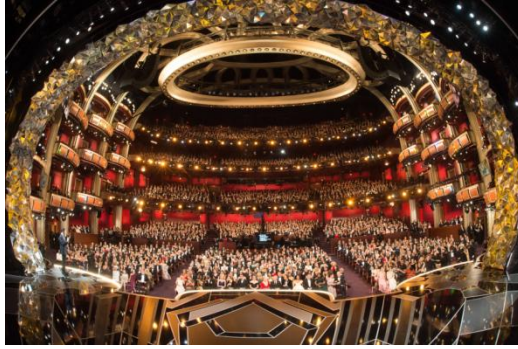
All seeing eye / Golden age.