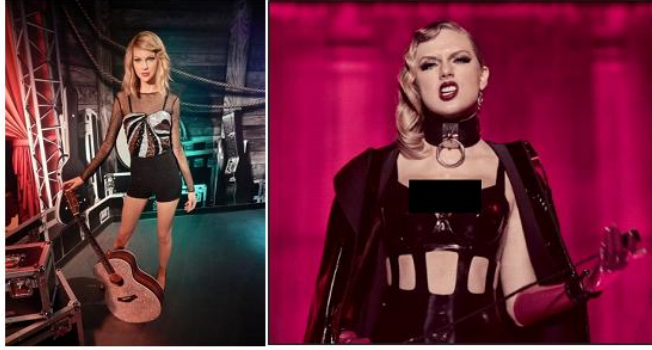
L: Old Taylor Swift in wax R: New Taylor Swift in real life