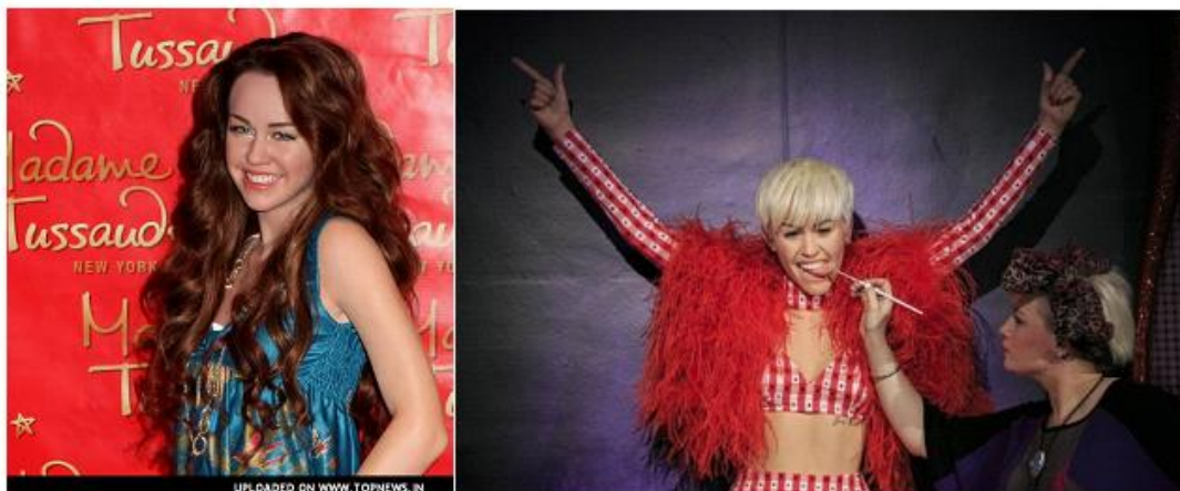
L: Old Miley Cyrus in wax R: New Miley Cyrus in wax. Worshipped by so many children.

The “new” Miley is a picture of what Hollywood (those behind the scenes) do to those innocent children they get their hands on. They rape, abuse, molest and sodomize them, program them through MK Ultra, Monarch and when they have a break down this is what you get.