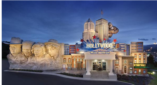
Hollywood wax museum to memorialize the stars.