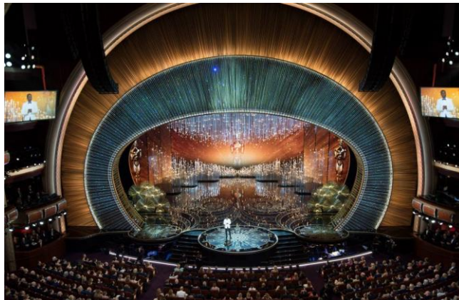
Eye of osiris/horus/satan – all seeing eye.