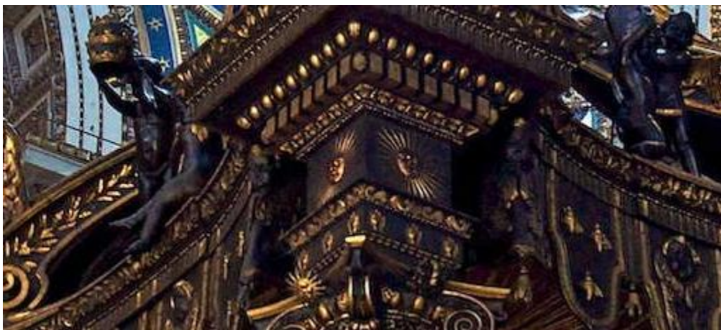
Sun worship plain and simple – worshipping baal.