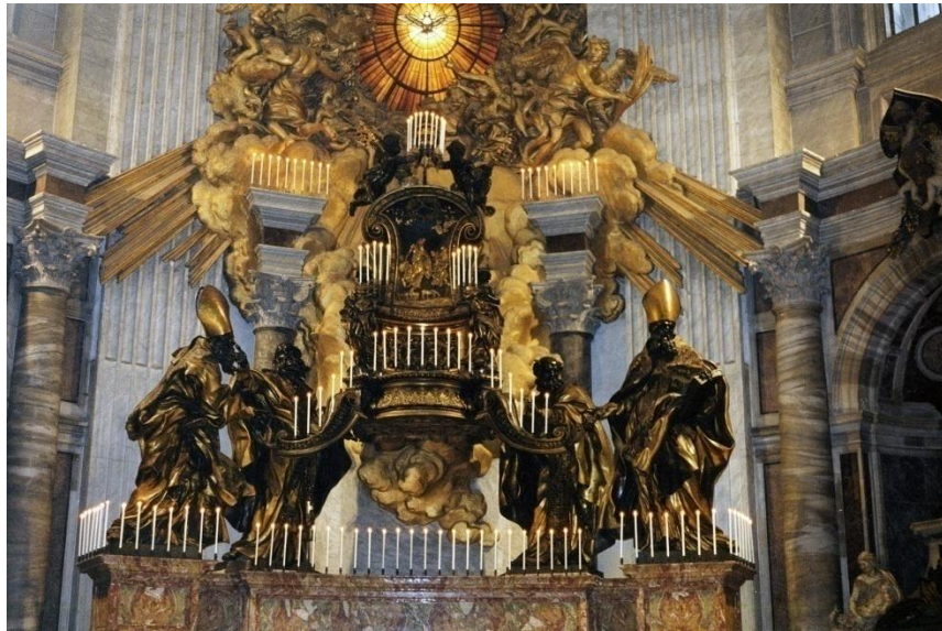
St. Peter's throne in St. Peter's Basilica in Rome