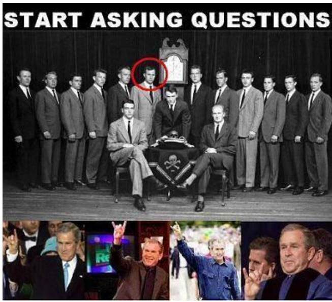
Former President George Bush standing by the clock. The skull is supposedly Geronimo's skull. A collage of Bush hailing his god lucifer.