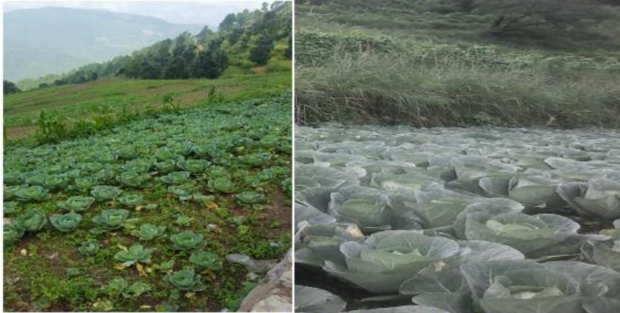
Helping the villagers to sustain themselves. Cabbage