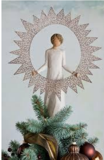
This is sun worship.

Witches worship the goddess who is Ashtaroth and she has 1000's of names. They also worship the "great god pan" who is satan and he also has 1000's of names. This is also known as the star of venus.