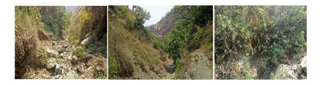
This is the valley for the catchment area so we digging on the mountain for collecting the water.