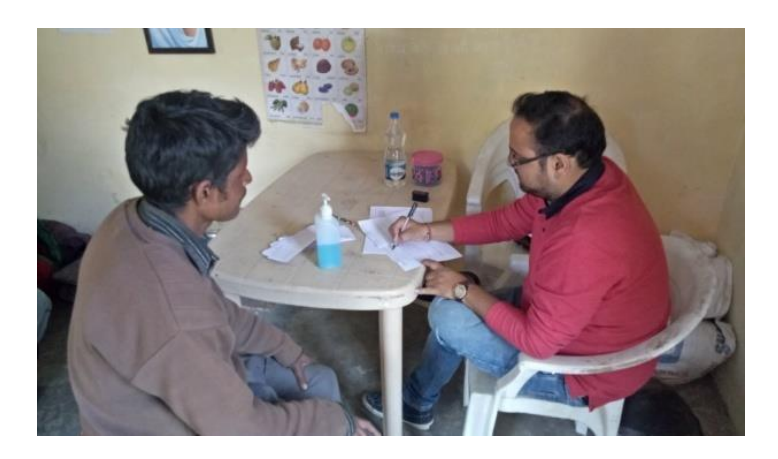
I thank God for providing us the doctors to see the poor communities in the village.

camp in these villages and we were that capable to provide the medicine in the village and want to thank all our three heart congregation who came forward to help us through their donation for these poor rural Himalayan community.