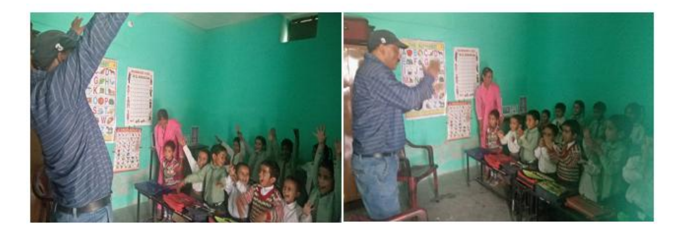
The time with our school kid .it is very great moment for us because in the school other religion children listing our Christian value teaching.