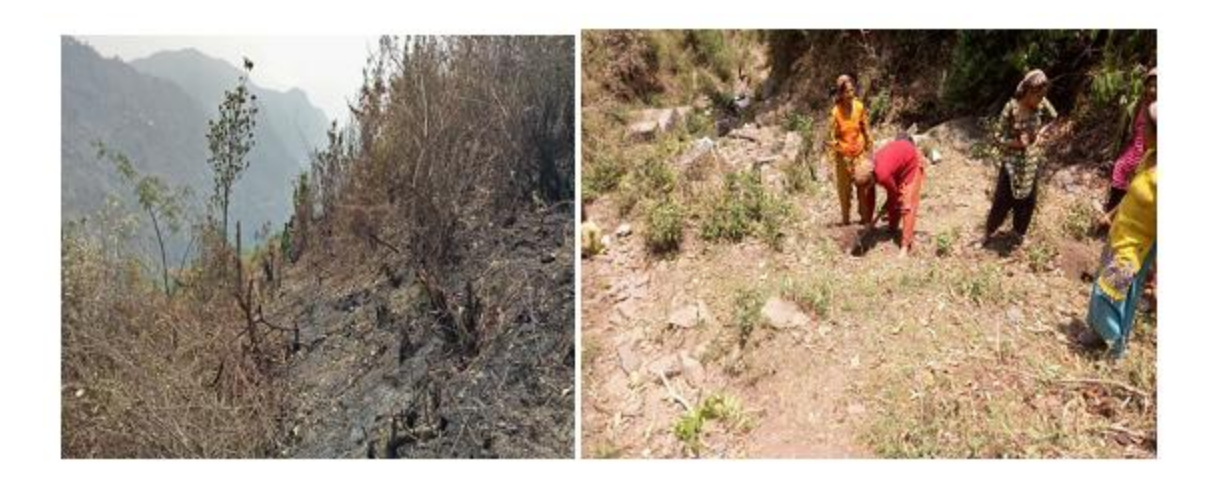
The village women of SHG group are working for making this mountain into stream.

Please pray for God to cause the river to flow for water catchment.