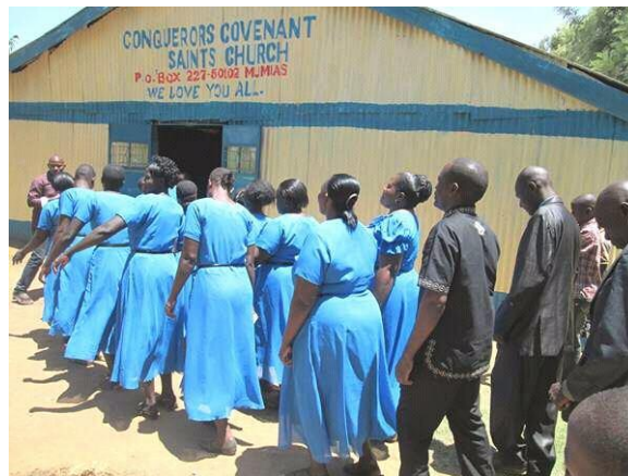
Ekeru Market, Mumias Town church