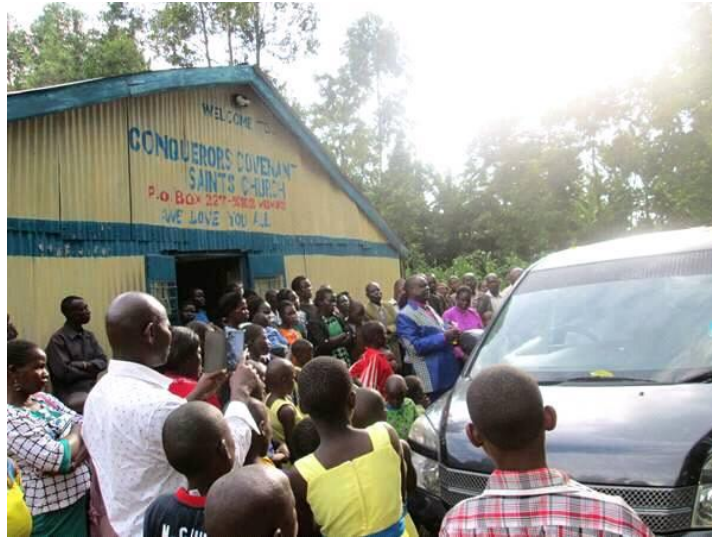
Outside of the church in Ekero Market, Mumias Town