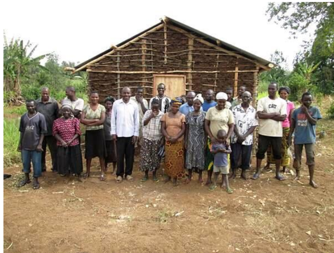
The Butere Town church.