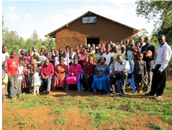
Butere Town church members.

In Town buying plastic chairs for our Butere Town church.