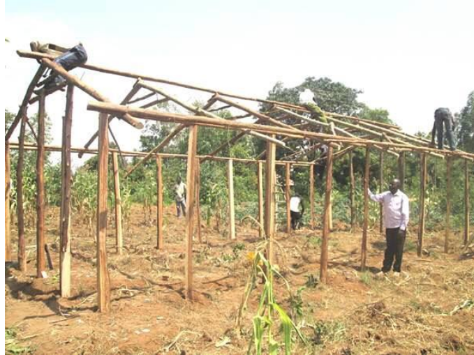
Our Ebubole village church during construction.