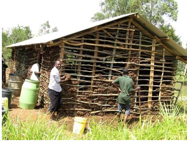
Putting mud wall on our Mwichisi village church, Butere Town.