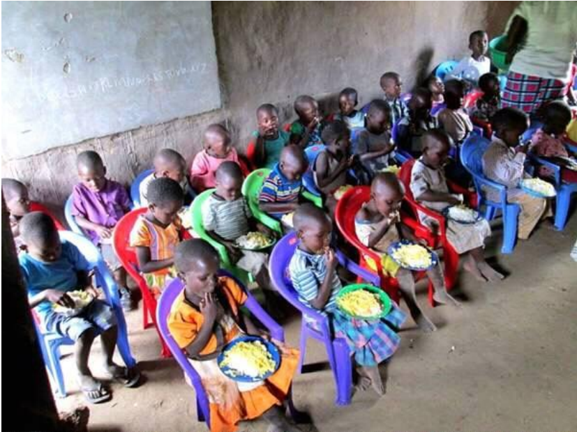
Our Uganda Victorious School Academy enjoying their meal.

Picture of plastic chairs we bought for our Uganda school children. This is a rented facility where we are holding school for now until we can build a school.