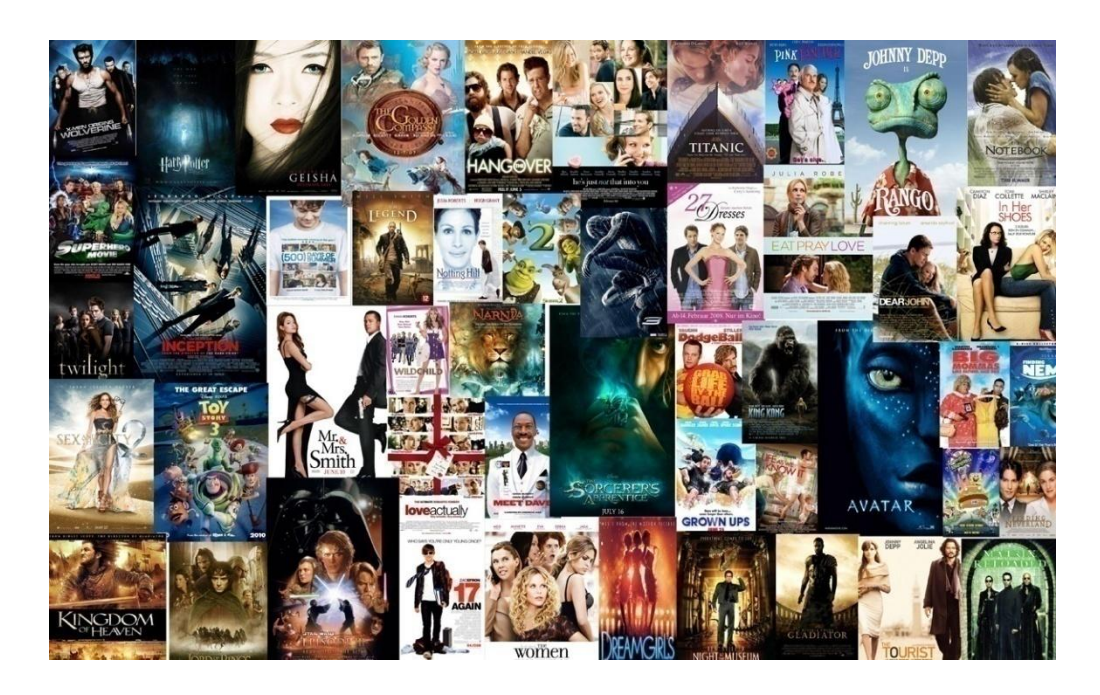
Page 2 Movies are used to acclimate the next generation that this technology is being done and they should accept it when it is finally revealed to them.