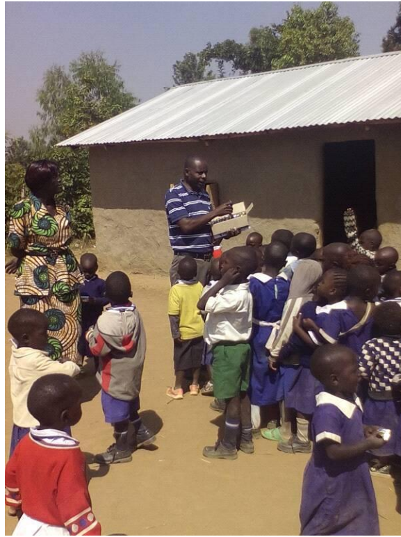
Pastor is passing out some biscuits to the children.