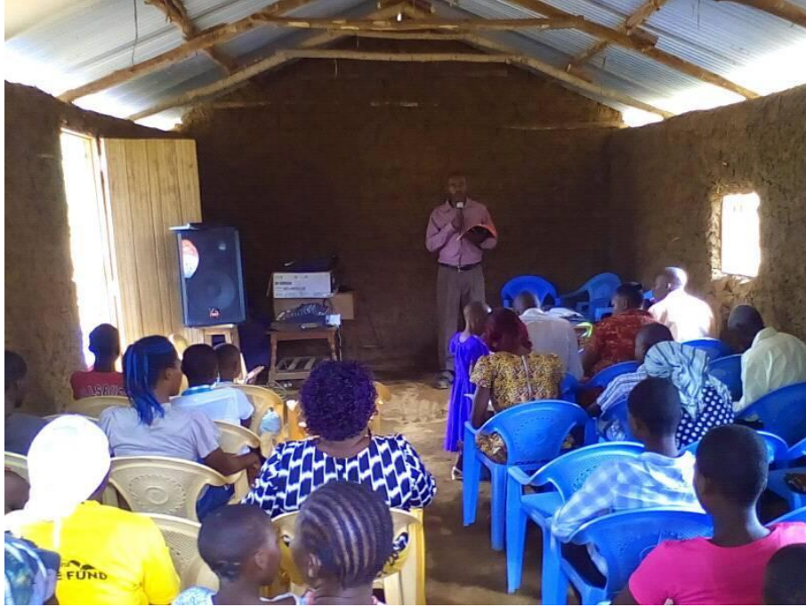
Faith comes by hearing.