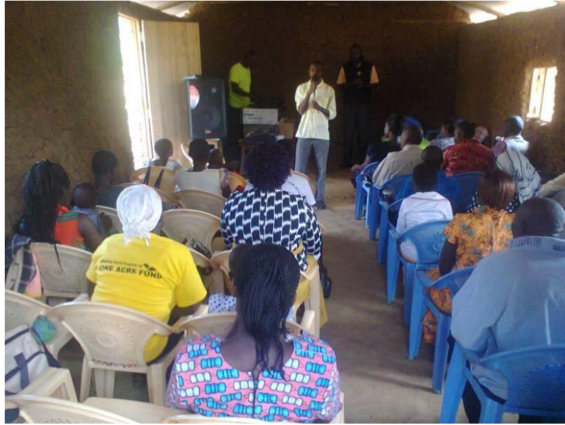
Hearing the Word of God.