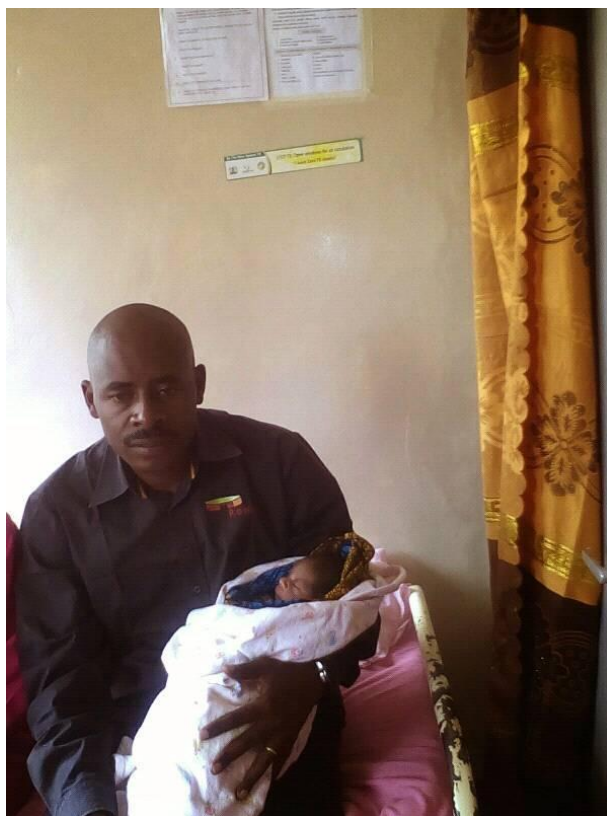
A father and son.