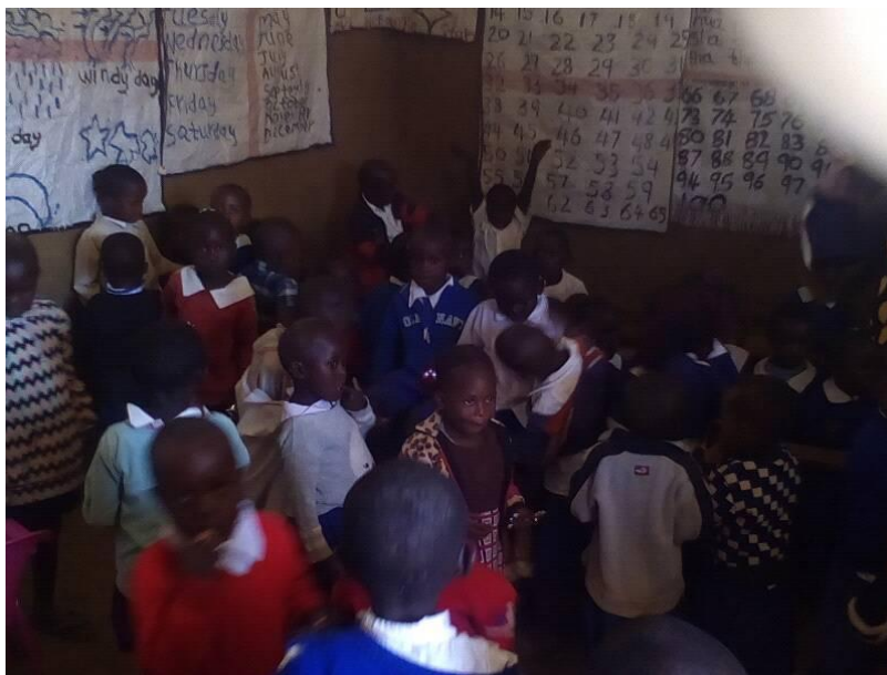
The children in their school.