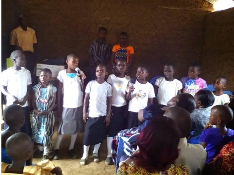
Jesus said, let the little children come unto Me.