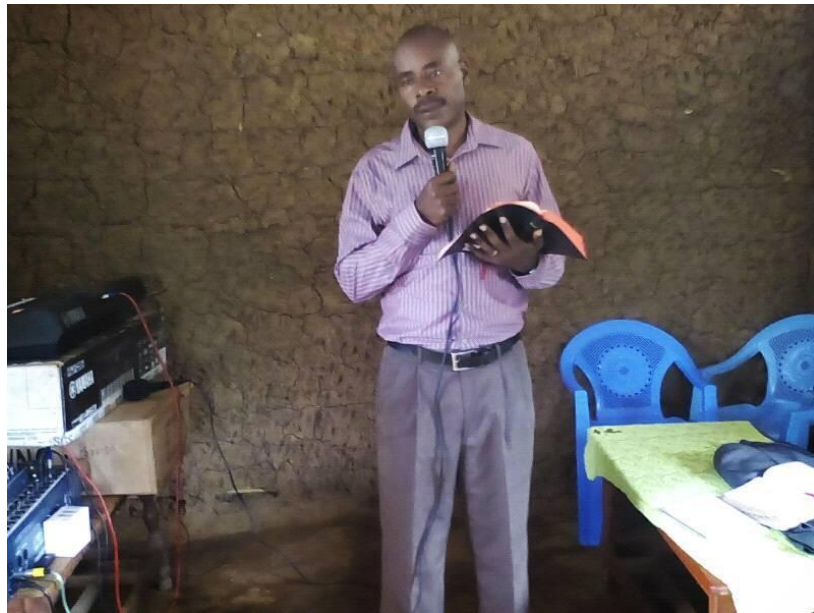
You are helping to send this man of God.