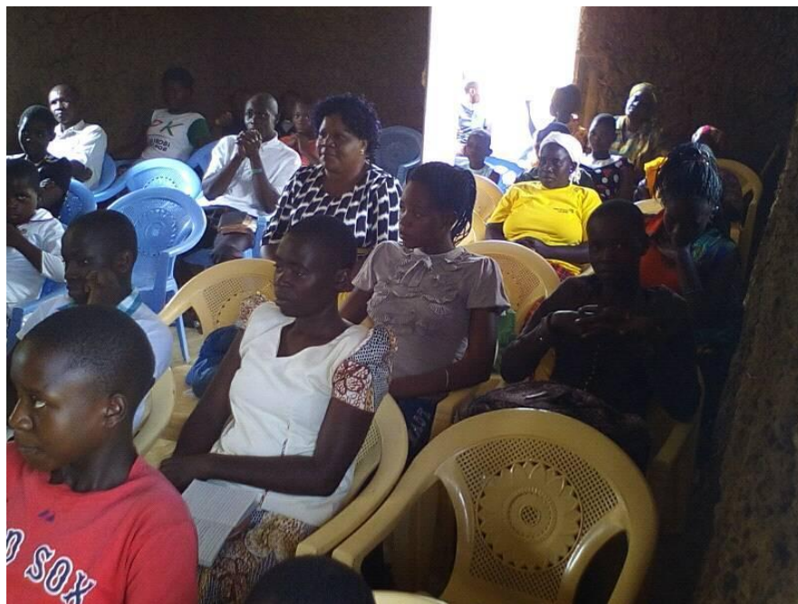
Feeding on the Word of God.