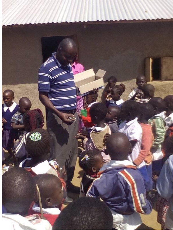
They are so happy to receive any treats at all.