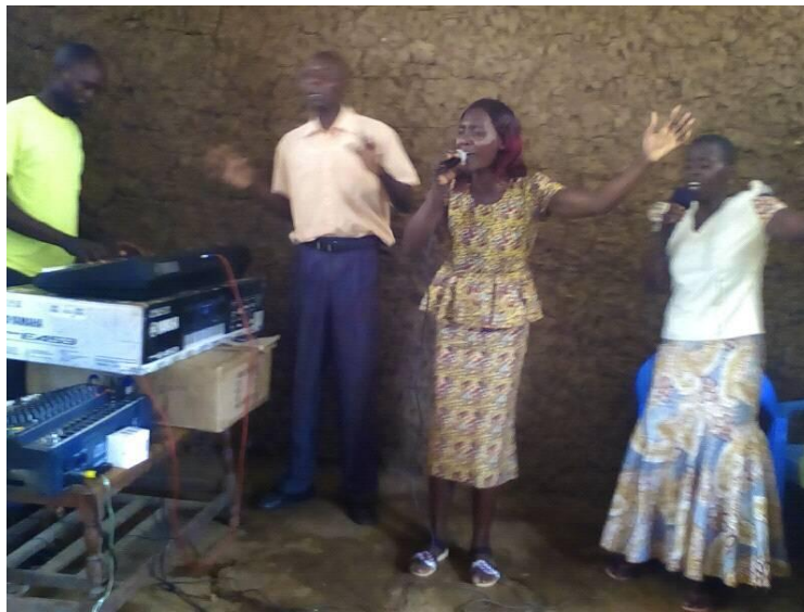
Singing to the LORD