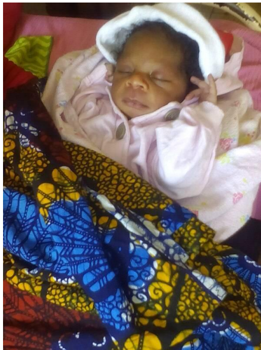
Picture of our boy. We give praise to God.