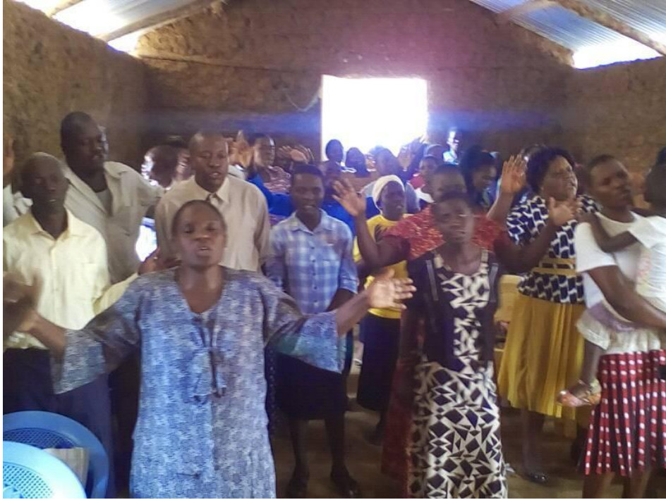
We had a wonderful time and service, Jesus receive all the praise and honor!!!