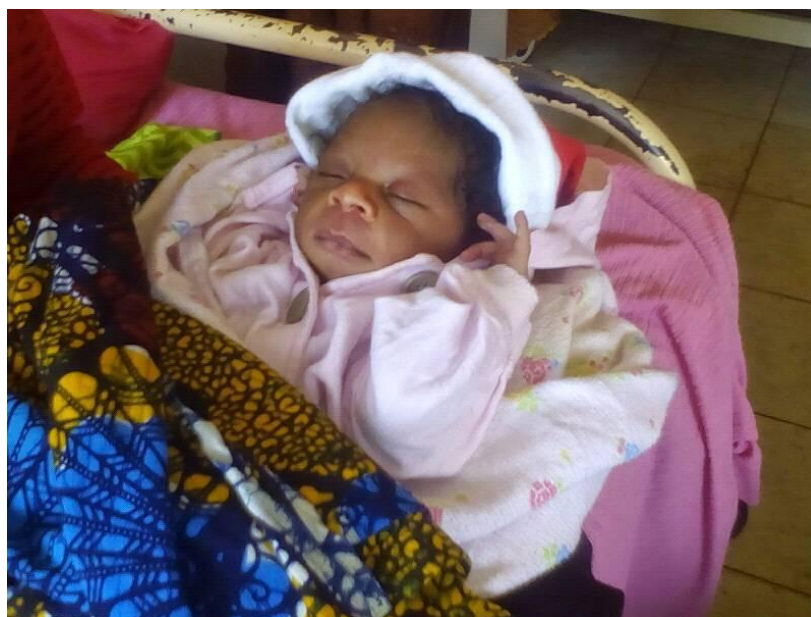
God has now blessed Pastor with 4 little girls and a baby boy.