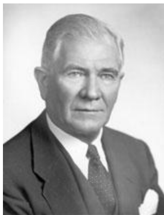
Pat Robertson's father, Senator Absalom Willis Robertson, a

Why do we see all of these rich and I mean filthy rich ministers today? Why aren't they using what God blesses them with to do ministry work? Why are their bank accounts packed full and why are they loaded with so many materialistic things? Think about it.