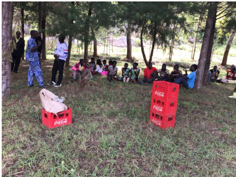
Here they are relaxing at the park