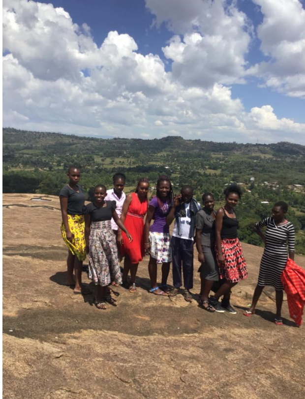
Beautiful young ladies