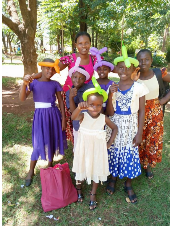
Colorful with their balloon hats