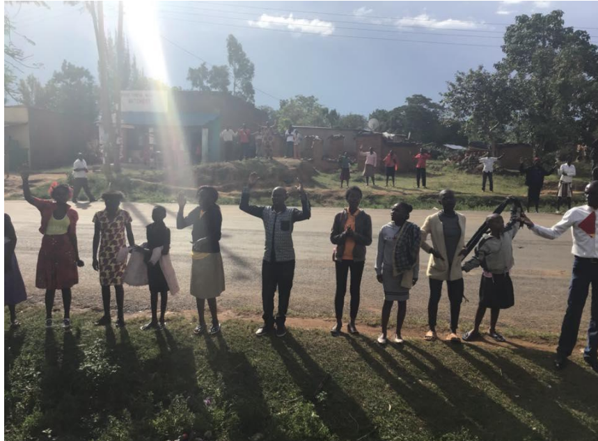
What a neat picture with the sun ray coming down in the background. This may have been during the praise and worship service.