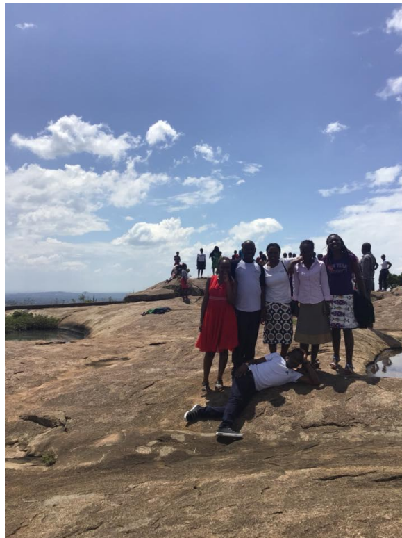
They went up on the mountain to pray and these are some fun pics they took.