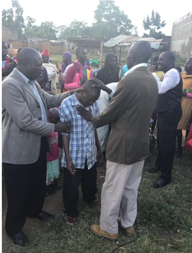
Praying over the youth.