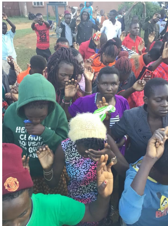
Praise God for these young people coming to hear God's Word.