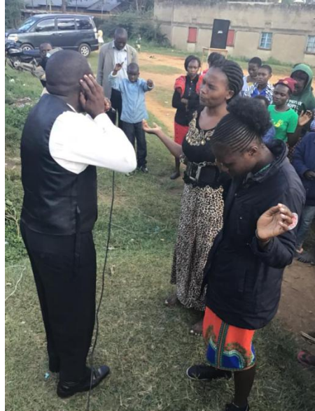
Coming forward for prayer.

We finished our Youth conference at Conquerors Church, Bungoma Town by taking our lovely youths for a picnic and prayers at Lorio mountain .It was a great and lovely experience!!!