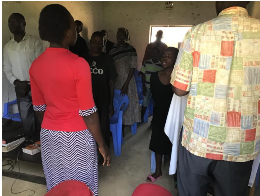
Another picture of the service