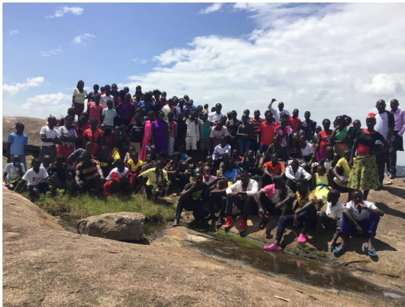
Another group picture, Pastor is in the back