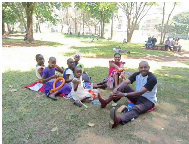
Pastor with some of the Sunday School children from Mumias

This is the place in 2007 while living & working in Kakamega Town where God spoke to me while praying to resign from employment and go serve Him as a full time minister, same year I planted a church at Ekeru-Mumias Town in a Muslim land, am now Pastoring a church Bungoma Town & overseeing 5 churches we have planted so far. I give glory & honor to God.Thank you Jesus!!! Thank you all for your prayers and support