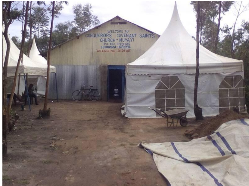
They set up a tent to help with the conference.

Please continue to remember this meeting in prayer.