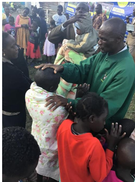
Laying hands on and praying over the youth

Powerful open Air crusades at Sikata market ,Bungoma Town during our last week annual Youth conference at Conquerors church,Muyayi,Bungoma Town. Enjoy the videos and pictures.Thank you Jesus for saving souls!!! Please pray for the new converts to stand for the Lord!