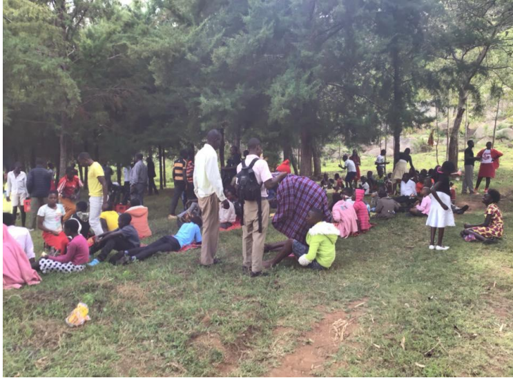
Fun to relax and have a time together in fellowship.