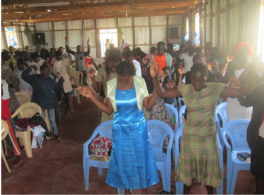
Praising the Lord