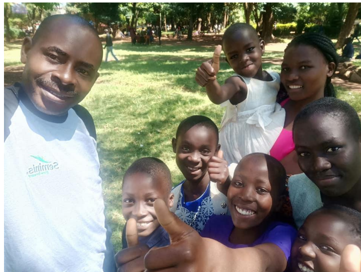
A fun picture

This closes out 2018. So now I have one more year to get caught up on with our outreach ministry in Kenya and Uganda.