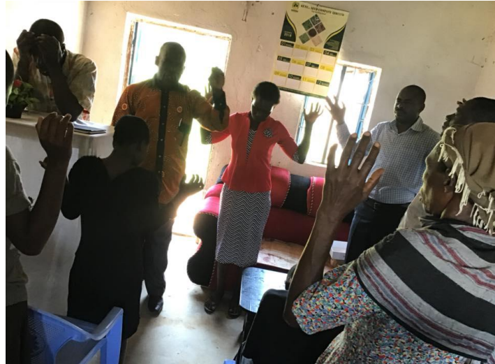
Praying and praising the Lord

Today at Muliro gardens Kakamega Town just to relax and some Sunday school kids of our Ekeru -Mumias Town church with their teachers keeping me company. What a lovely Day!!!! Enjoy some pictures.