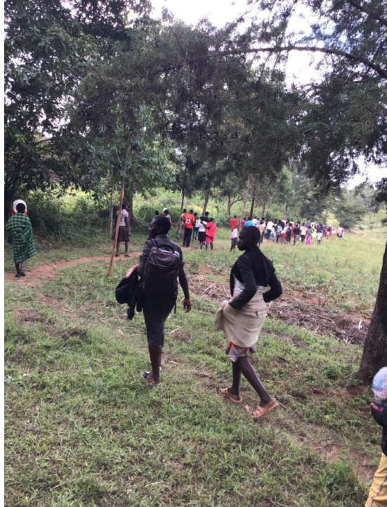
Taking a walk around the area.