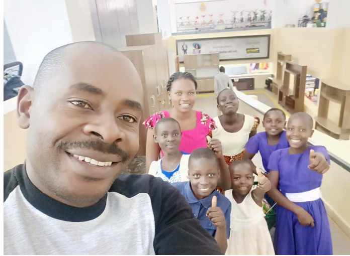
Inside the mall