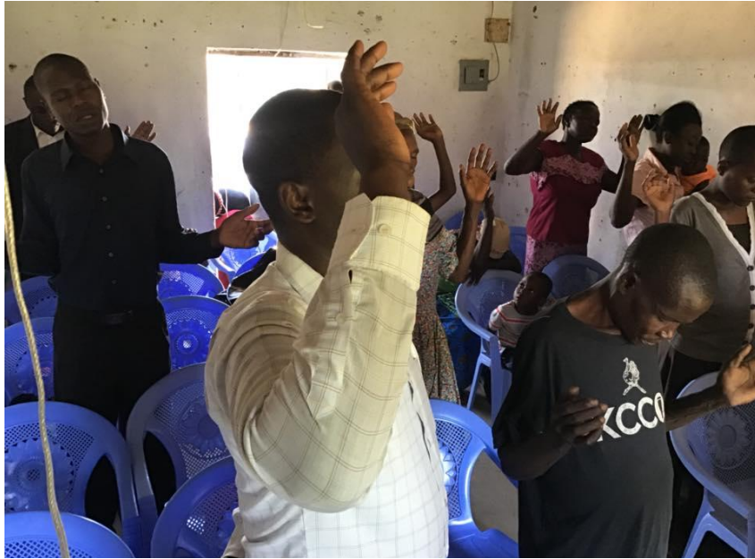
Worshipping the Lord