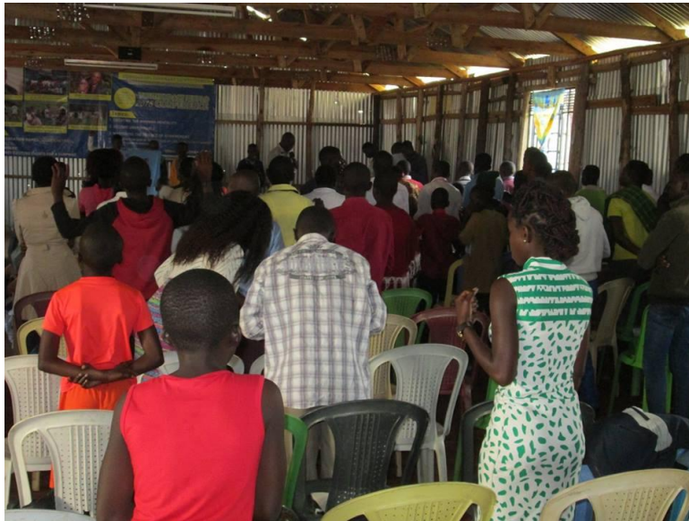
The youth service