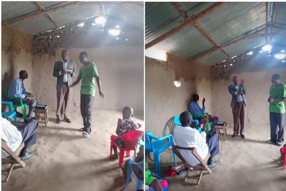
This man was sharing with the church.