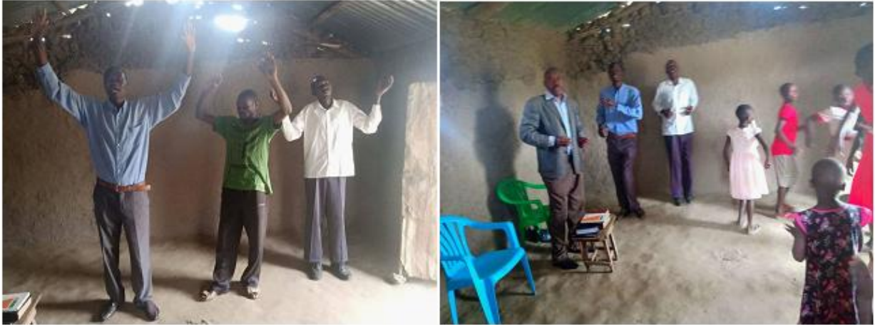
Worship and praise