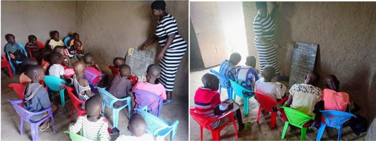
More pictures of the school in Uganda. The school is held in the church which is a mud walled structure.