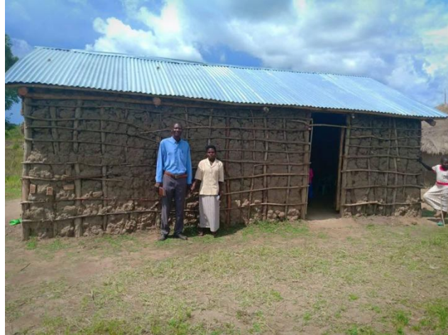
The pastors standing outside the church in Uganda.