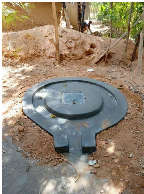
The finished water well.

God is so faithful our dear friends and family. At our Conquerors branch church, Ekeru, Mumias Town we are now done with the water well project. It's now ready for use for our church needs & the community around.