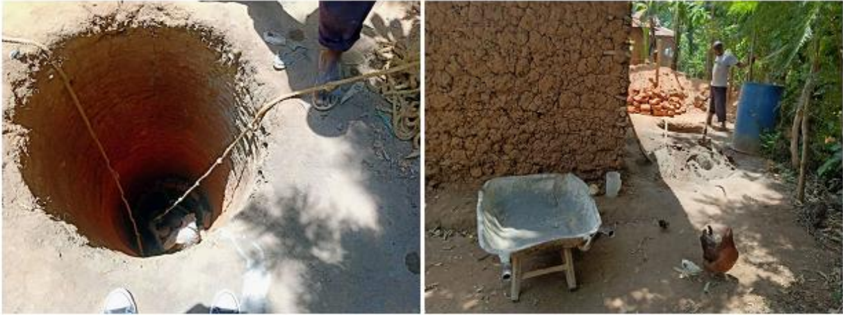
Picture of the water well

Praise God we are now plastering the water well and hopefully it will be done before end of week.