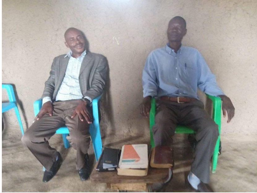
The two Pastors sitting together