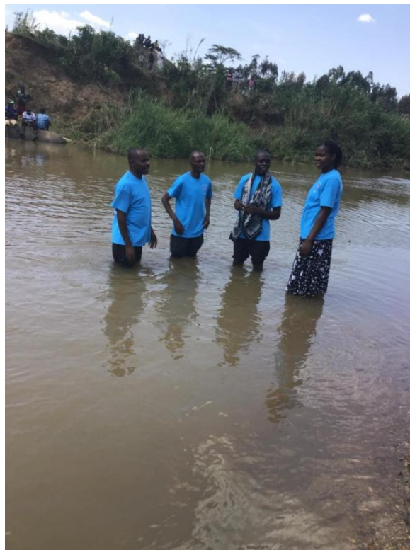
Standing in the river ready to baptize new Christians and maybe some that were never baptized.