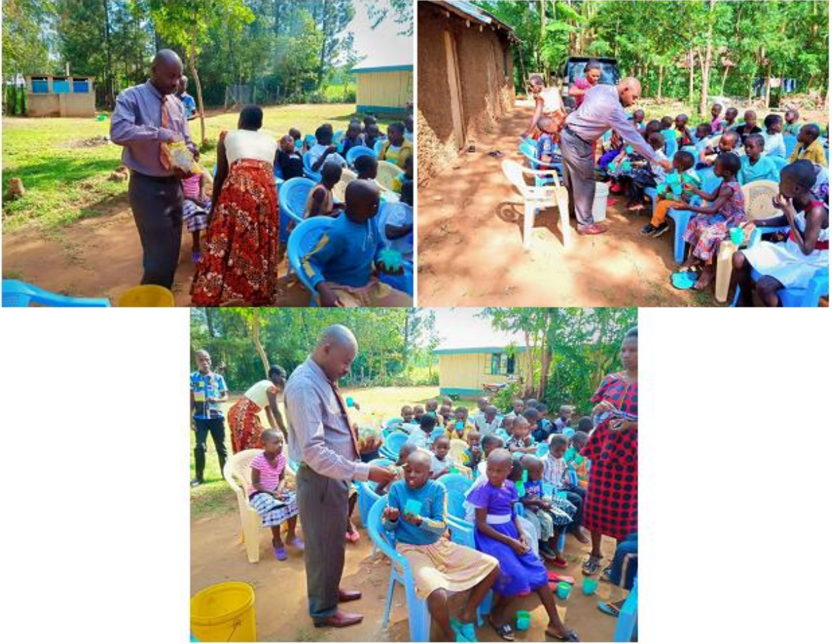
Getting a treat