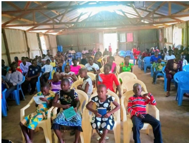
Look at those young people right down front!