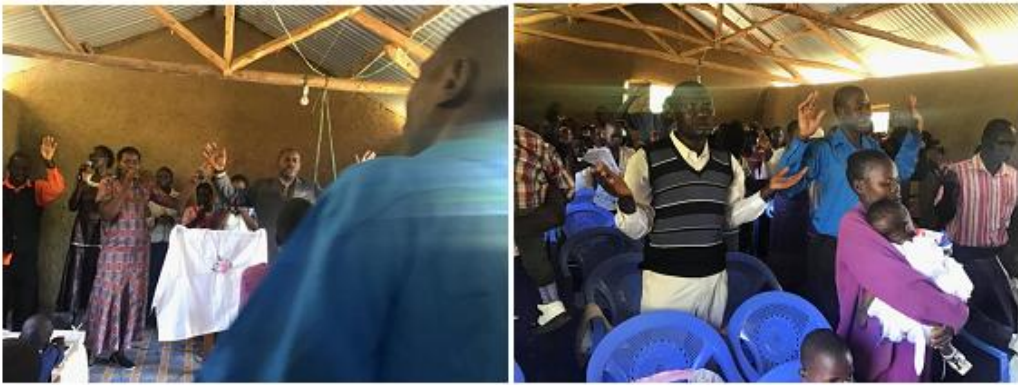
Praise and worship