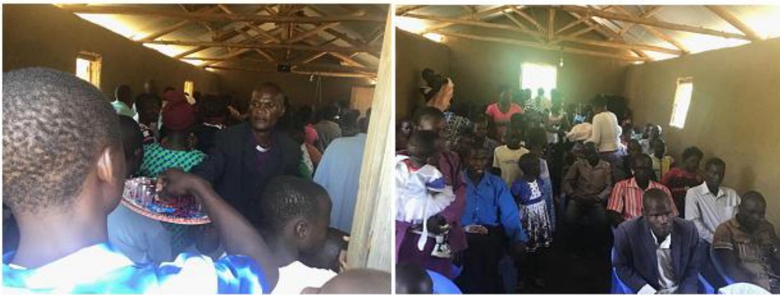
Getting ready to partake in Holy Communion