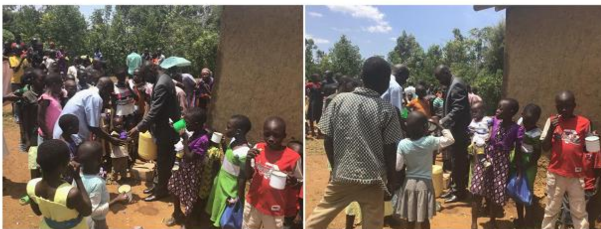
Our lovely kids enjoying some juice, biscuits and candy.