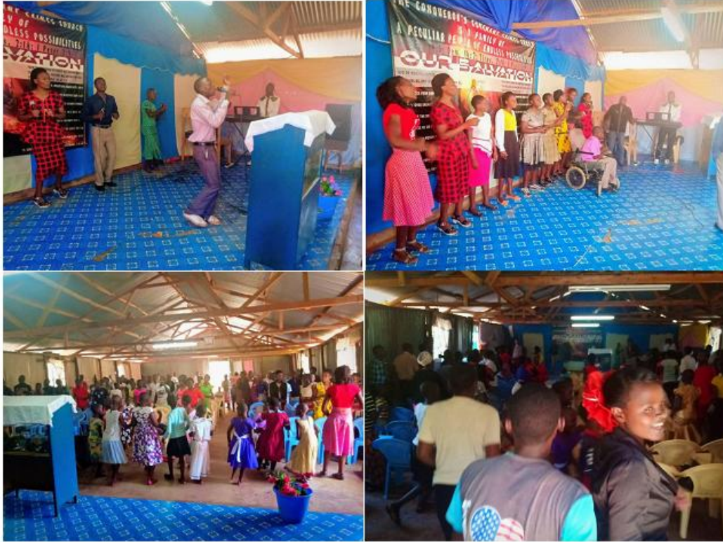
Praise and Worship