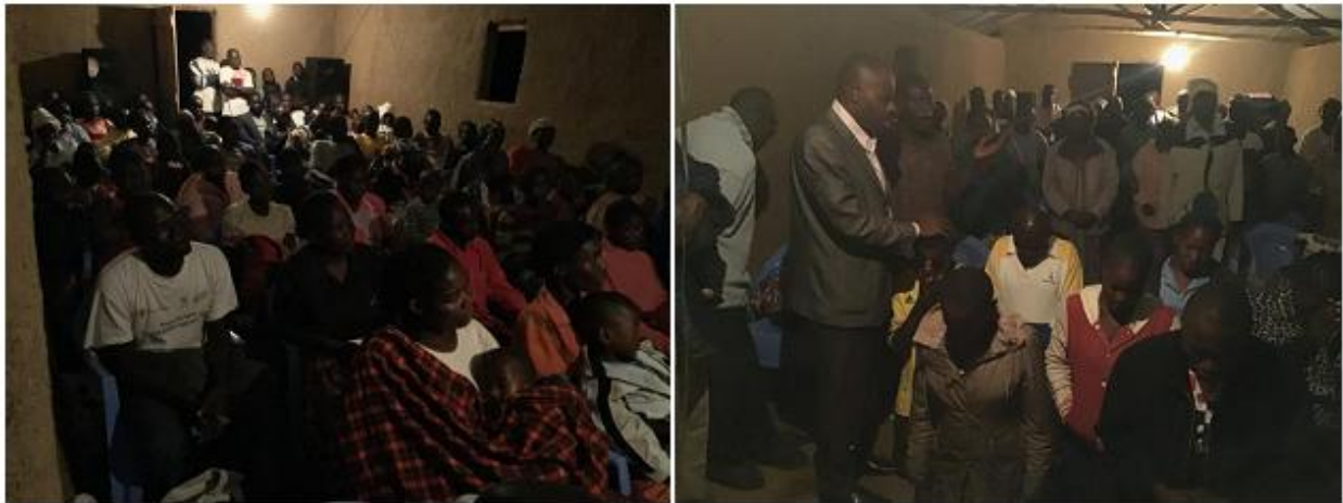
This looks like a nighttime service