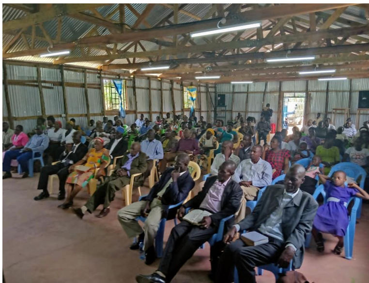
Being fed spiritually