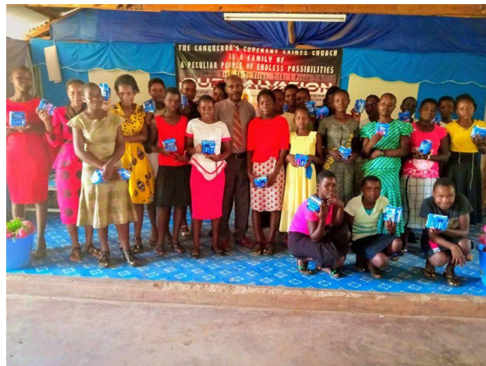
Picture of some of our girls who were blessed with sanitary pads.