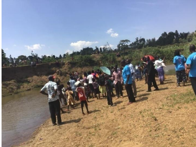
Down by the water for baptisms