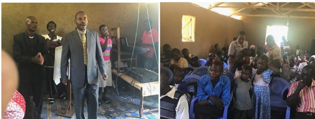
Worship service and service