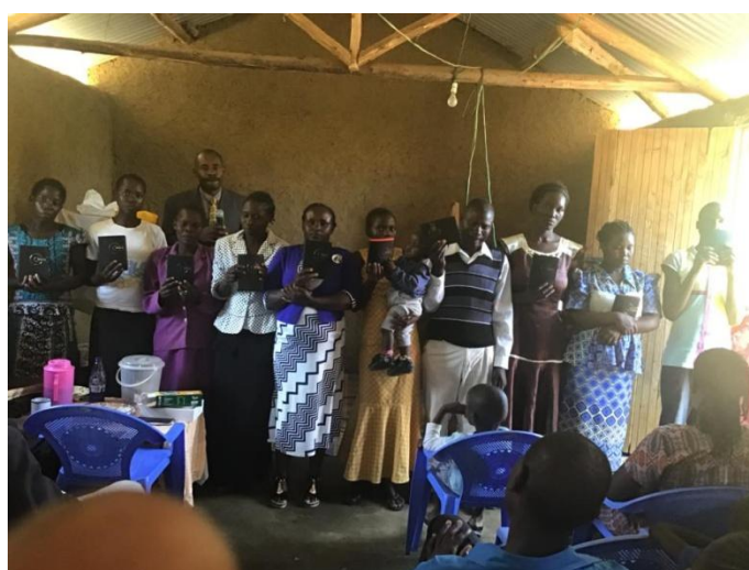
What a blessing for these dear ones to get a Bible of their own to read & study.