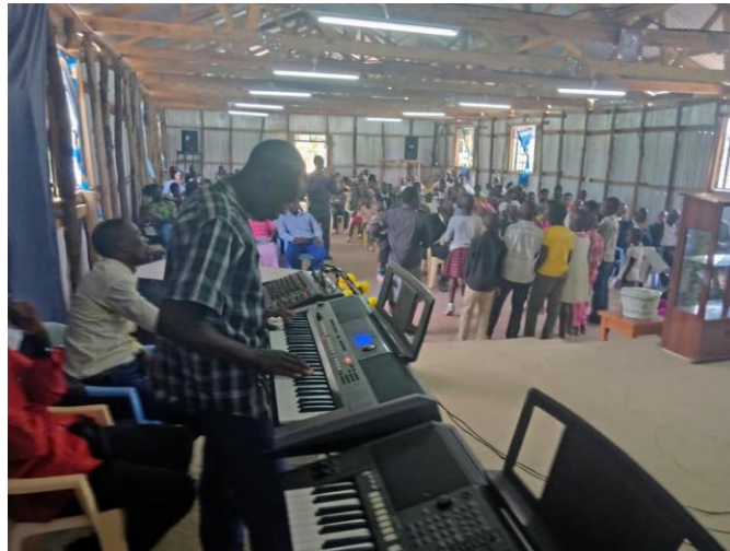
The musicians and the instruments you all helped to provide.