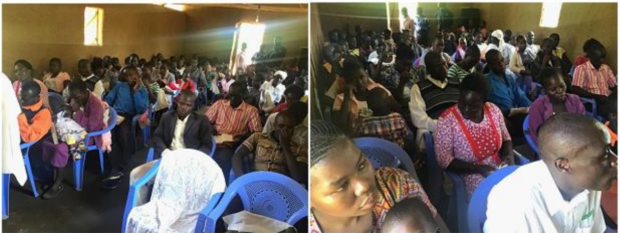
Another church service