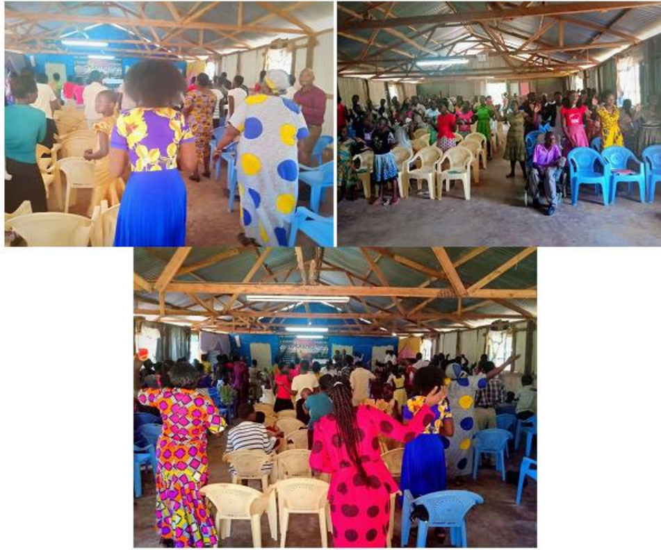
Worship Him, He is worthy