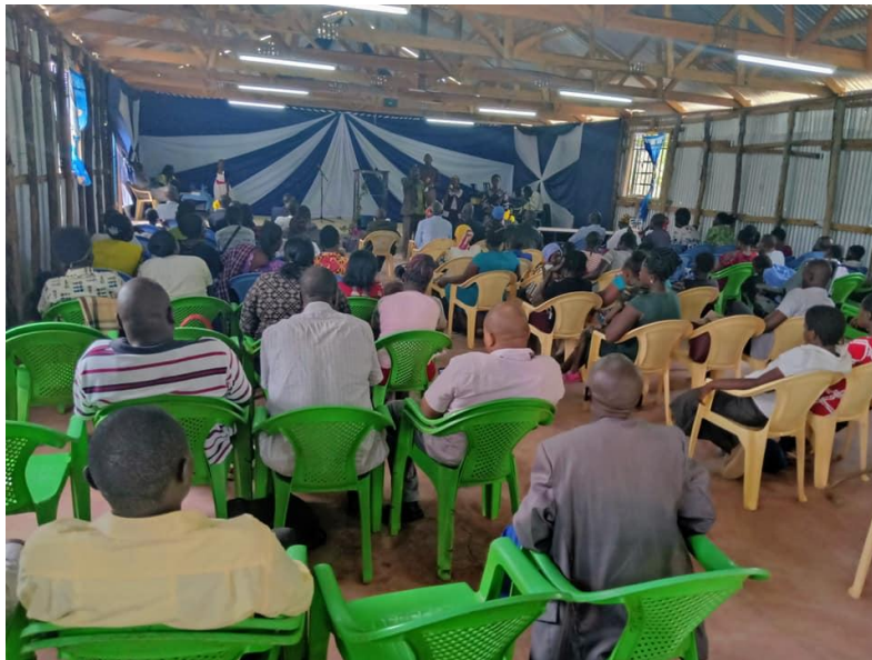
Hearing the Word of God