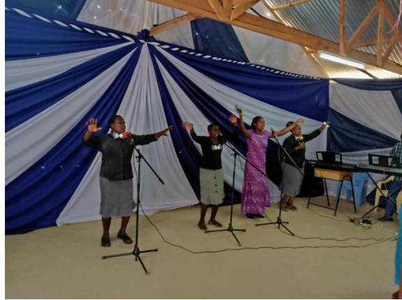
Praise and worship