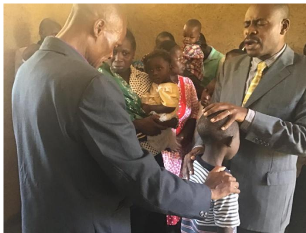
It is never too late to dedicate your children. We dedicated Kennedy at about 5 years old.