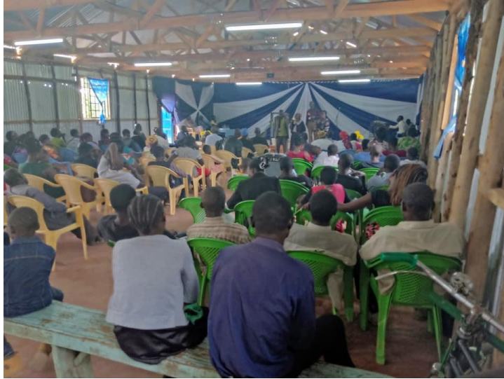
Faith comes by hearing