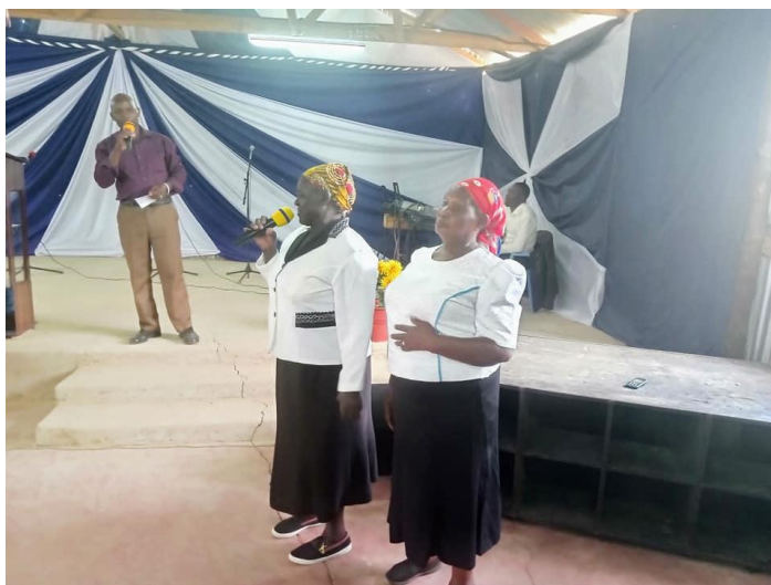
My mother in-law addressing the church