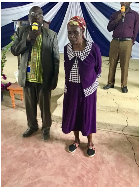
In picture is my Dad and mom.