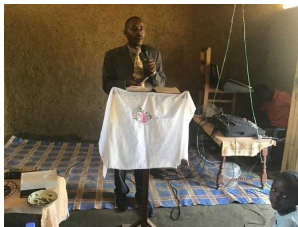
Pastor ministering the communion service.