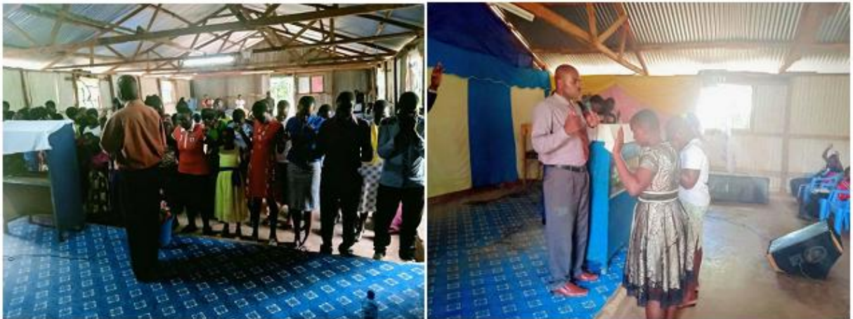
Coming forward for prayer