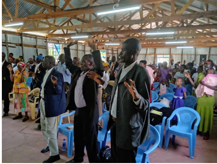
Praising the Lord