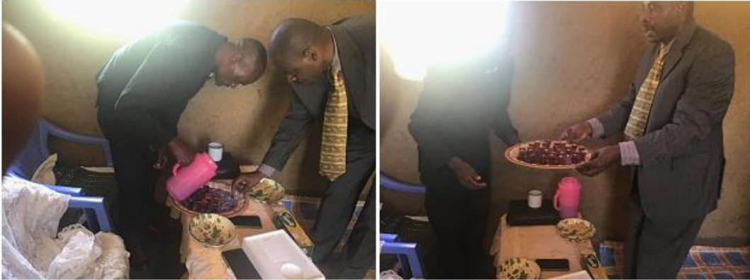
Preparing the holy communion.