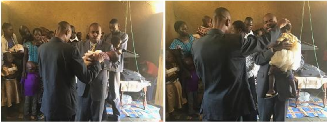
Dedicating those precious babies.