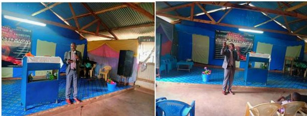
Pastor serving spiritual food for the souls in Kenya