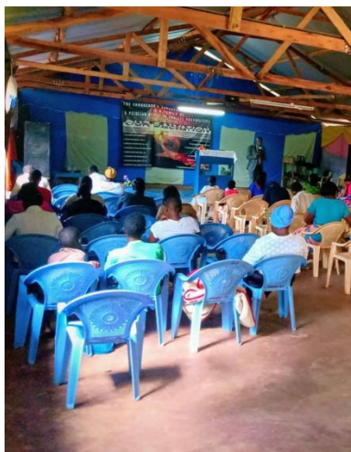
Listening to God's Word