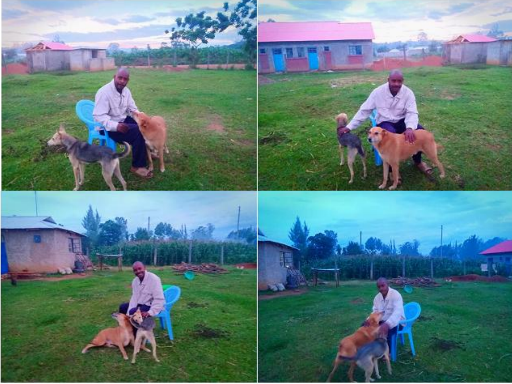
Relaxing today evening with my two wonderful dogs Tiger the small one and Tommy. As good friends in the home we get time to play once in a while!!!! Love God's creation.