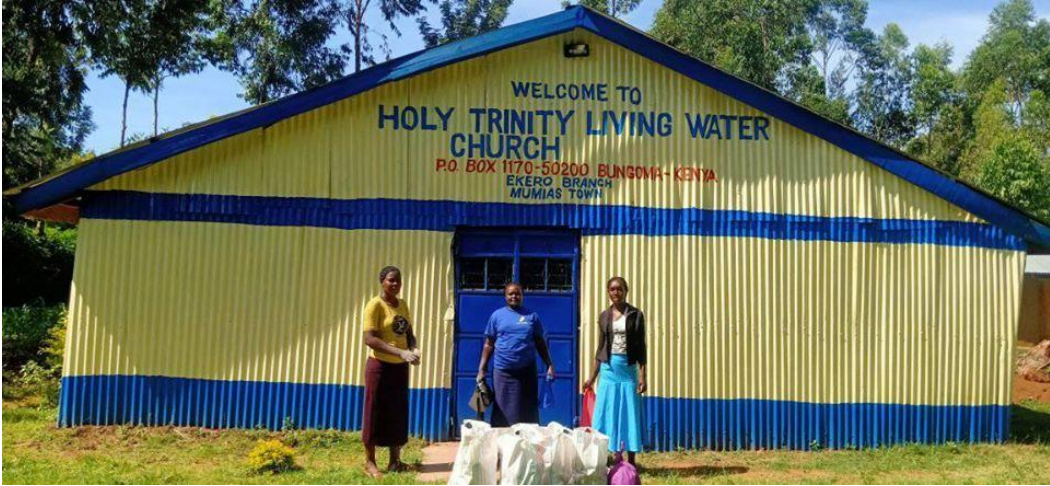
Getting ready to make deliveries from the Ekeru Branch Church.