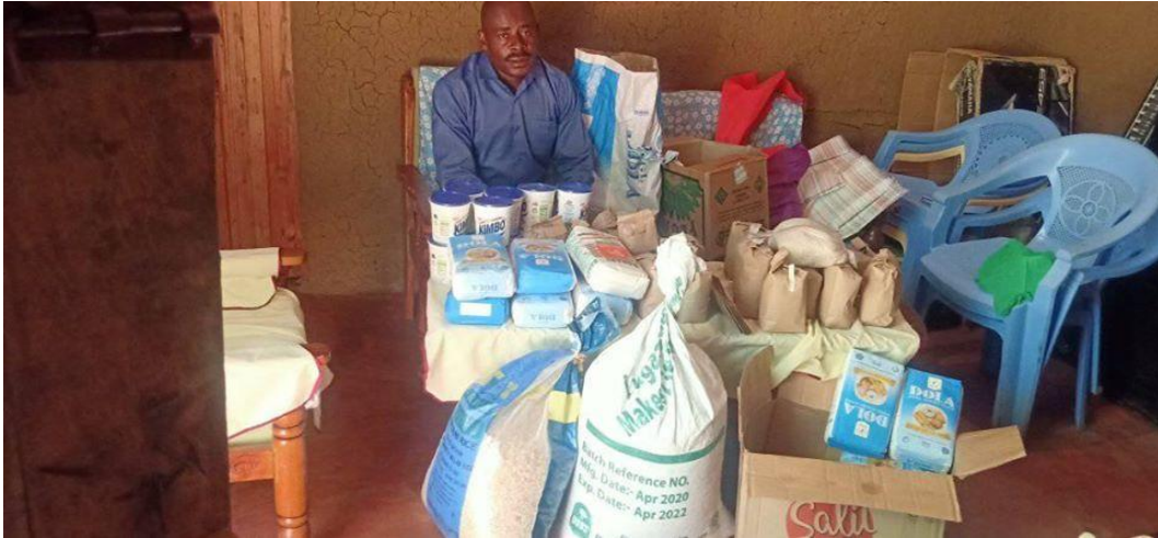
Here is Pastor with many of the supplies for the Ekeru Mumias area.