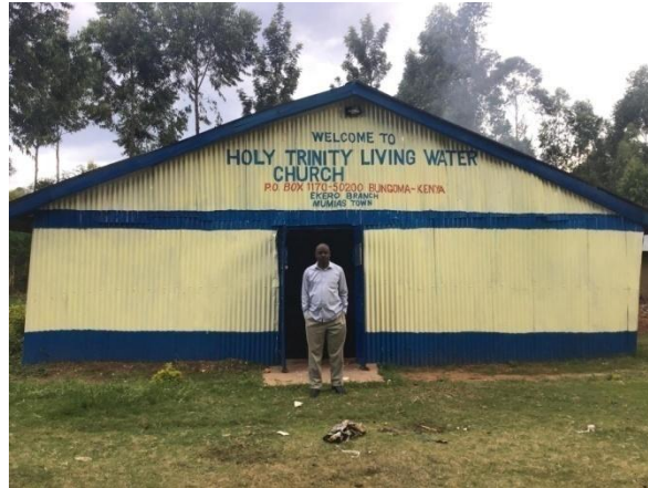
Pastor at the Ekeru branch in Mumias with the new name now on that church too.