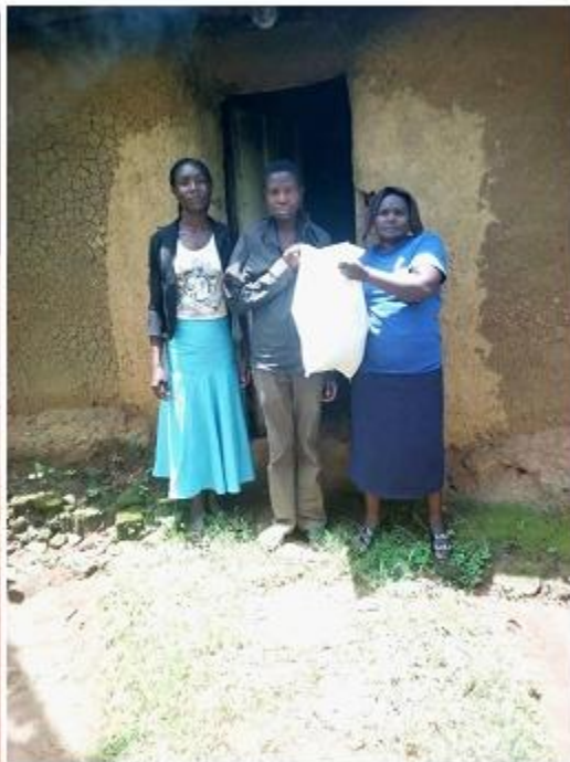
L: A woman receiving food. R: A young man receiving food.