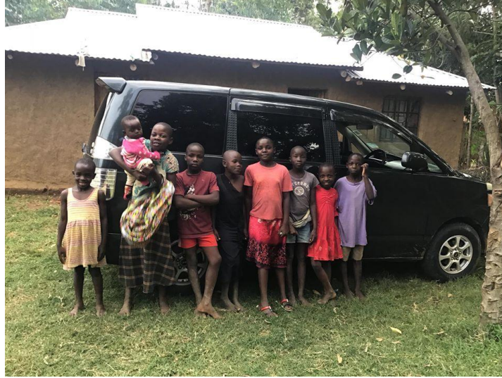
Here they are by Pastor's van.

April 18, 2020: God is Love!!! Traveled today back home after blessing some widows, orphans and needy church members of our Holy Trinity Living Water Church , Ekeru branch , Mumias Town in Kakamega county.