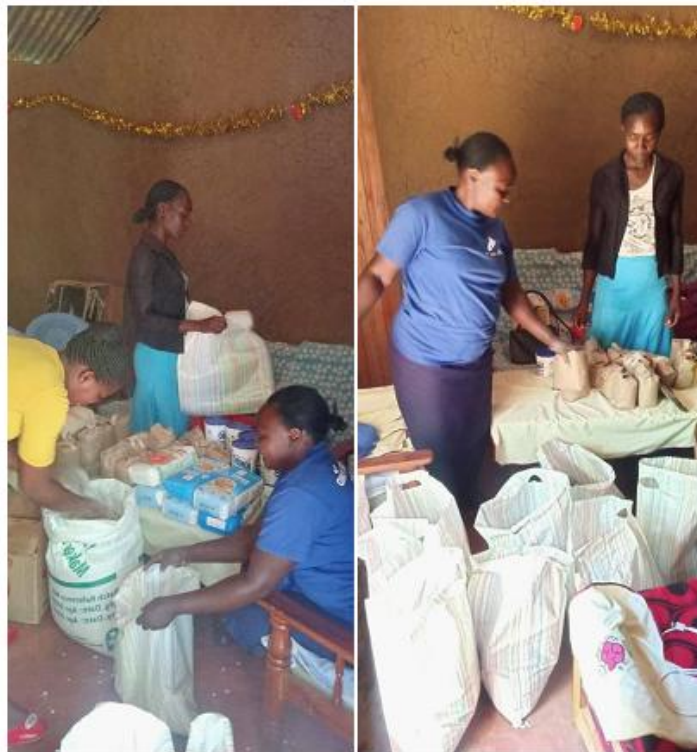
Here the ladies are making up the packages for distribution.