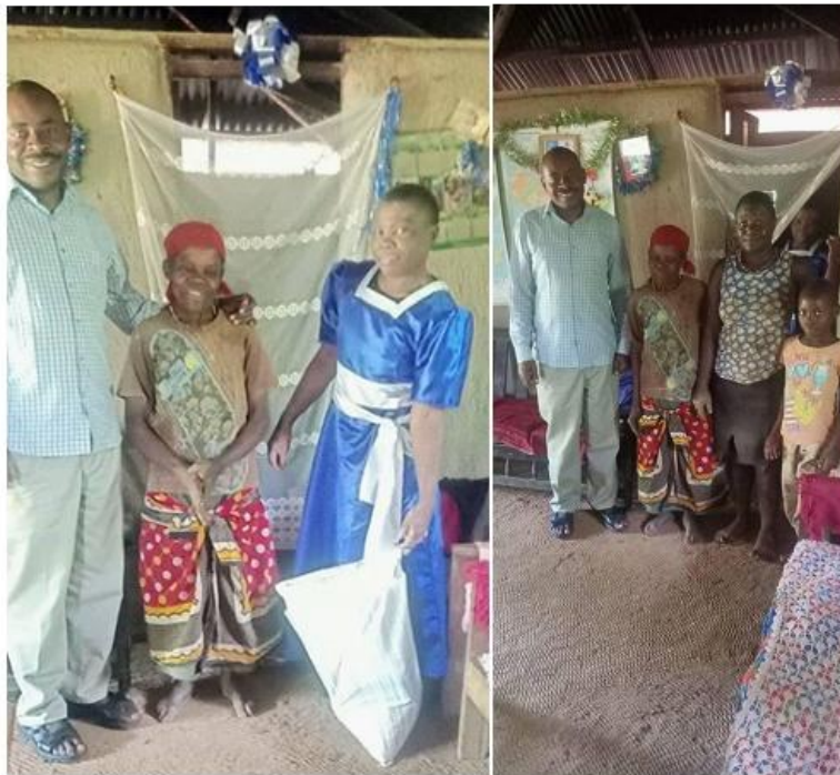
A family receiving.

God bless you all for being part of this noble task. We appreciate your continued prayers & support. James 1:27 - Pure religion and undefiled before God and the