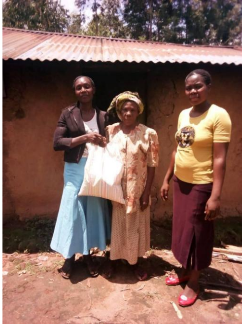
This woman also is probably a widow.