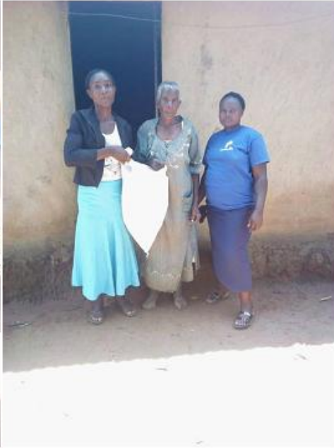
L: Some young ladies receiving food. R: A widow woman receives food.