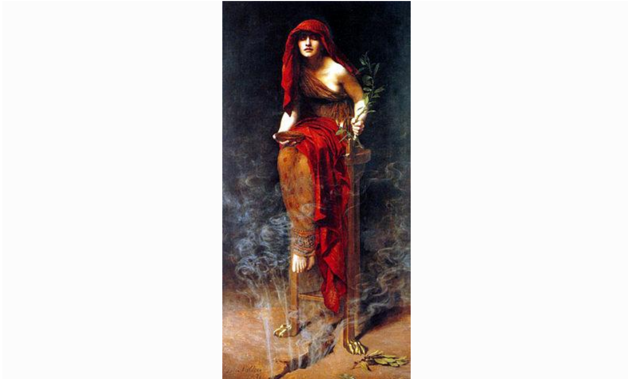
Priestess of Delphi (1891) by John Collier, showing the Pythia sitting on a tripod with vapor rising from a crack in the earth beneath her.

nature. These are all things the pagans worship. That is why you see all of it wrapped up in Christmas as well. All of this was going on thousands of years before Christmas evolved. If you believe Christmas is about worshipping Jesus Christ, I encourage you to go and listen to the messages I have done about Christmas. It was celebrated before Christ ever came in the flesh so it cannot be about Him. In order to deceive man, they just changed the name to Christ – mas so that they could fool Christians and it seems to be working very well. It used to be called saturnalia, bacchanalia and yuletide. It is in honor of the sun god, Nimrod's birthday. Notice the lion lifted up, that is because to the pagans, the lion is a symbol of the sun god.