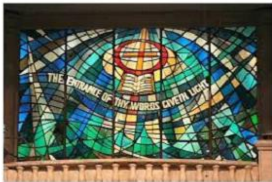
Inside Shadow Mountain Community Church

David Jeremiah's pulpit has laurel leaves around it and the star of rhemphan or of the sun god as well. I'm sure that pulpit is out of oak for his king who is also known as the oak king. Each section of laurel leaves has 15 leaves in their witchcraft math that = 6 because they would add the 1 plus the 5. Around his pulpit there are 6 sections of laurel leaves. That is 6 and each one consists of 6 if you multiply it you get 36 which is 666666 and then if you count the stars with 6 petals you get more 6's. Their pulpits are made in such a way and prayed over and satanically anointed. They perform witchcraft as they serve satan. They are his ministers, pretending to be righteous ministers of light. This man teaches that you receive all of the Holy Spirit upon salvation and he teaches once saved always saved and both are a lie from the pits of hell.