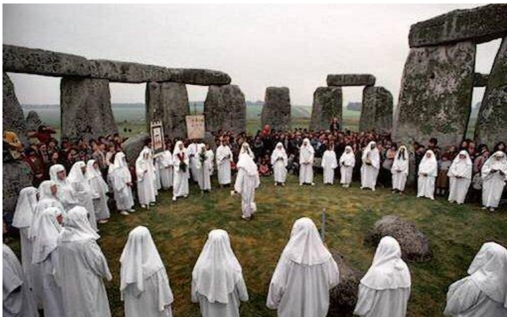
Stone Henge seems to be a sight where rituals were practiced.

Nimrod and Asherah were worshipped as gods on this earth. They started the first government at Babyl with the tower of Babylon. That government was against God and those that serve lucifer have vowed to keep trying to finish what Nimrod started. When Nimrod was murdered and cut into pieces as an example not to do like him, Asherah (Nimrod’s wife and mother) got pregnant and made up a story about Nimrod’s spirit going to the sun. This would secure her continued worship, as well as make her son a deity. The religion that they taught was The Mystery Babylon Religion and it spread throughout the whole world.