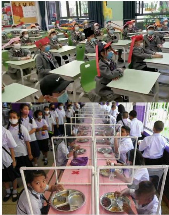
Top: These children are being made to wear one meter hats to keep the social distancing. Bottom: Thailand: Lunch with separated dividers