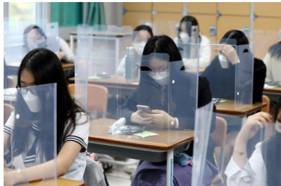
More desk shields

Some are wearing face shields. I'm sure the schools are overly using hand sanitizers.