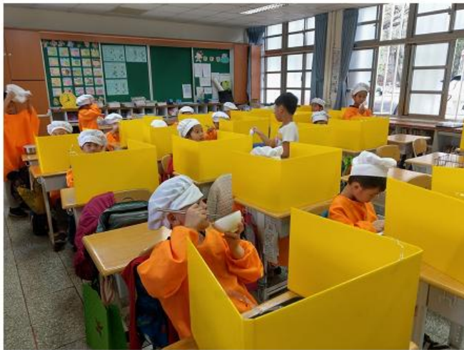
Taiwan: Desk shields