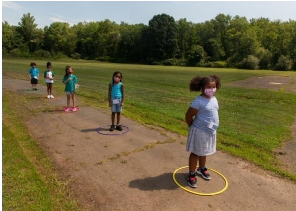
These were initial pictures when this first started. Separation outside on the playground.