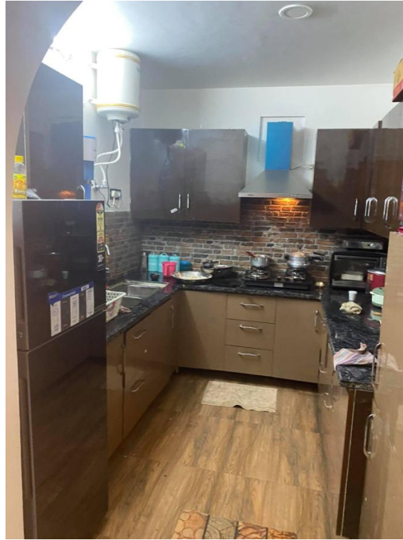
Here is the kitchen and it is downstairs too.

They did not have water or plumbing in their previous home. Sourav and Sachin used to go to the public water place to fill up their water cans and then bring them home and then refill them later. One can used to be about 20 litres, which was nearly about 5 min walk and they used to fill the water for the home for daily needs, they used to do it twice a day so they would have enough water. Sometimes when there was no water supply, they used to ask their neighbors to give them water for daily needs.