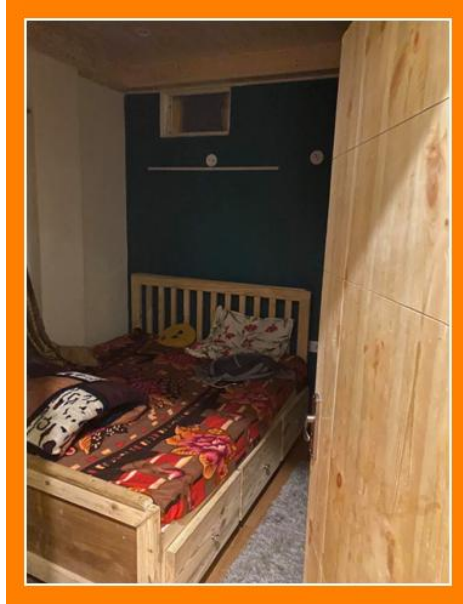
This is Sonali's bedroom.