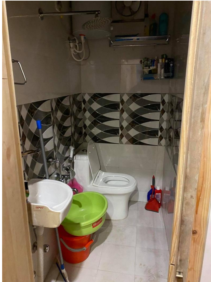
Here is the bathroom or the washroom. I thought the tile work that they chose was so pretty.