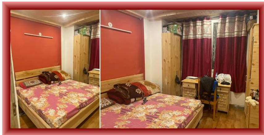
This is Sachin's room. All of the bedrooms are upstairs except for Pastor Dalbeer's room.