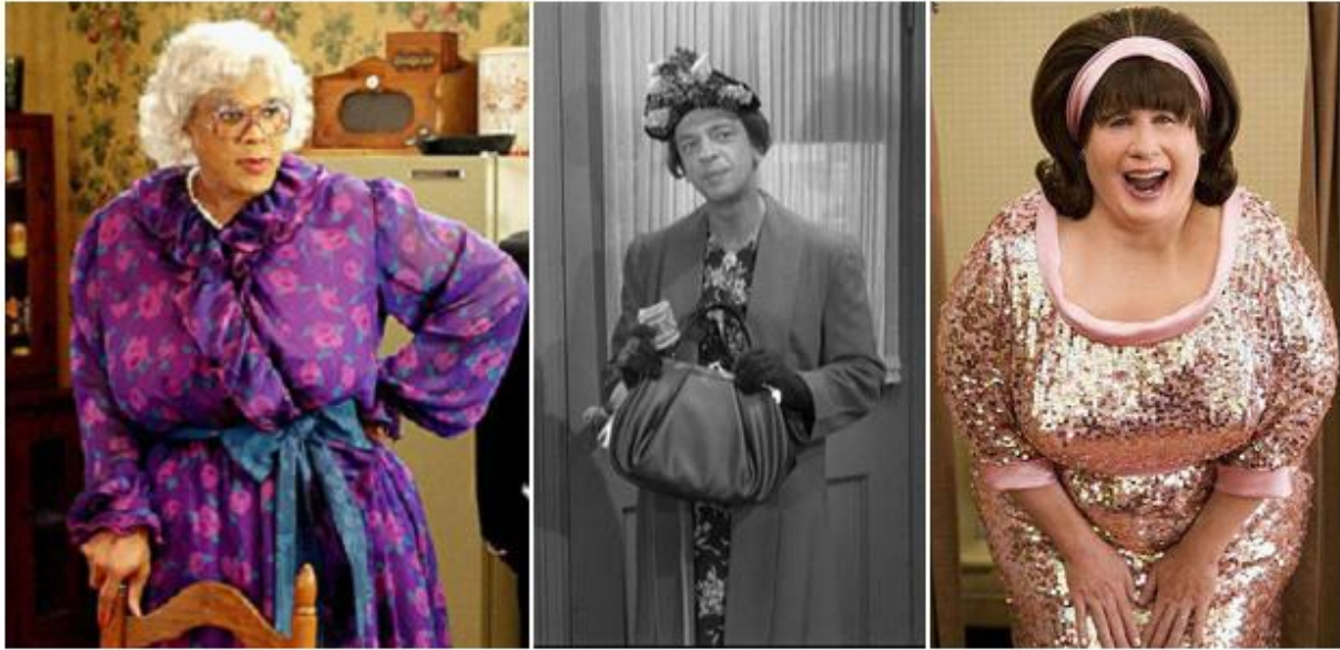
L: Tyler Perry as Madea M: Barney Fife as a woman back in 1962 R: John Travolta in Hairspray.

They want them to be abominations and do the things that God said not to do. You want the money, you want the fame, put the dress on. Think about how many male actors you have seen put dresses on. I think it was Dave Chappelle (who has been cloned and replaced by the way) in an interview with Oprah, who said they wanted him to put a dress on and he said no. They had problems with Dave and he didn't come back.