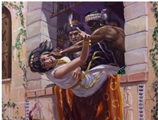
The eunuchs pushing Jezebel out of the window.

2 Kings 9:30-37 - And when Jehu was come to Jezreel, Jezebel heard of it (had heard of it); and she painted her face, and tired her head (arranged her hair), and looked out at a window. And as Jehu entered in at the gate, she said, Had Zimri peace, who slew his master? (other translations say: "Have you come in peace, you murderer" You are just like Zimri who murdered his master!" And he lifted up his face to the window, and said, Who is on my side? who? And there looked out to him two or three eunuchs. And he said, Throw her down. So they threw her down: and some of her blood was sprinkled on the wall, and on the horses: and he trode her under foot (with his horses). And when he was come in, he did eat and drink, and said, Go, see now this cursed woman , and bury her: for she is a king's daughter. And they went to bury her: but they found no more of her than the skull, and the feet, and the palms of her hands. Wherefore they came again, and told him. And he said, This is the word of the LORD, which he spake by his servant Elijah the Tishbite, saying, In the portion of Jezreel shall dogs eat the flesh of Jezebel: And the carcase of Jezebel shall be as dung upon the face of the field in the portion of Jezreel; so that they shall not say, This is Jezebel (no one will be able to recognize her).