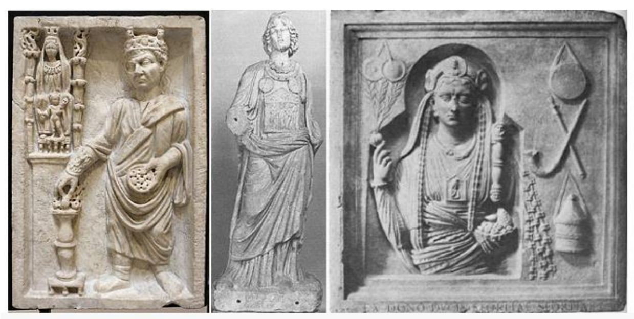
The signs of their office have been described as a type of crown, possibly a laurel wreath, as well as a golden bracelet known as the occabus.<sup>[17]</sup> They generally wore women's clothing (often yellow), and a turban, pendants, and earrings. They bleached their hair and wore it long, and they wore heavy makeup. They wandered around with followers, begging for charity, in return for which they were prepared to tell fortunes.

These are gallus priests. They are the ones that castrated themselves and then wore women's clothes. They served in the cults of Cybele and Attis. The signs of their office have been described as a type of crown, possibly a laurel wreath, as well as a golden bracelet known as the occabus. They generally wore women's clothing (often yellow), and a turban, pendants, and earrings. They bleached their hair and wore it long, and they wore heavy makeup. They wandered around with followers, begging for charity, in return for which they were prepared to tell fortunes.