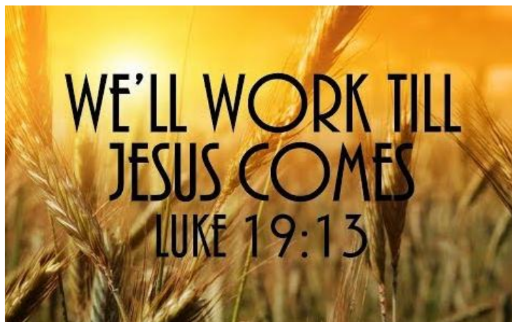
We'll work till Jesus comes. Luke 19:13

In the parable of the pounds in Luke 19, Jesus said to occupy till I come. That doesn't mean just sit around, the meaning of the word occupy as used in Luke 19:13, means that we are to use what has been given to us until the Lord returns. He wants us to be busy using our gifts and talents. We never stop using what God has blessed us with until we go to be with Jesus.