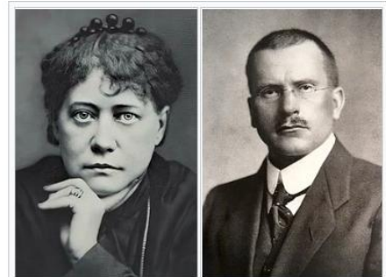
Prominent esoteric thinkers who influenced the New Age include Helena Blavatsky (left) and Carl Jung (right).

One of the earliest influences on the New Age was the Swedish 18th century Christian mystic Emanuel Swedenborg , who professed the ability to communicate with angels, demons, and spirits.