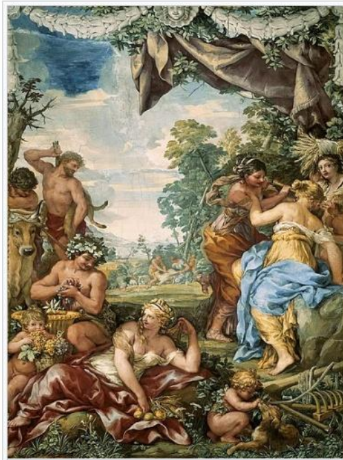
The Golden Age by Pietro da Cortona (Palazzo Pitti, Florence, Italy).

people did not have to work to feed themselves for the earth provided food in abundance. They lived to a very old age with a youthful appearance, eventually dying peacefully, with spirits living on as “guardians”. Plato in Cratylus recounts the golden race of humans who came first. He clarifies that Hesiod did not mean literally made of gold, but good and noble.