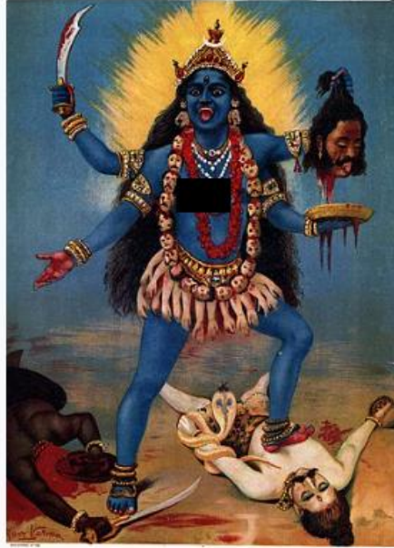
Samhara Kali by Raja Ravi Varma

Kali, mother goddess; goddess of war, anger, time, change, creation, destruction and power. Member of the Ten Mahavidyas. Samhara Kali by Raja Ravi Varma