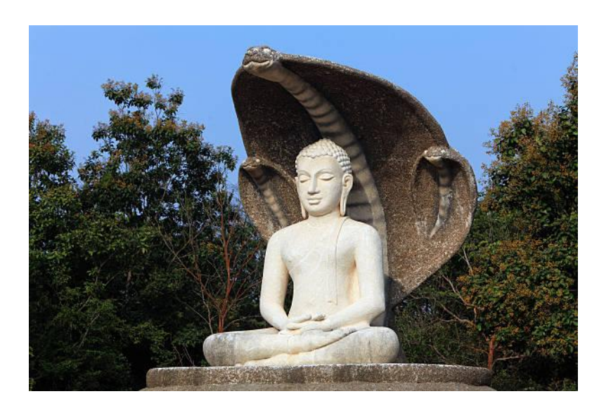
Statue of Buddha mediating with serpents.

ways as being good and being light. Saying that the serpent brings wisdom and enlightens those who seek to awaken the serpent power.