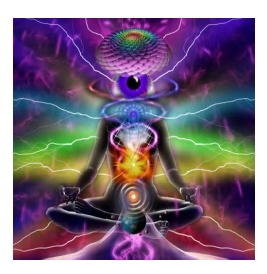
Awakening the Kundalini or the third eye

I covered a lot of this information in a 2015 sermon titled "Evil Spirit or Holy Spirit Part One." This is going to be a refresher for us. Yoga in any form is demonic, whether you do the chanting or not. The word itself means "to yoke" and because it comes from Hinduism, it means to yoke to Hindu gods. The breathing, mantras, yoga poses, and meditations are all based on Hinduism. Kundalini means "coiled one", in yogic theory, it is a primal energy, or shakti, located at the base of the spine. Kundalini yoga is a mystical practice that was brought to the US in the late 1960s. Kundalini has its own methodology and poses, with an emphasis on breathing exercises. The dormant, divine evolutionary force that enlightens and bestows immortality when activated. Those are fancy words and underneath it all, is satan. He mocks God at every turn and the kundalini force, energy, spirit is a false version of the Holy Spirit, it is a demonic version. That's why they said it bestows immortality when activated. It actually will lead the person to eternal damnation if they don't renounce it, get out of it and really and truly get saved.