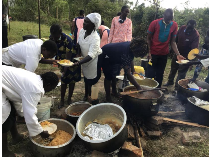
Here is the food for the wedding feast.