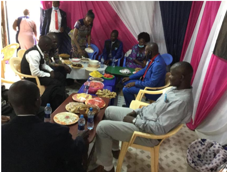
The Pastors enjoying the wedding feast.