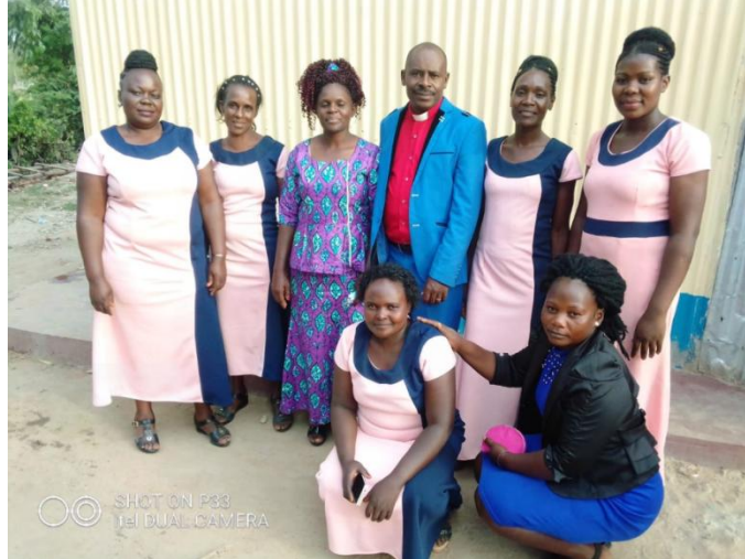
The pastors with the bridesmaids

It is a beautiful thing to be married in Christ with Jesus as the head of your marriage the way God intended marriage to be.