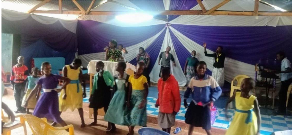
Here are the youth right up front singing and dancing in praise and worship of the Lord.