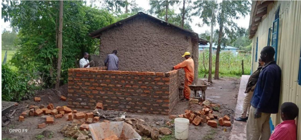
Doing a good job.