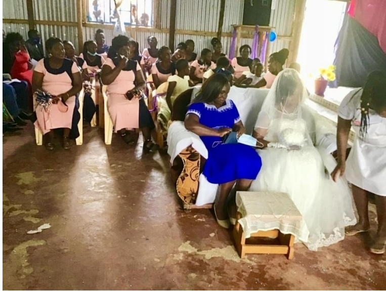
The ladies side...