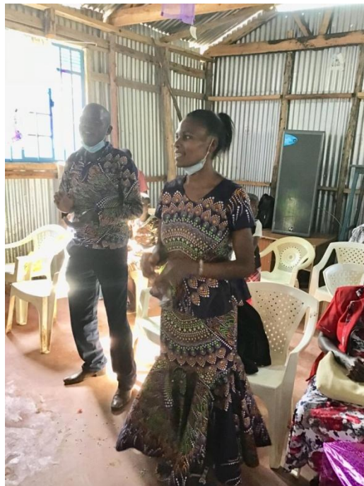
This couple wore matching outfits.