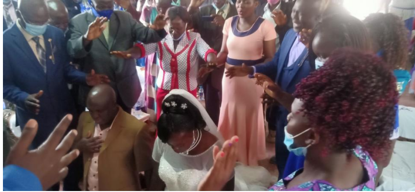
The couple is being prayed over.