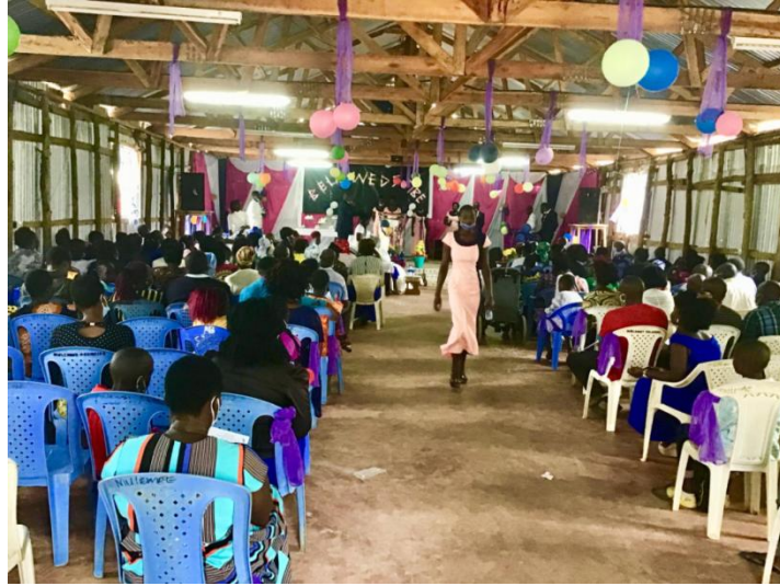
The wedding guests