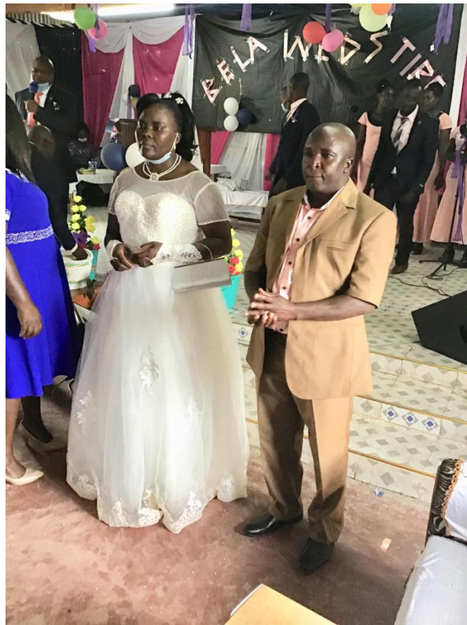
The bride and groom. She is so beautiful in her bridal attire.