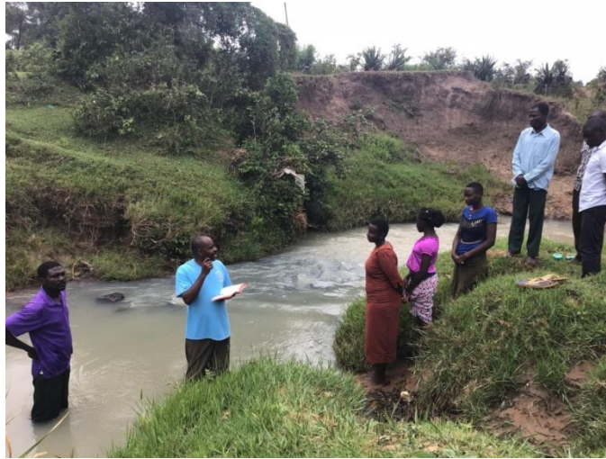
These are water baptisms held in September at Bungoma