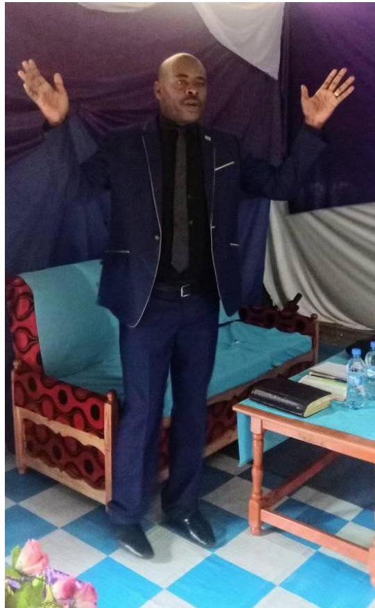
Pastor is praising the Lord! Lift up your hands for His is worthy!