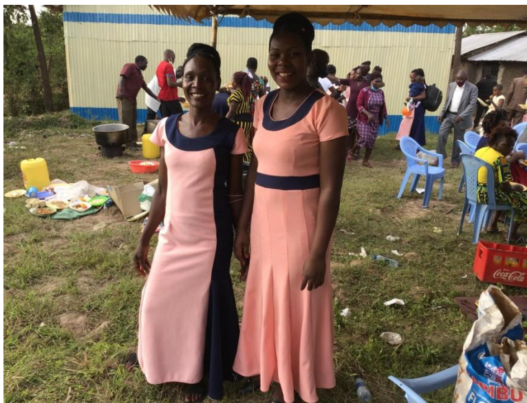
Two of the bridesmaids, look at their smiles.