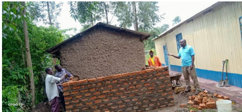
Here's Pastor talking with the workers.

Here's a great short message: Unity is strength when there is team work and collaboration wonderful things can be achieved in building God's kingdom. Don't stop believing in God because of other people's behavior. People change, God never does!!!