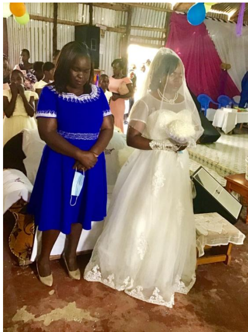
The beautiful bride and maid of honor