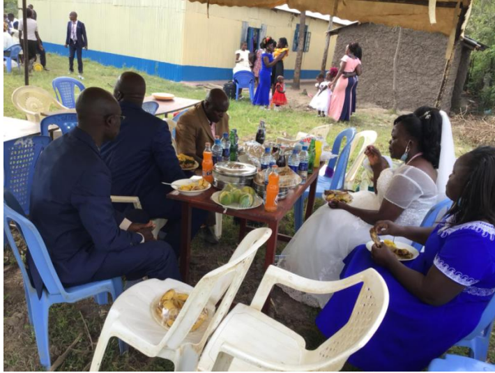
The wedding supper.