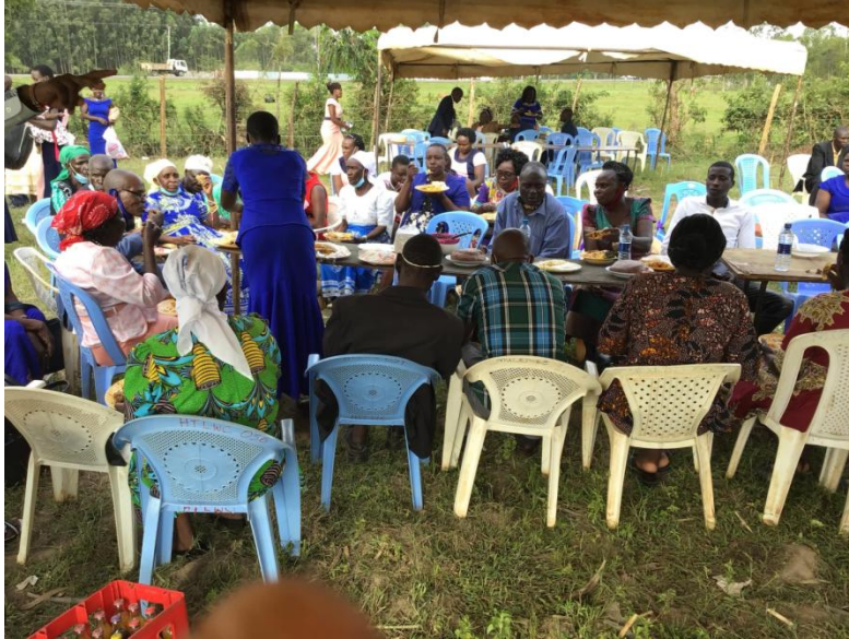
Everyone enjoying some food and relaxing.