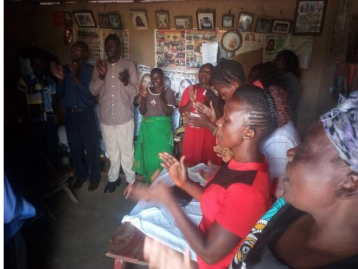
Here are some of the brothers and sisters who came to the home thanksgiving service.