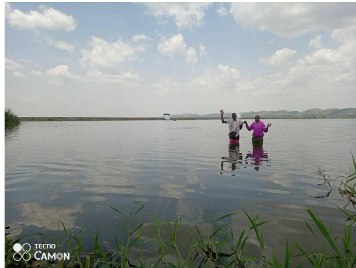
Praying at the completion of the baptisms.