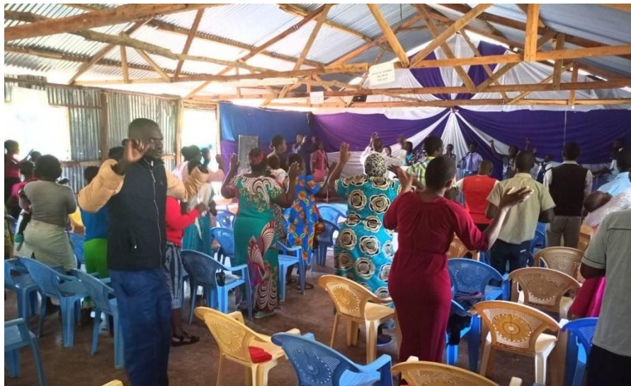
The congregation worshipping