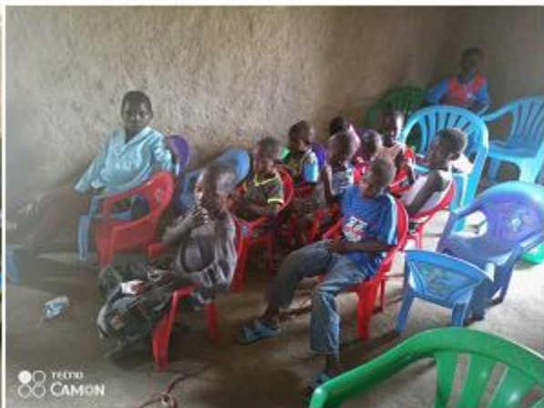
Look at all the children in this church!