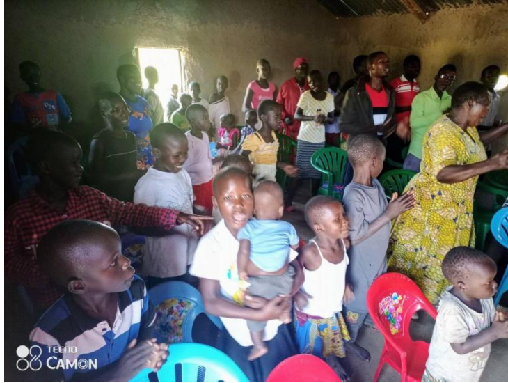
Look at all the children!