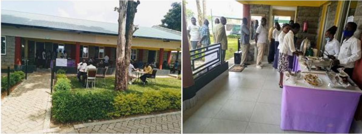
They got to have lunch out on the veranda of the hotel where the meeting was held.