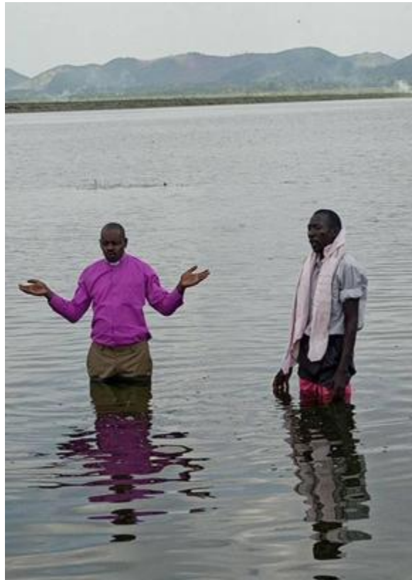
Praying over the baptisms