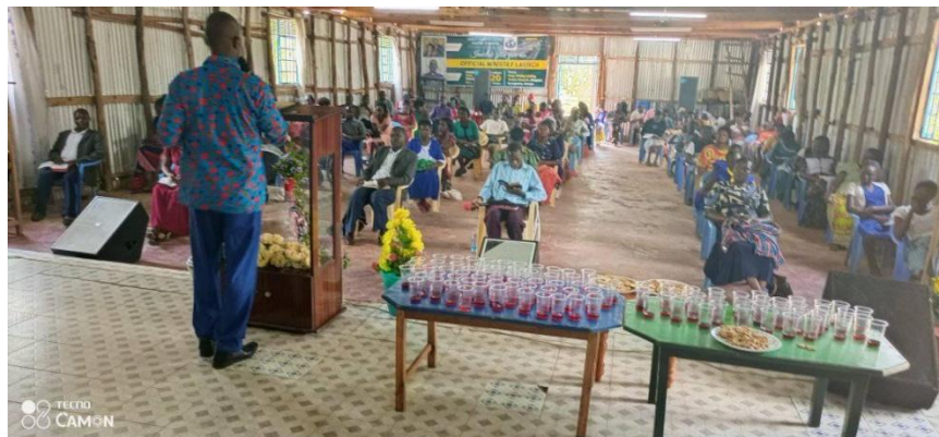
The tables holding the communion supplies

More pictures during Holy communion session of our last month Conference at Bungoma Town.