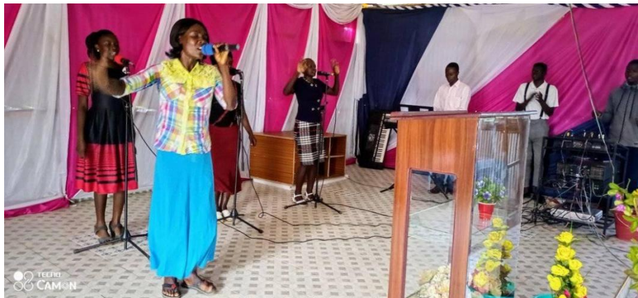
Praise and worship