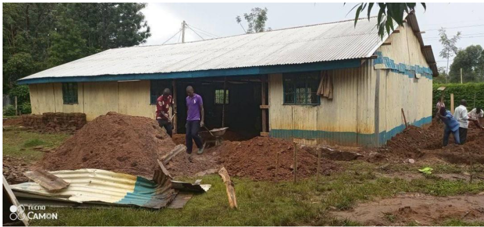
Another view of the church