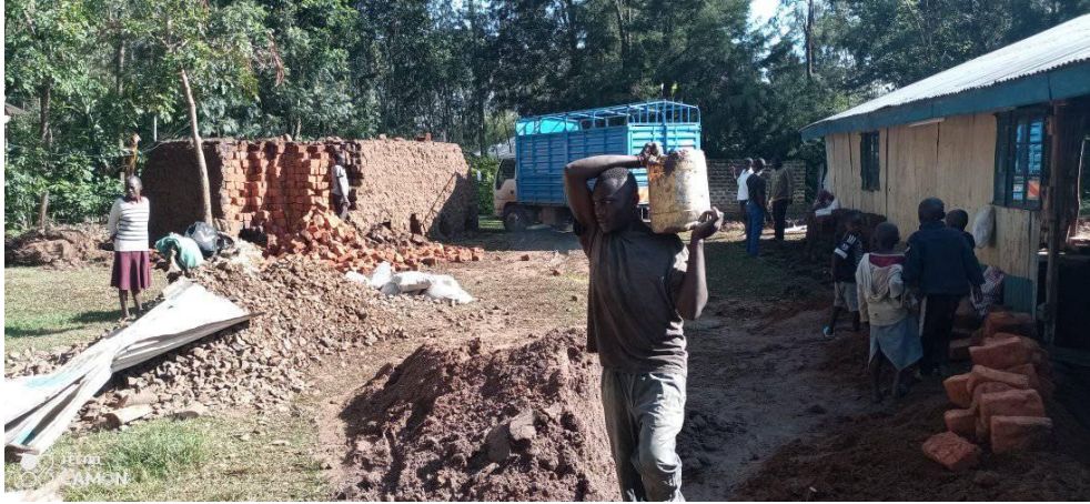
The work is continuing