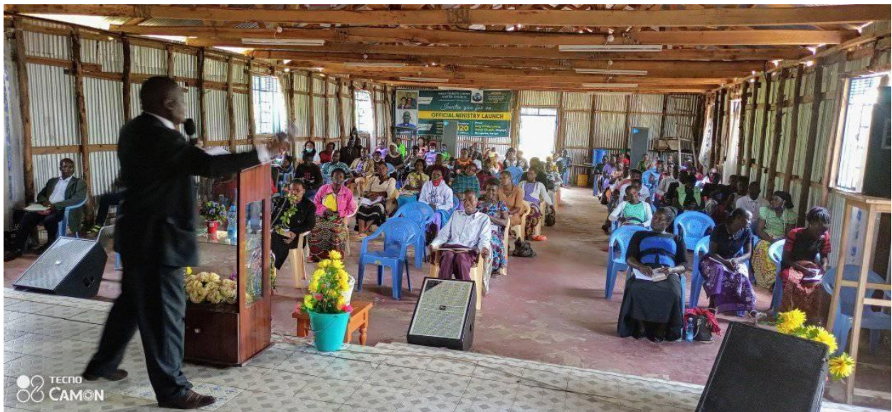
A picture of those who attended on one of the days.