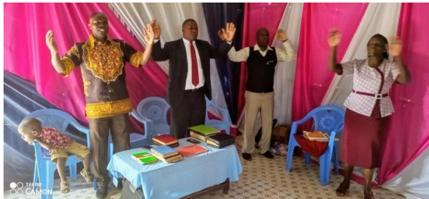
The ministers. Let this minister to you, you too should be lifting up your hands in praise and worship and thanksgiving to God.