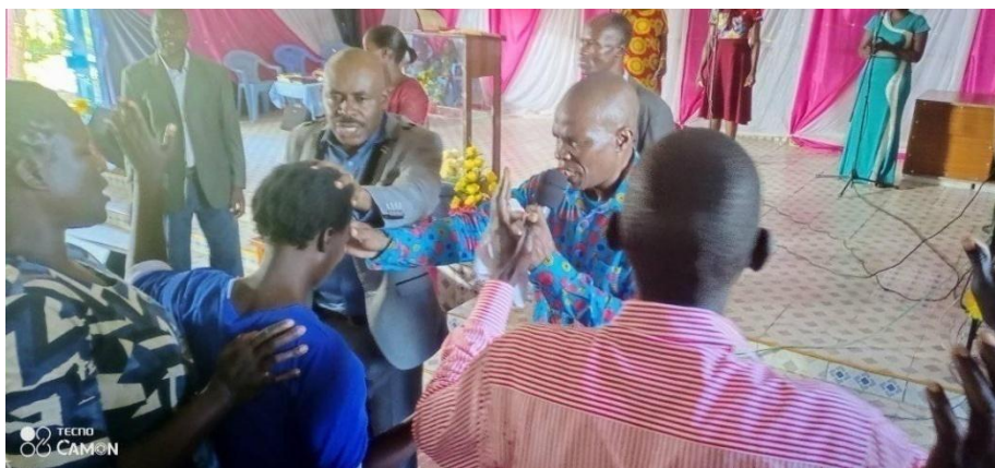
The pastors laying hands on and praying for those that came forward.