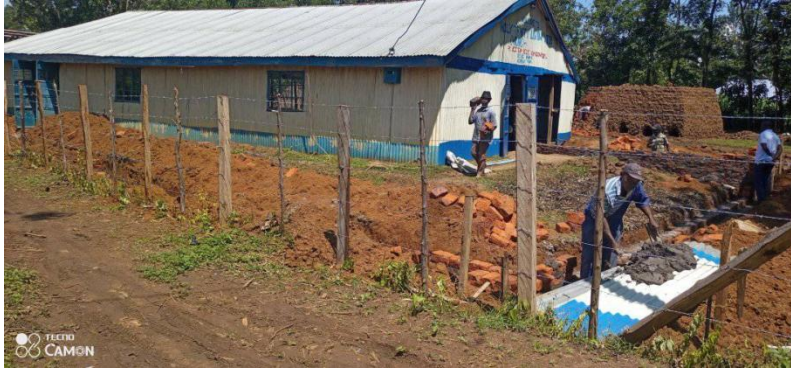
Looks like he's mixing some of the mortar for the bricks.