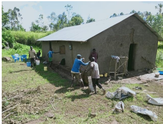
The work is underway