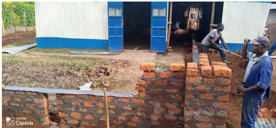
A lot of progress has happened already.