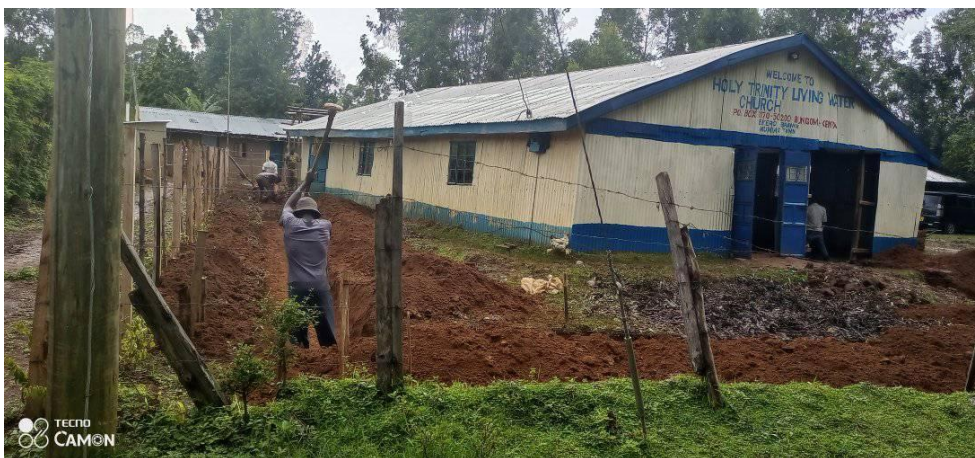
It looks like they widened the church during the process