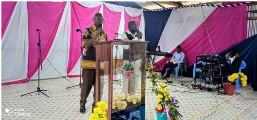
Ministering in the conference