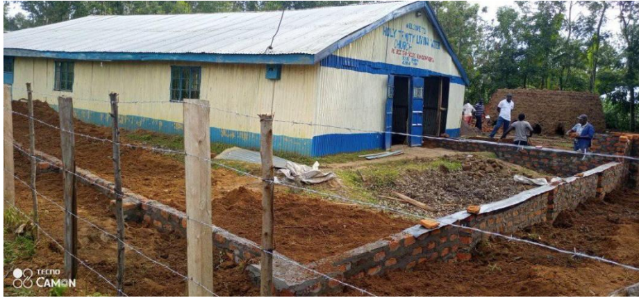
It's really coming along now.