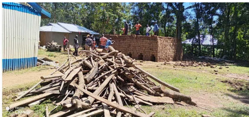
The wood for baking the bricks