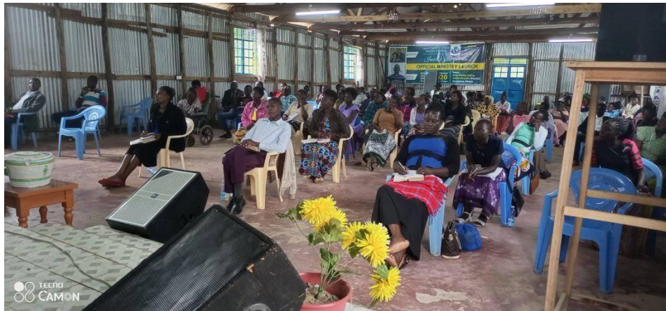
Another picture of those who attended.