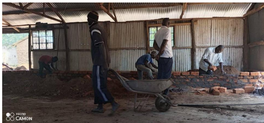
There's pastor watching the brick layers