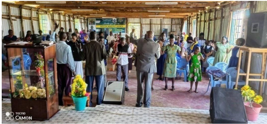
Here they are in prayer and some have come forward.