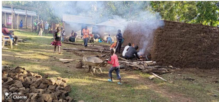
Here they are starting the fire on the bricks