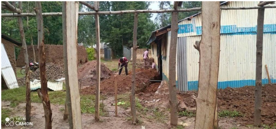
This is hard work