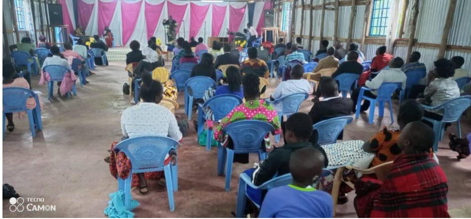
Another picture of those in attendance