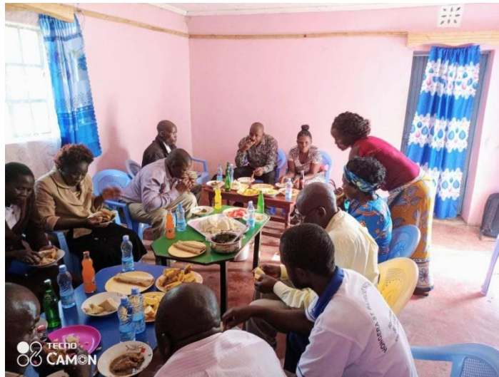
They got to enjoy a meal together.