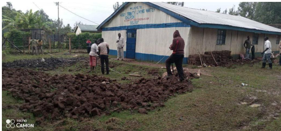
Starting the work