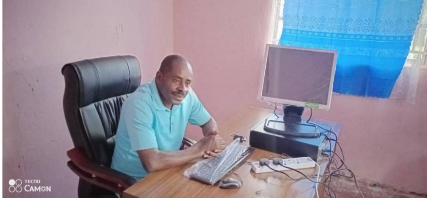
Pastor is finally getting an office