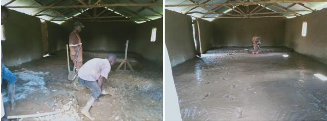
Getting the right mixture. Starting to smooth it out and you can see the foot prints in it on the right.