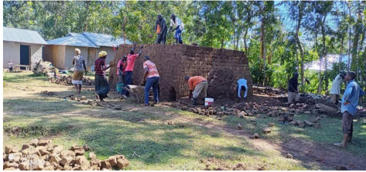
Getting ready to bake the bricks.