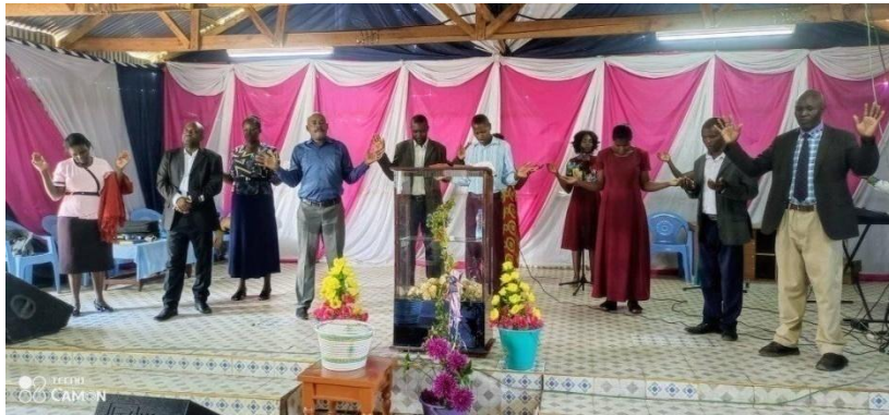
The ministers praying