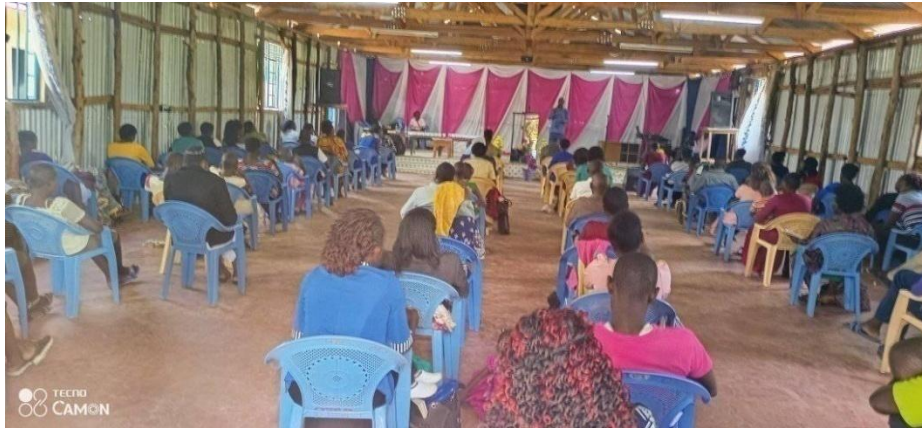
Trying to be spaced apart some because of covid guidelines.