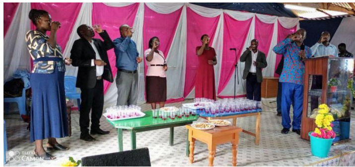
Here is a picture of them drinking the cup of wine or grape juice symbolizing the blood Jesus shed for us.