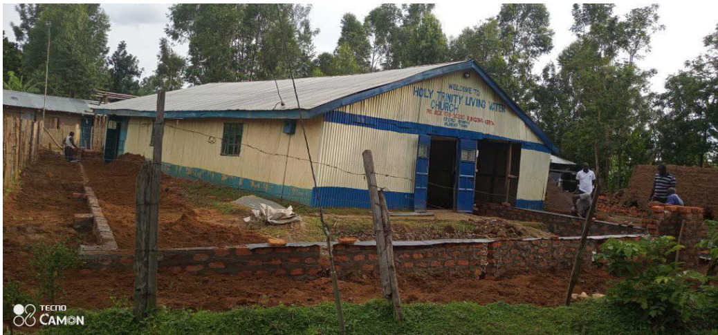
They may have been just moving the church over some and bringing it out further in the front.