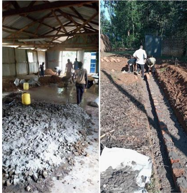
On the left they are making a concrete floor for the church and on the right they are beginning to lay the foundation of bricks for a wall of the church.