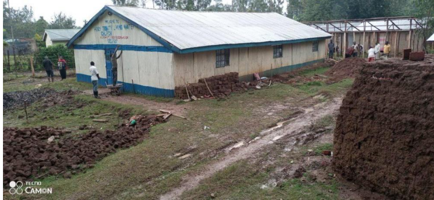
This is a good picture of the church grounds here.