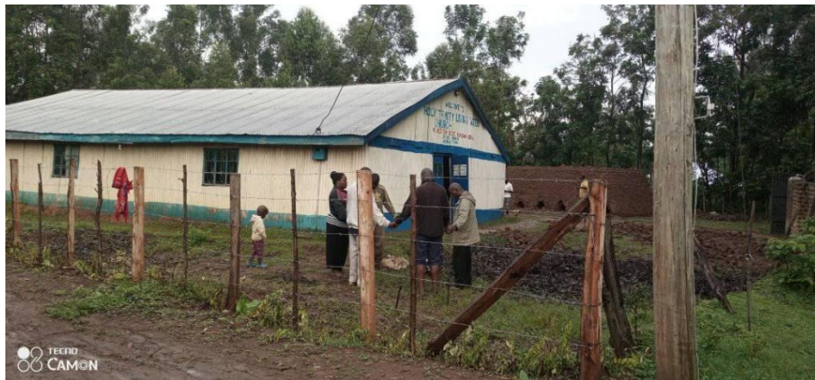
Praying before they begin the work of building the permanent church.