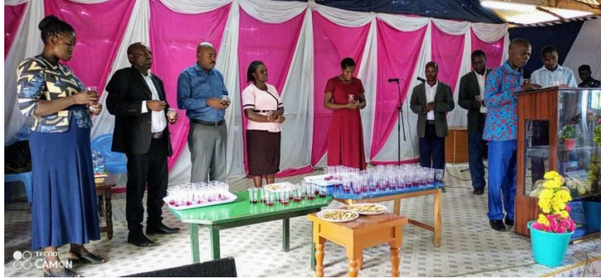
The leaders getting ready to take Holy Communion