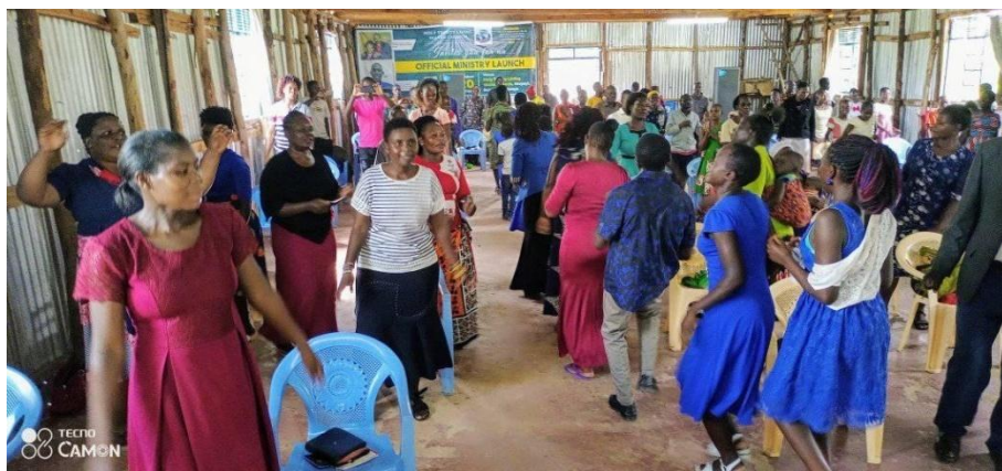
Looks like they are dancing in worship here