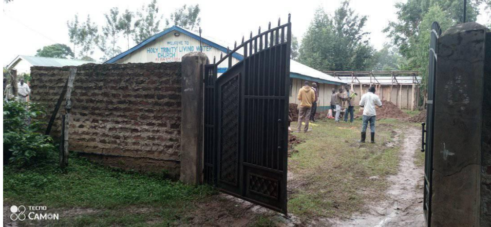
They built this brick wall and we got this gate to secure the church from attacks from the nearby Muslims.