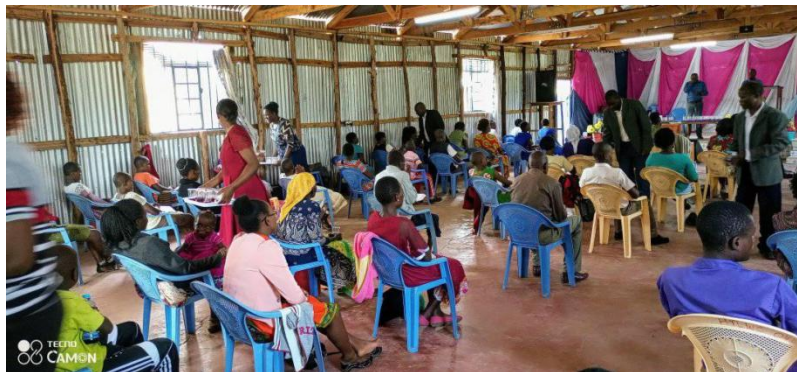
Picture of the church being served the bread and wine.