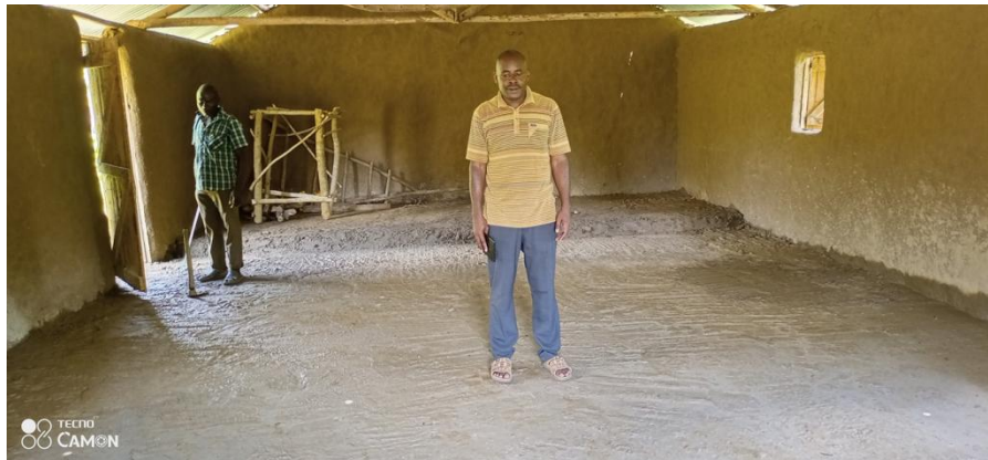
Now look at it, so nice and they made a platform at the head of the church.

More pictures during Holy communion session of our last month Conference at Bungoma Town.