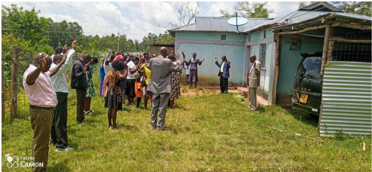
Here they are praying. We thank God for this expansion to the Bungoma church.