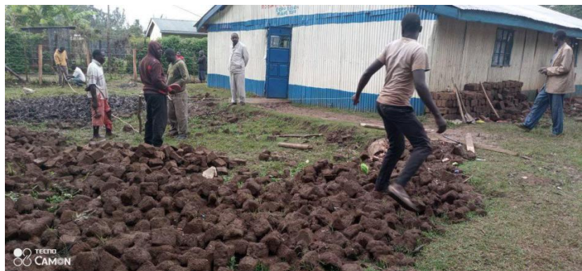
Stretching a line out for the boundaries