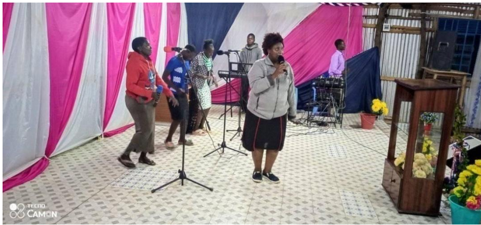
More praise and worship