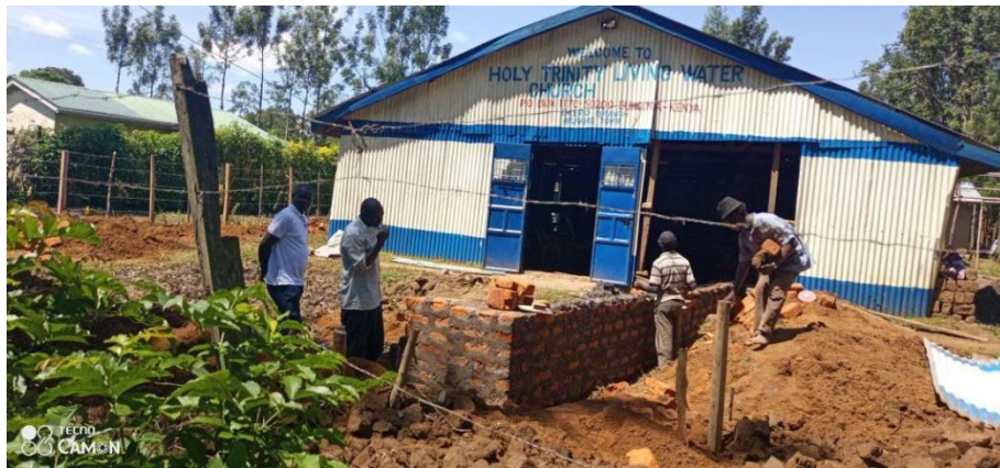
Now you can see where the front of the church is being moved to, expanding and the wall is starting to take shape.