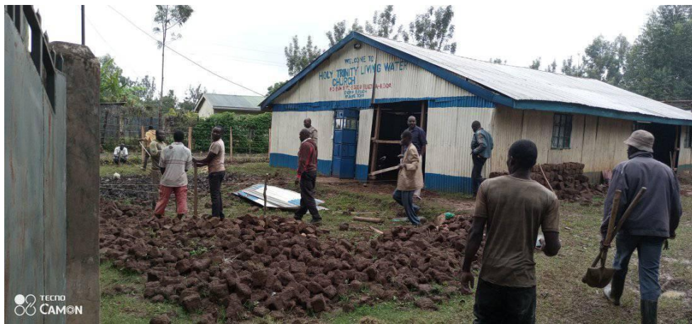
Everyone is working together