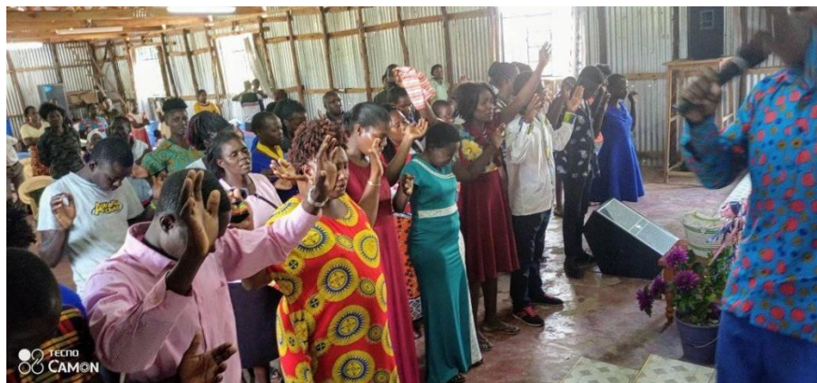
They are down front for prayer.