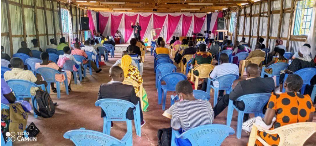
Hearing God's Word