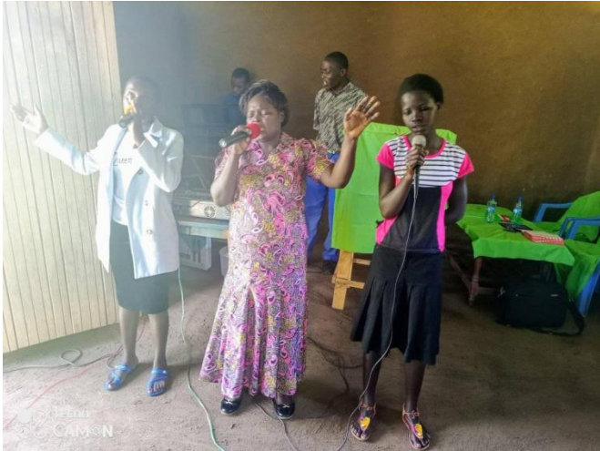
Beautiful, praising God.