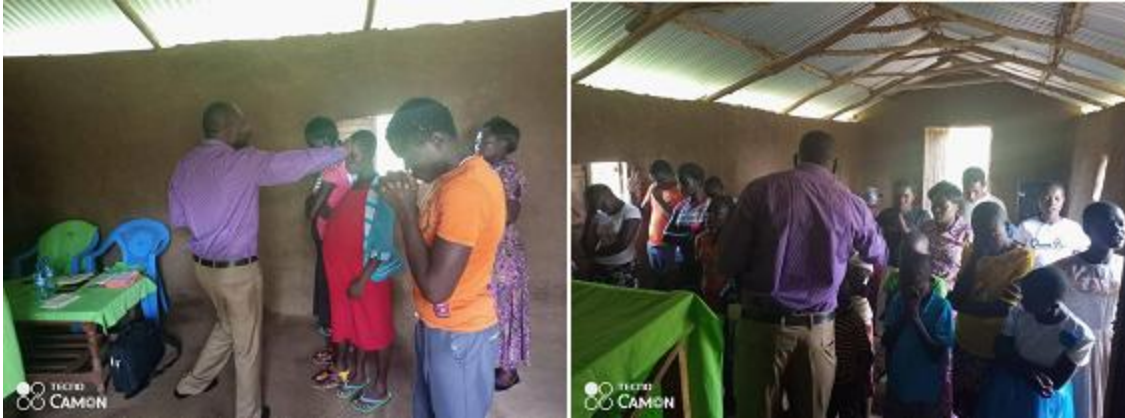
Pastor is laying hands on and praying