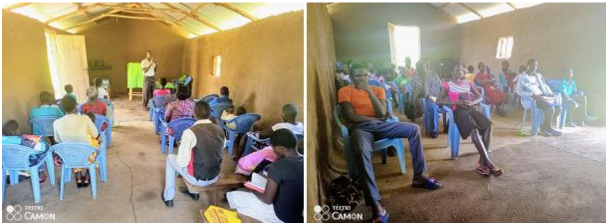
Here is the congregation listening to God's word.