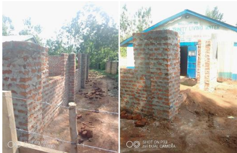
Look at the progress

Thank you all our dear friends and family for supporting and praying for this noble work. God bless you 🙏🙏🙏🙏🙏!!!