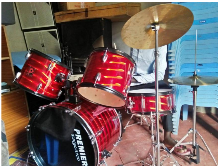
The Bungoma Church was blessed to be able to purchase a new set of drums.