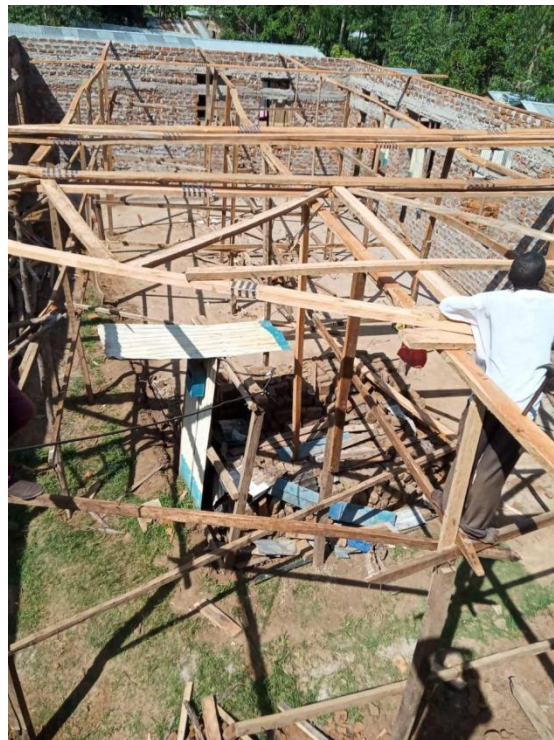
The roof is going up