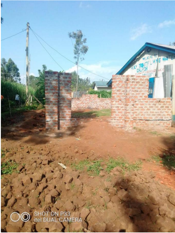
Look how nice it is looking