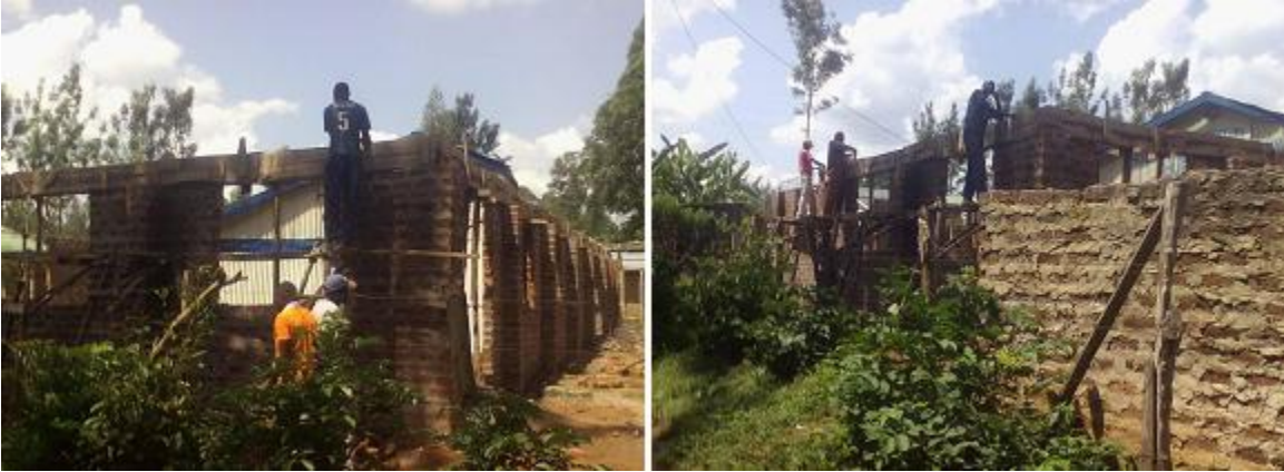
There are the workers laying the bricks