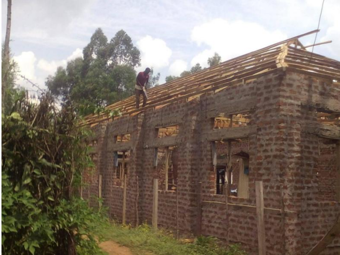
A look down the side of the church.

It's a big deal to have this church made of brick instead of the tree poles and studs that the termites would eat and it would rot out. A permanent structure made of brick is a really big deal. Most of the people are living in houses made of mud.