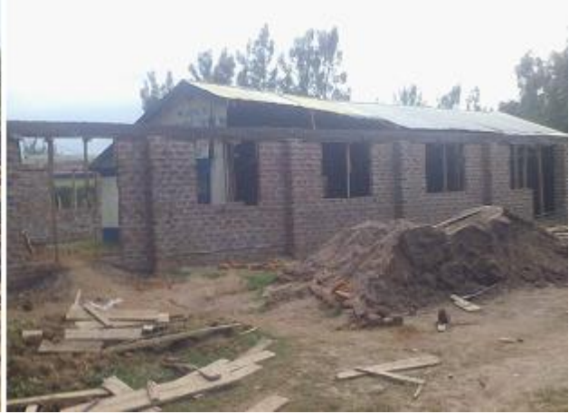
Working on the Lord's church building