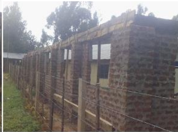
Praise God for this great work!