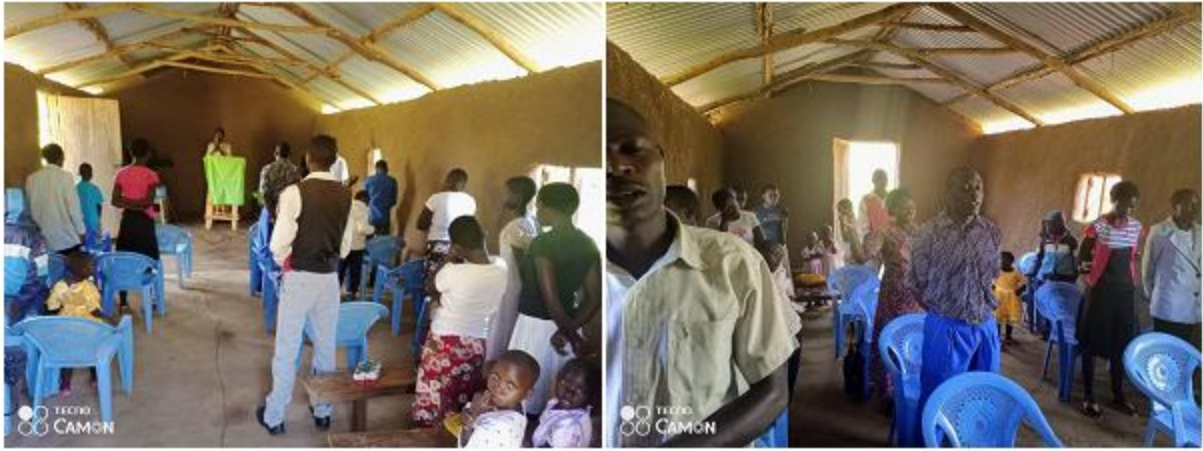
They could be anywhere, I praise God they chose to come to God's House.