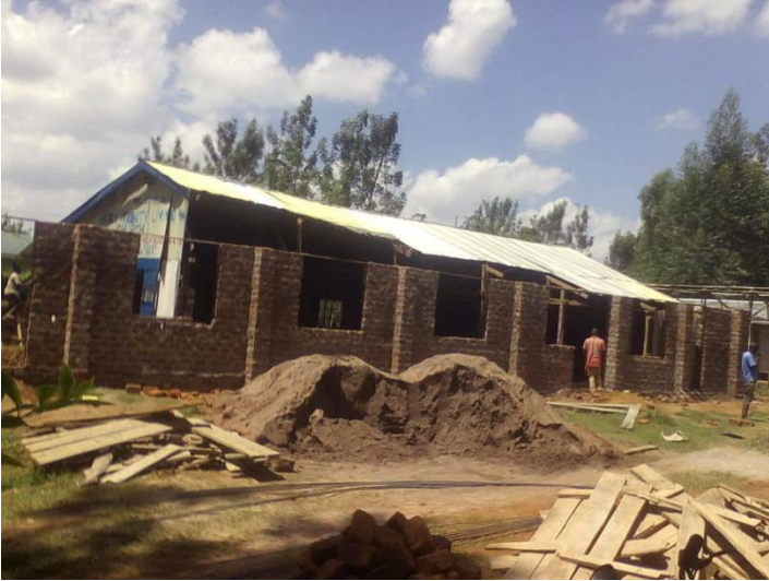
It is coming right along.

Through God's grace we have made good progress in constructing our Holy Trinity Living Water church building, Ekeru-Mumias Town branch. We are trusting God to finish up the walls before end of this month as we trust God to provide for roofing materials.