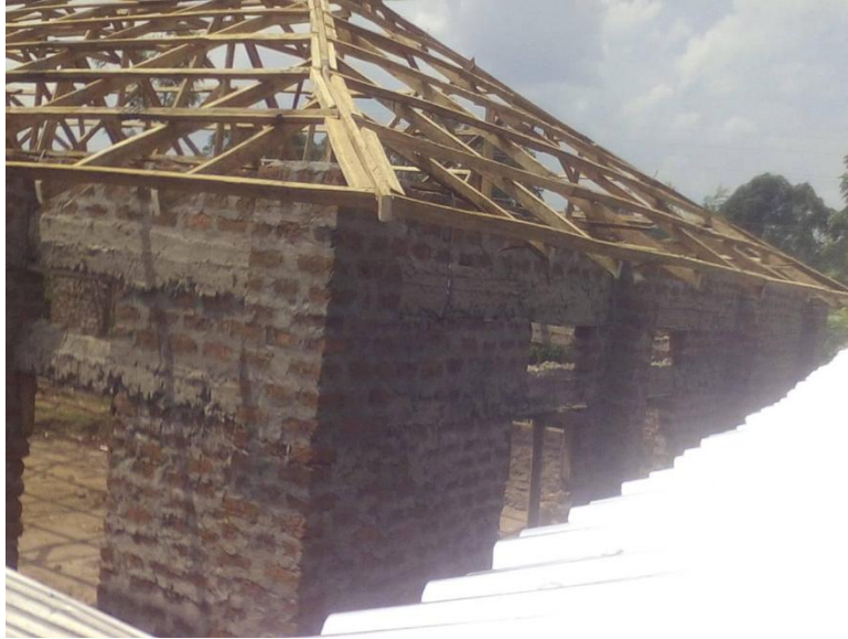
Here's a look from the corner at the work being done on the roof.