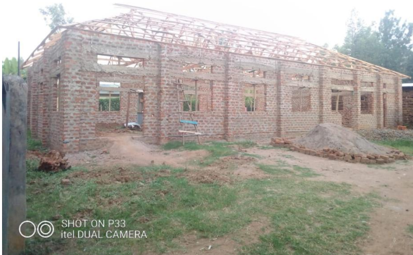
One last picture of the church and how they have progressed with the brick work and roof.