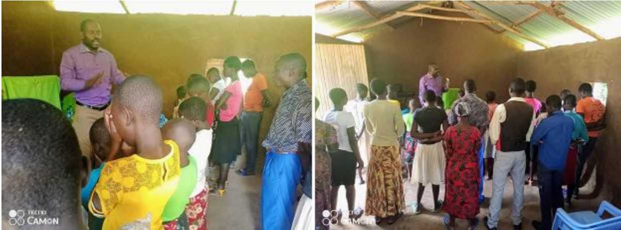
Coming to the front for prayer.