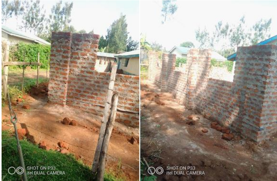
The youth of the church must be very proud of the hard work they did making all those bricks