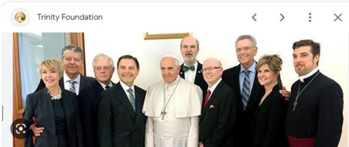
Pope Poses With Wealthy Televangelists – Trinity Foundation