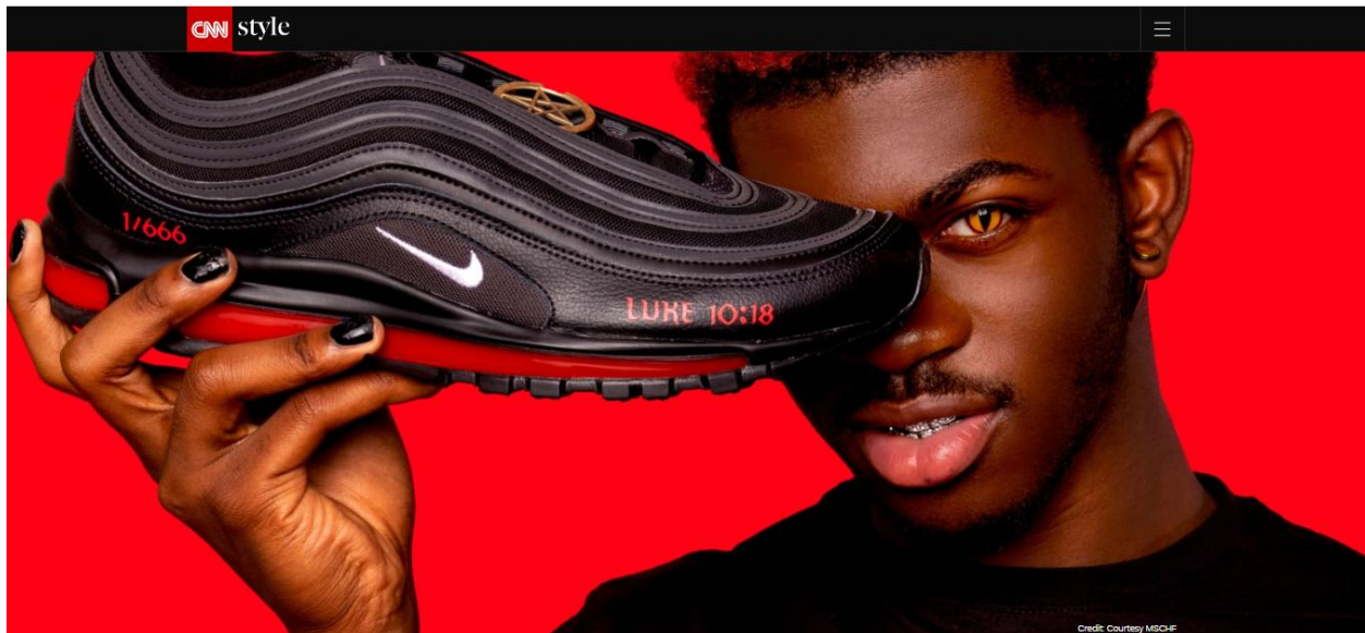
I wanted to revisit this little satan worshipper, Lil Nas X. I could not see this very well without my glasses but on the heel of the shoe is a 1/666. There is supposed to be a drop of blood in this shoe and an upside down cross. The story is that they sold out in less than a minute. As a Christian, you should never own anything like this. It glorifies satan just as Lil Nas X does.

Last week I ended off just after we learned that Job said that after he was tried he would come forth as gold. And we read in Isaiah that God puts us into His fire of affliction to test us. Let's continue right there.