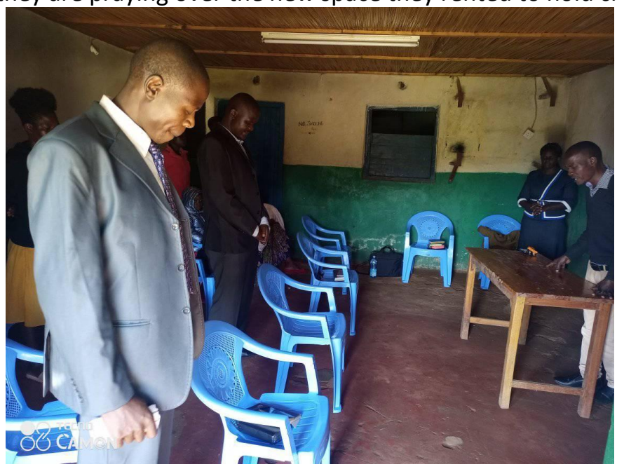
Here they are making more prayers.