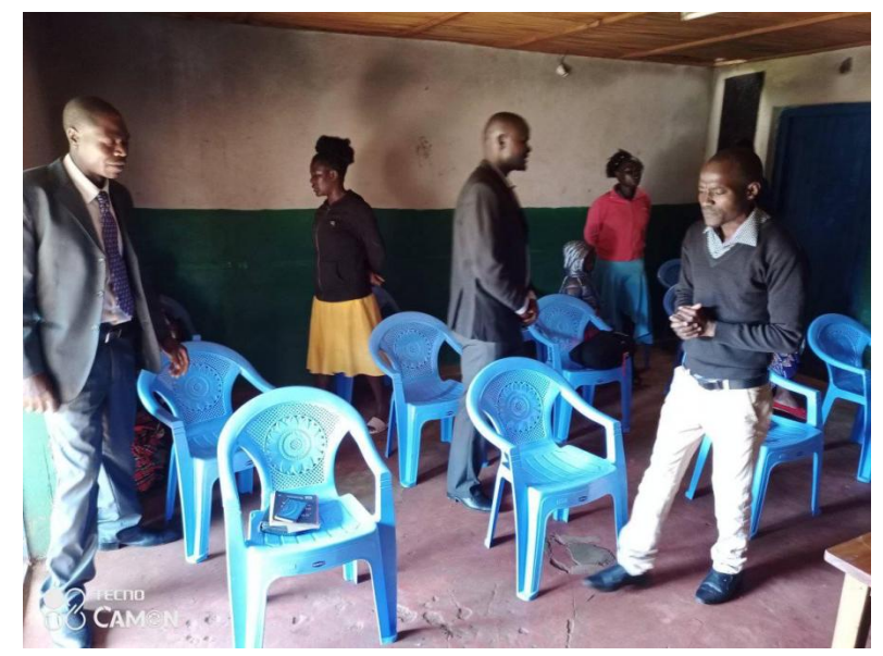
Here they are praying over the new space they rented to hold church.