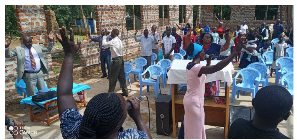
Praising The Lord! Praise The Lord for all those in attendance.