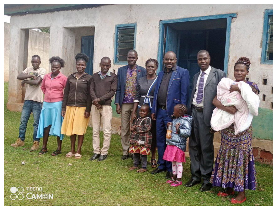
Some of the church members that attended that day.

Traveled today to Samitsi Centre, Kakamega County to dedicate to the Lord a family land of one of our dear brother and leader of Holy Trinity Living Water church. We are trusting God to start ministry work in this area in the near future. Kindly pray with us!!!