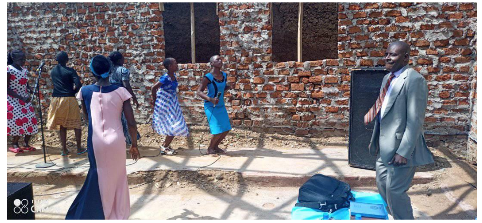
They are dancing before the Lord in praise and worship.