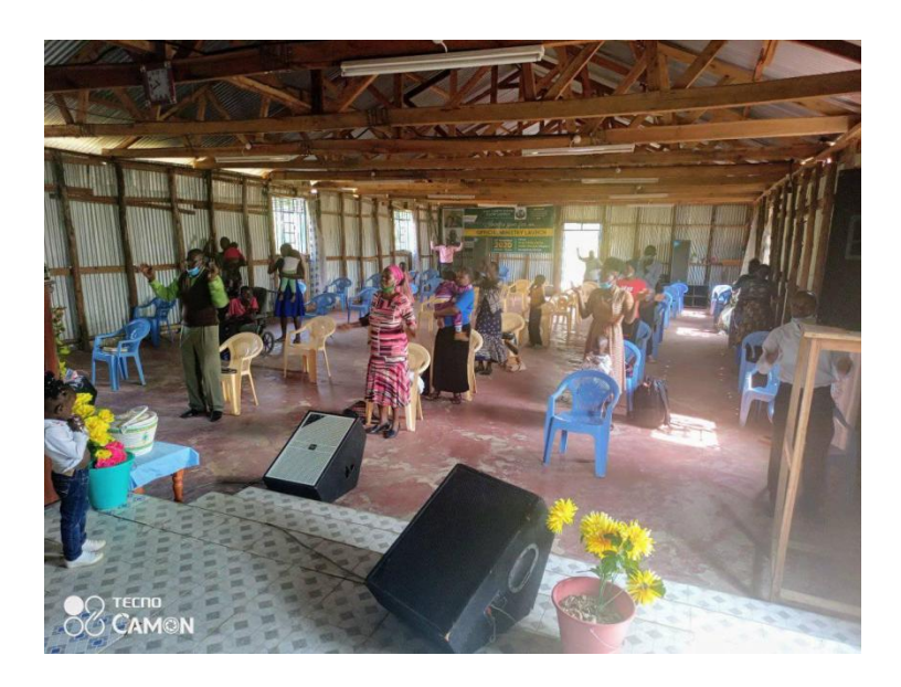
Praise The Lord for those that came out after the long quarantine.