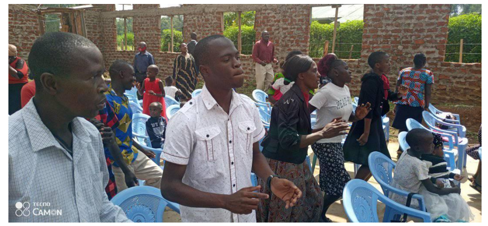
This is during the worship service.