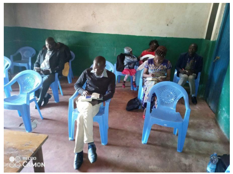
Here they are reading the Word of God. Feeding their spirits.