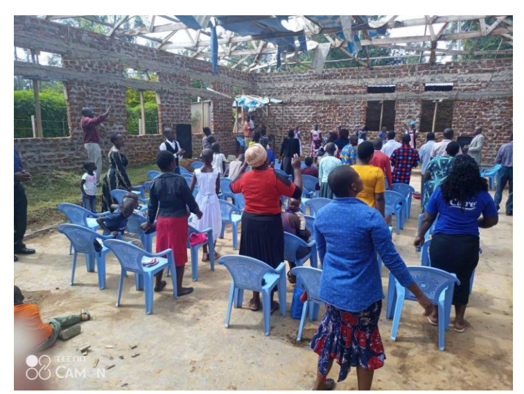
The church has come a long way.