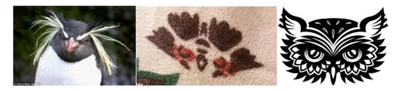
In the middle from the shirt is an owl face or a bird face. Two orange eyes and a beak, with feathers around the face flared out.

Bones are used in witchcraft. I think many times the things God asked the Israelites to do in service of Him was to keep them out of witchcraft which is what the pagan nations all around them practiced.