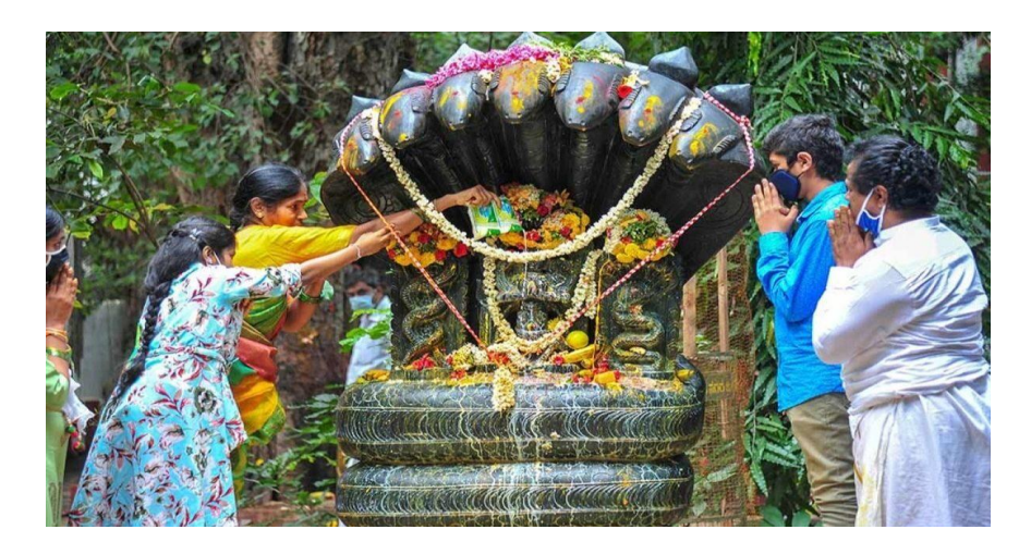
Hindu's worship serpents in a festival called Naag Panchami. The serpent always represents satan.