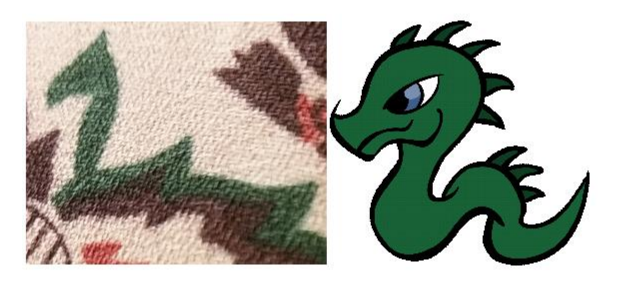
This is the serpent or serpent-dragon. See its raised head and sort of a slightly darkened center to it.