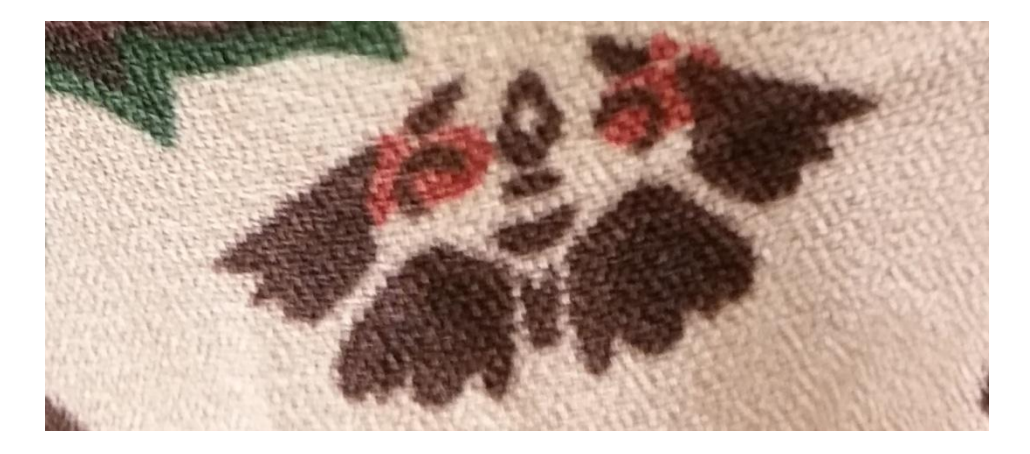
Flip it upside down and it is another face.