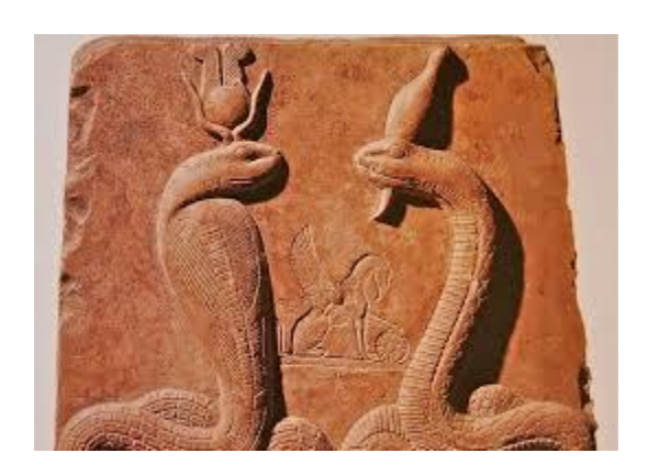
Serpents were worshipped in Egypt as sun gods.