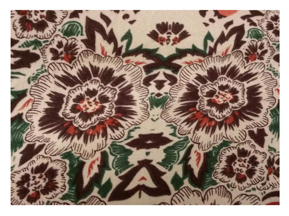
Here in the middle you see the owl face, then the bull face, then the devil and they are all stacked on top of each other.

Looks like droopy eyes, a nose and a mouth with a tongue sticking out. When a person is possessed by a demon or has a lot of demonic activity in their lives, they will stick their tongue out a lot just like we saw Myley Cyrus doing all the time.