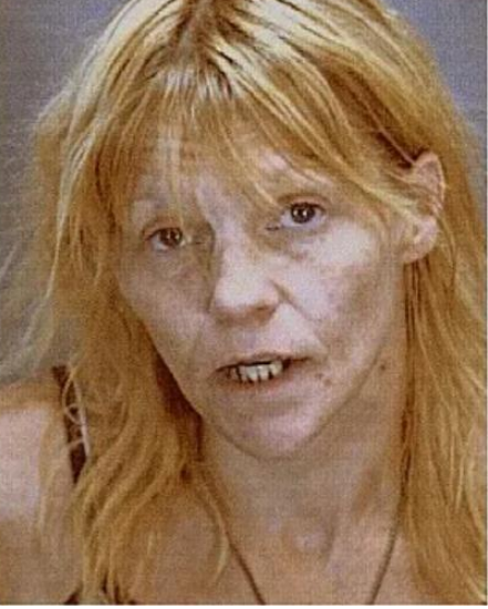
Page 4 of 11