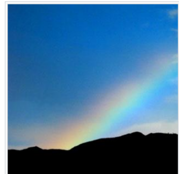
The rainbow is the unofficial symbol of Noahidism , recalling the Genesis flood narrative in which a rainbow appears to Noah after the Flood; it represents God's promise to Noah to refrain from flooding the Earth and destroying all life again . [1]

The seven Noahide laws as traditionally enumerated in the Babylonian Talmud Sanhedrin 56a-b and Tosefta Avodah Zarah 9:4 , [21] are the following: [22]